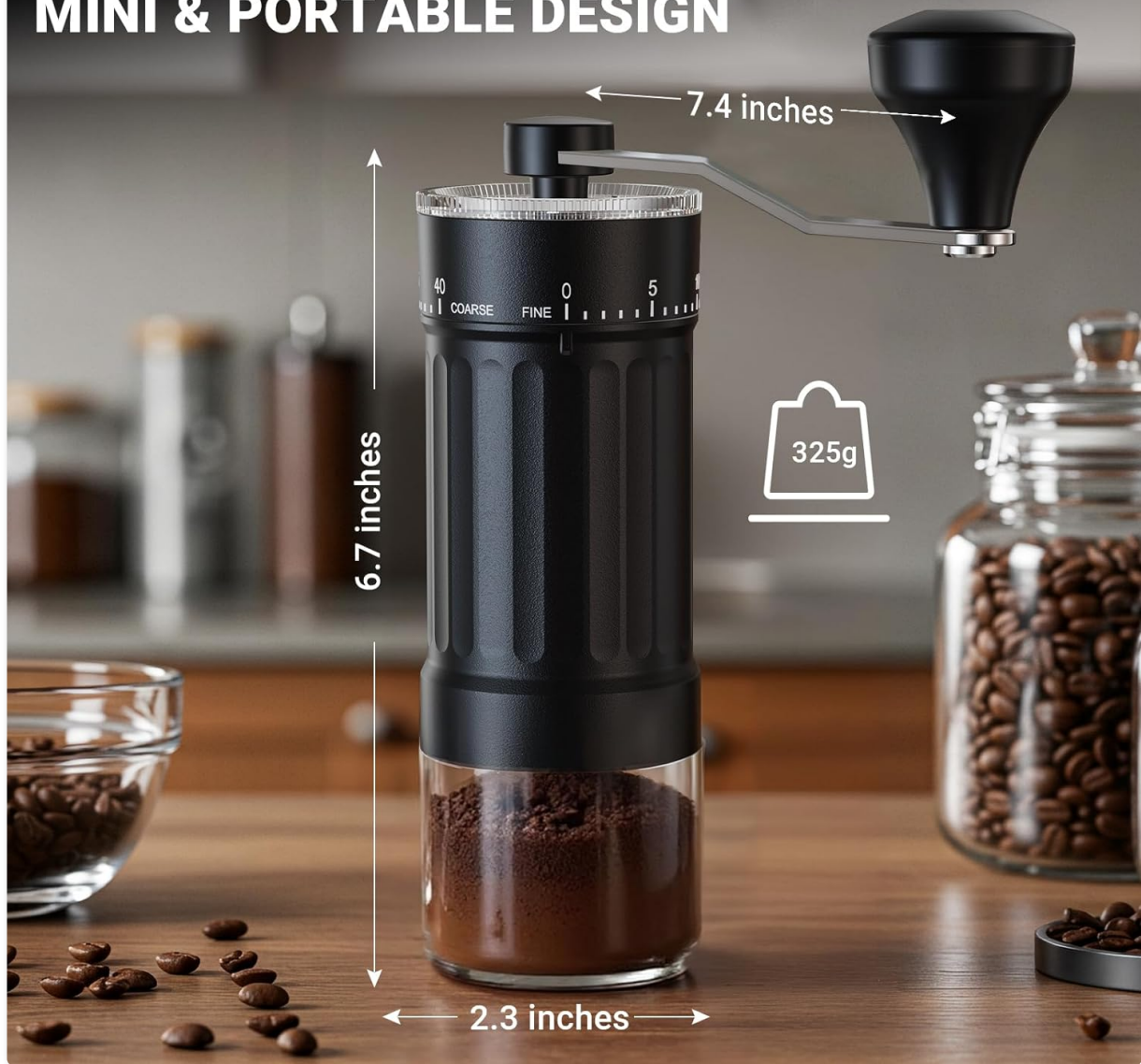
Image 7.1: Visual representation of the grinder's compact dimensions and weight, emphasizing its portability.