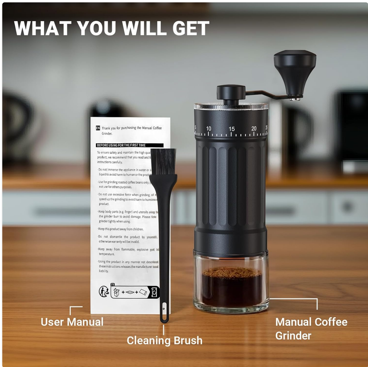
Image 2.1: The package contents, showing the manual coffee grinder, a user guide, and a cleaning brush.