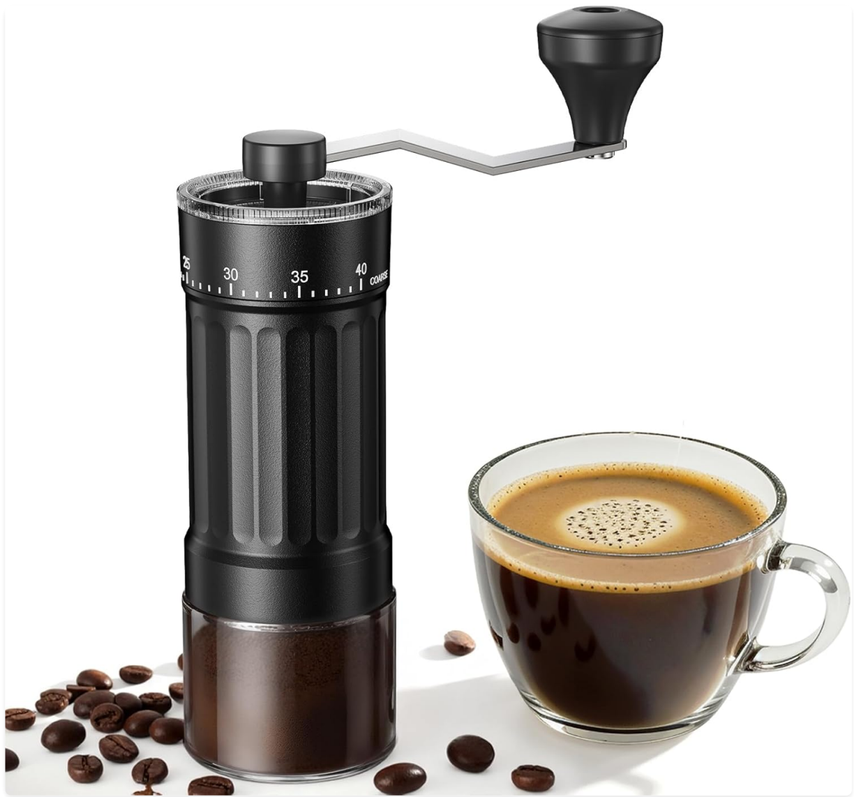
Image 1.1: The CEVING Mini Manual Coffee Grinder, shown alongside roasted coffee beans and a freshly brewed cup of coffee, highlighting its purpose.