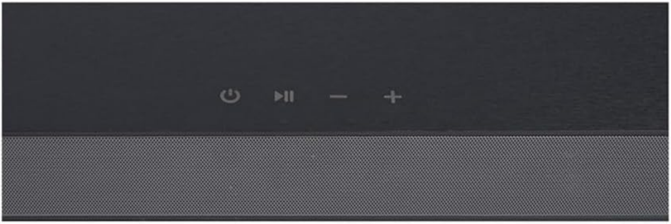
Image 6: Close-up of the soundbar's touch-sensitive control panel.