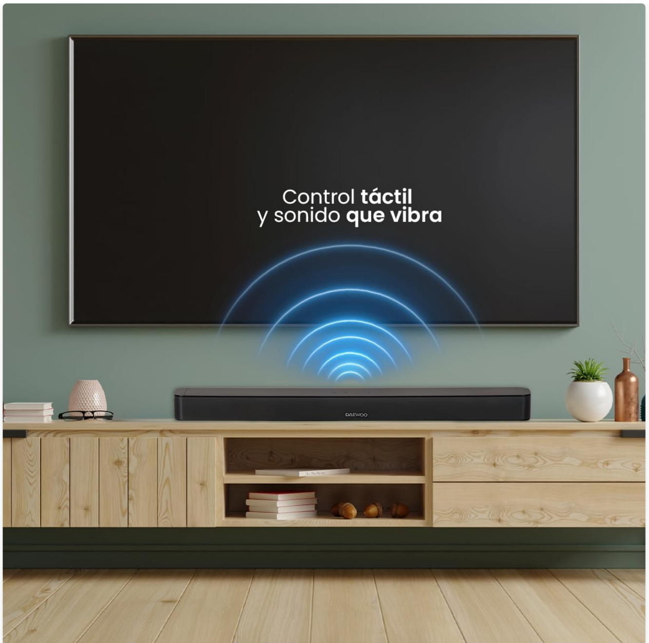
Image 2: Soundbar enhancing audio experience with visual sound waves.