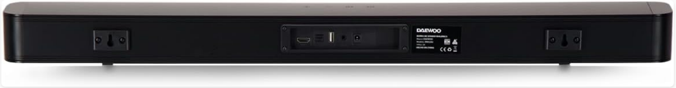
Image 3: Rear view of the soundbar, highlighting wall-mounting options.

Place the soundbar on a stable, flat surface directly in front of your television. Ensure there are no obstructions in front of the soundbar to allow for optimal sound projection. The soundbar can also be wall-mounted using appropriate hardware (not included).