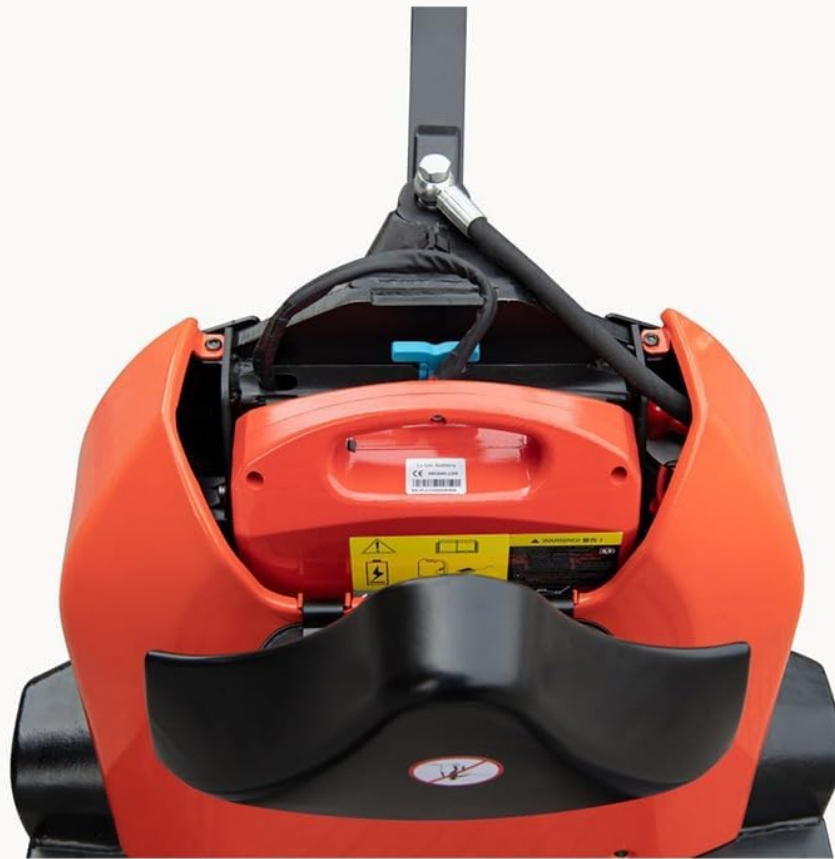
Figure 3.4: Battery Compartment Access