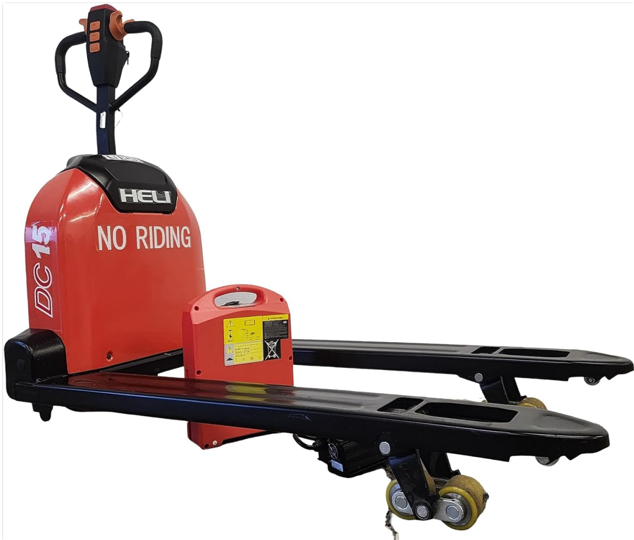
Figure 1.1: HELI 48" x 27" Full Electric Pallet Jack (Model CBD15J-Li3)