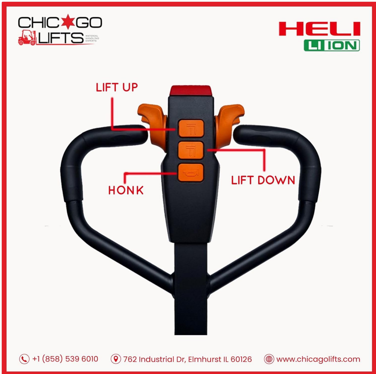
Figure 3.1: Control Handle with Lift, Lower, and Honk Buttons