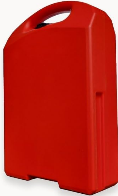
Figure 3.3: Removable Battery Pack