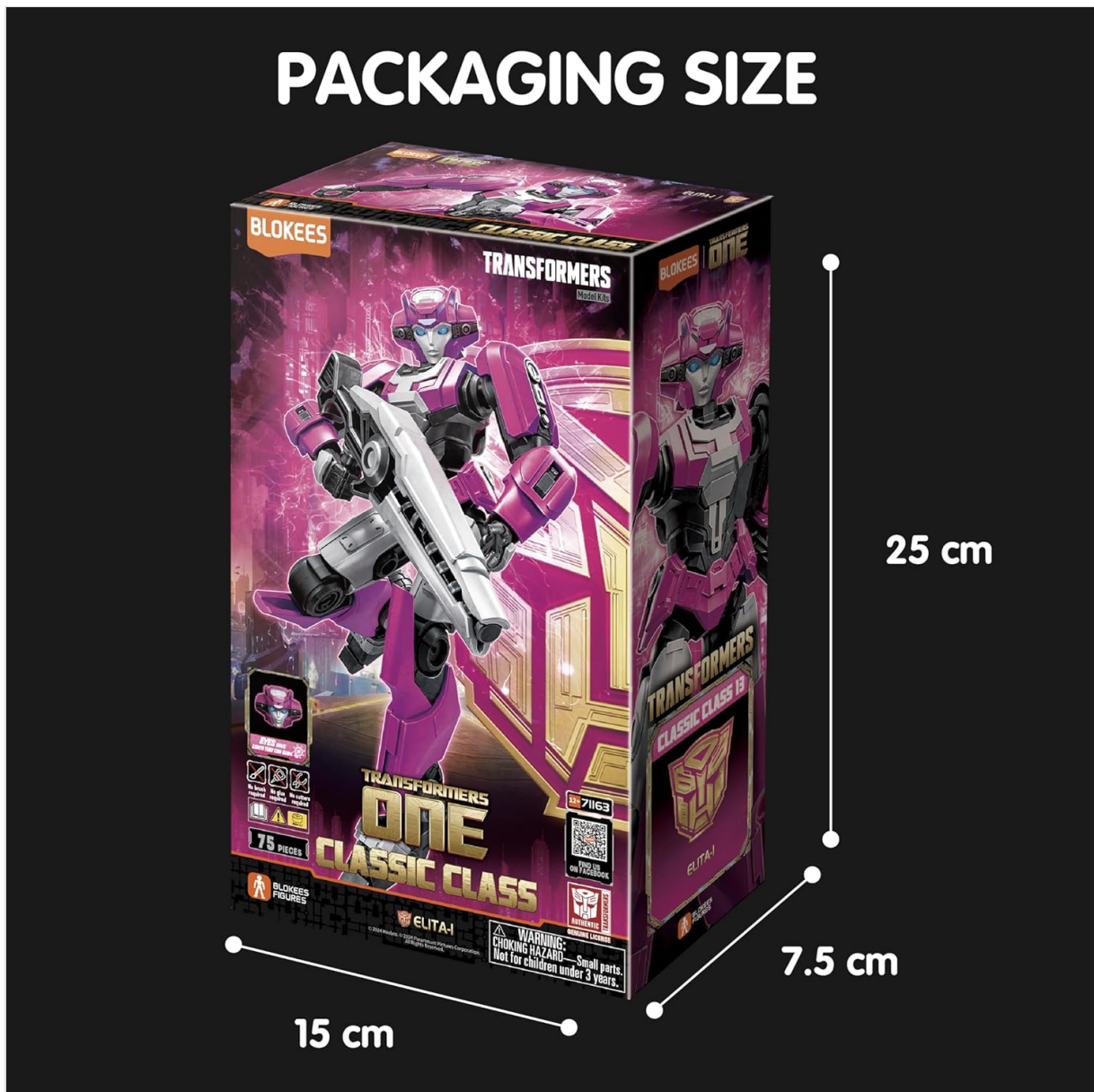
Figure 8.1: Packaging dimensions of the Elita-1 figure.