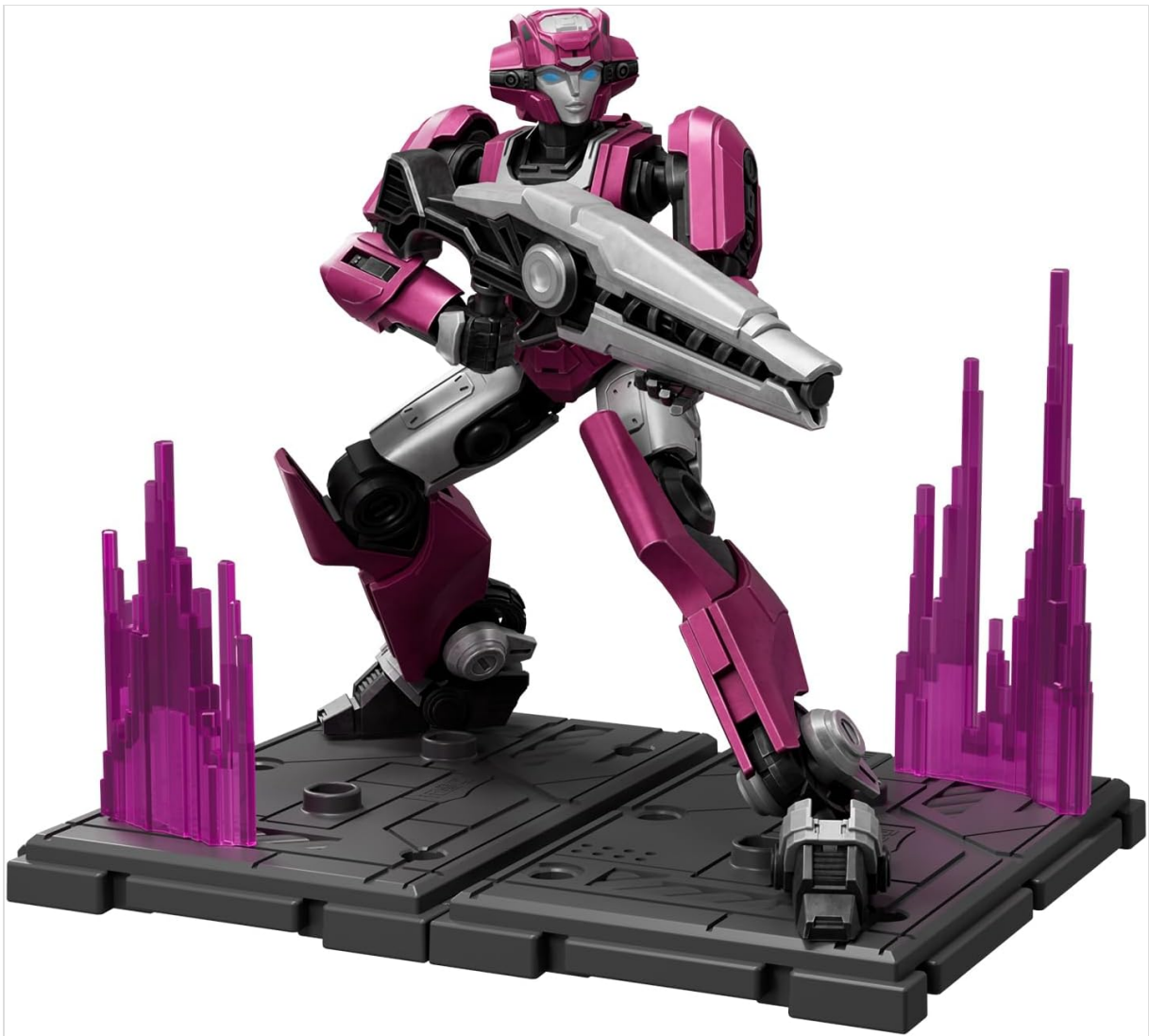
Figure 5.2: Elita-1 displayed on its stand, showcasing articulation and accessories.