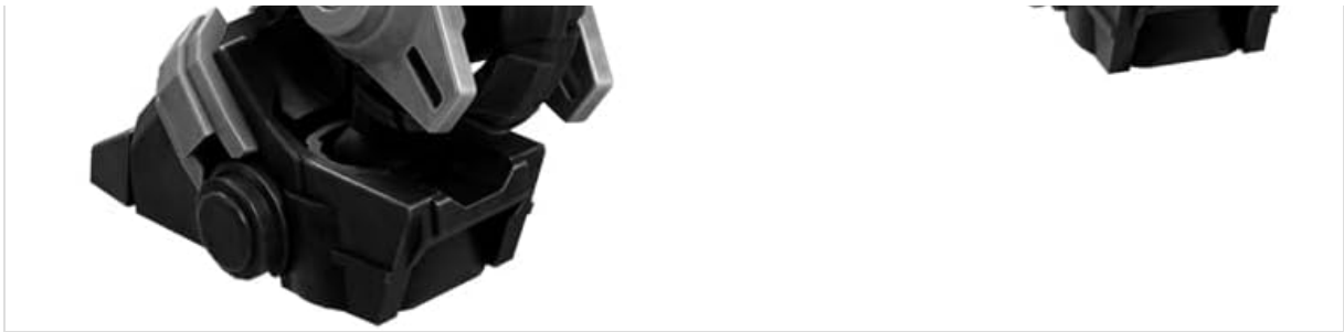
Figure 4.2: Back view of the fully assembled Elita-1 figure.