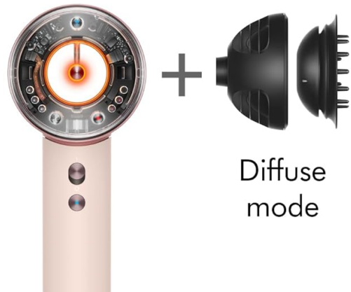
Image: Hair styled with the Wave+ Curl diffuser in Diffuse mode for textured curls.

Air is gently diffused through longer prongs to reach deeper into the hair, for textured, voluminous curls and coils.