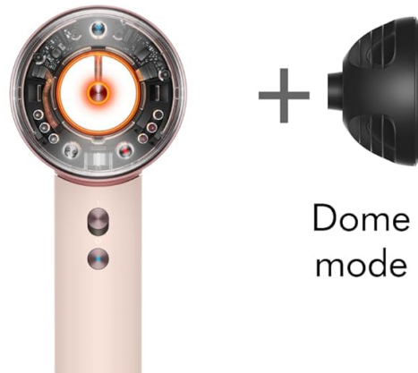
Image: Hair styled with the Wave+ Curl diffuser in Dome mode for natural waves.

Airflow infuses hair to enhance natural waves or curls, for a more defined finish. 4