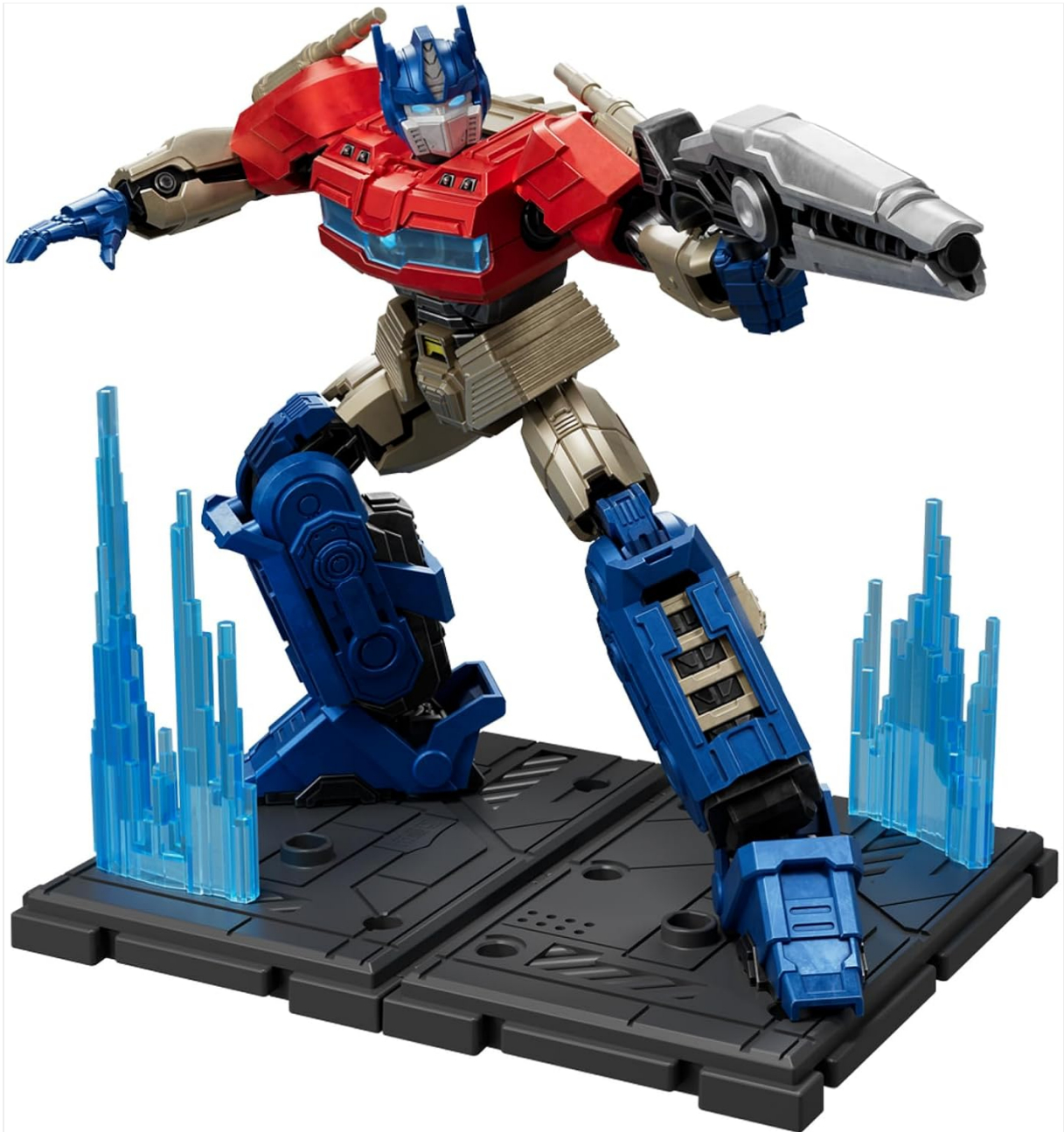
Figure 2: Fully assembled Optimus Prime figure on its display stand.