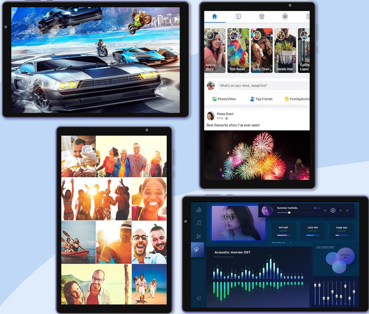
Figure 4: Expandable Storage

This image demonstrates the tablet's storage capabilities, featuring 32GB of internal ROM and the option to expand up to 1TB using a Micro SD card.