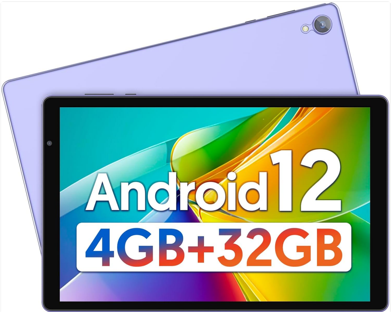
Figure 1: BAKEN 10-inch Android 12 Tablet Overview

This image displays the front of the BAKEN 10-inch tablet, highlighting its Android 12 operating system and memory configuration of 4GB RAM and 32GB ROM.