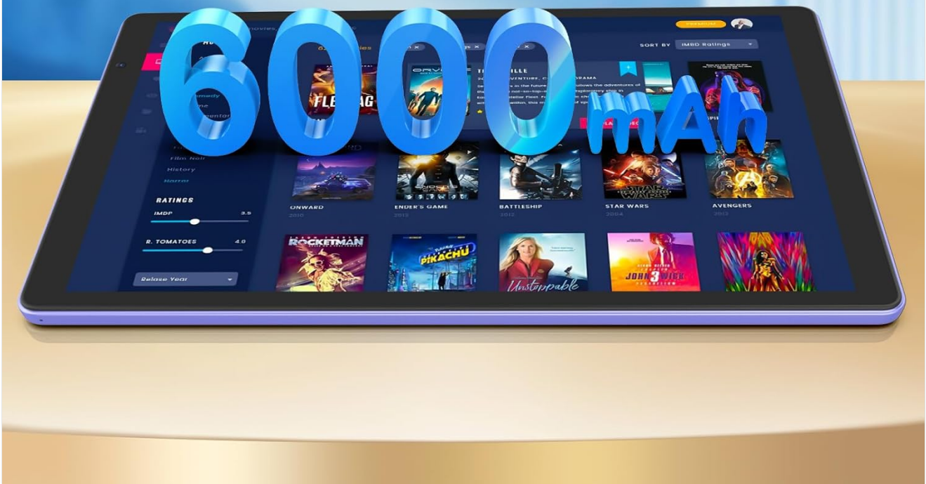
Figure 5: 6000mAh Long-Lasting Battery

This image illustrates the tablet's 6000mAh battery capacity, highlighting its endurance for up to 6 hours of gaming, video playback, or web browsing.