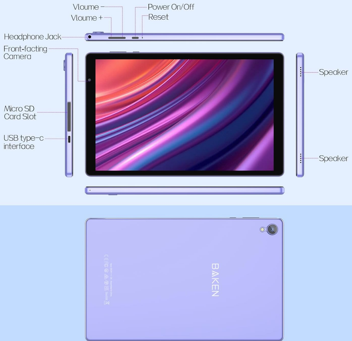
Figure 2: BAKEN Tablet Ports and Buttons

This diagram illustrates the location of key features on the BAKEN tablet, including the headphone jack, volume controls, power button, reset pinhole, front camera, Micro SD card slot, USB Type-C port, and dual speakers.