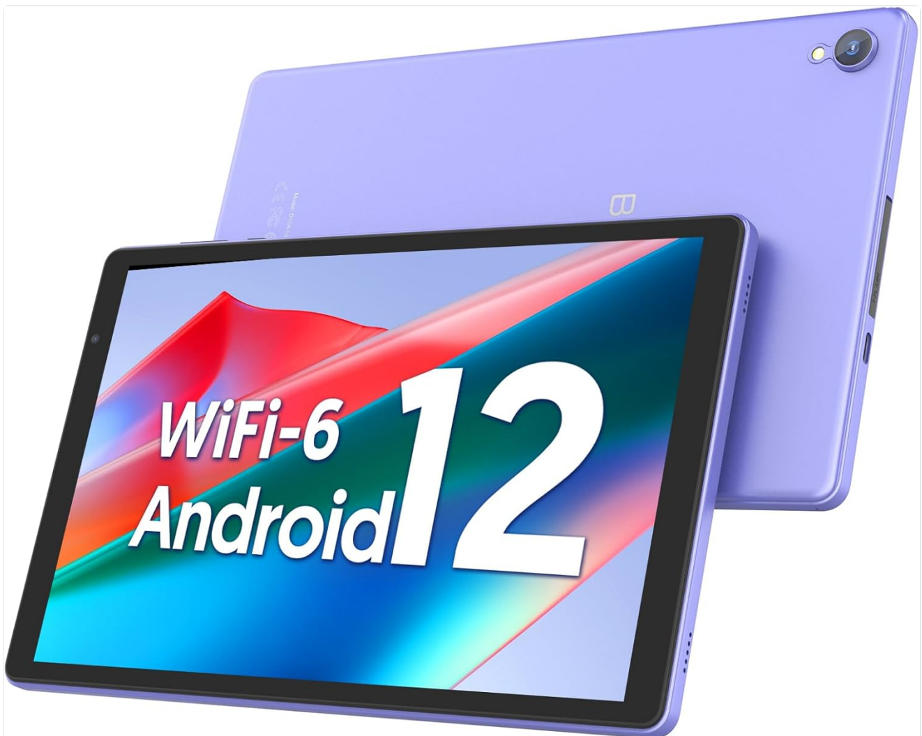
Figure 3: Wi-Fi 6 Connectivity

This image highlights the tablet's support for Wi-Fi 6, indicating advanced wireless connectivity for faster and more stable internet access.