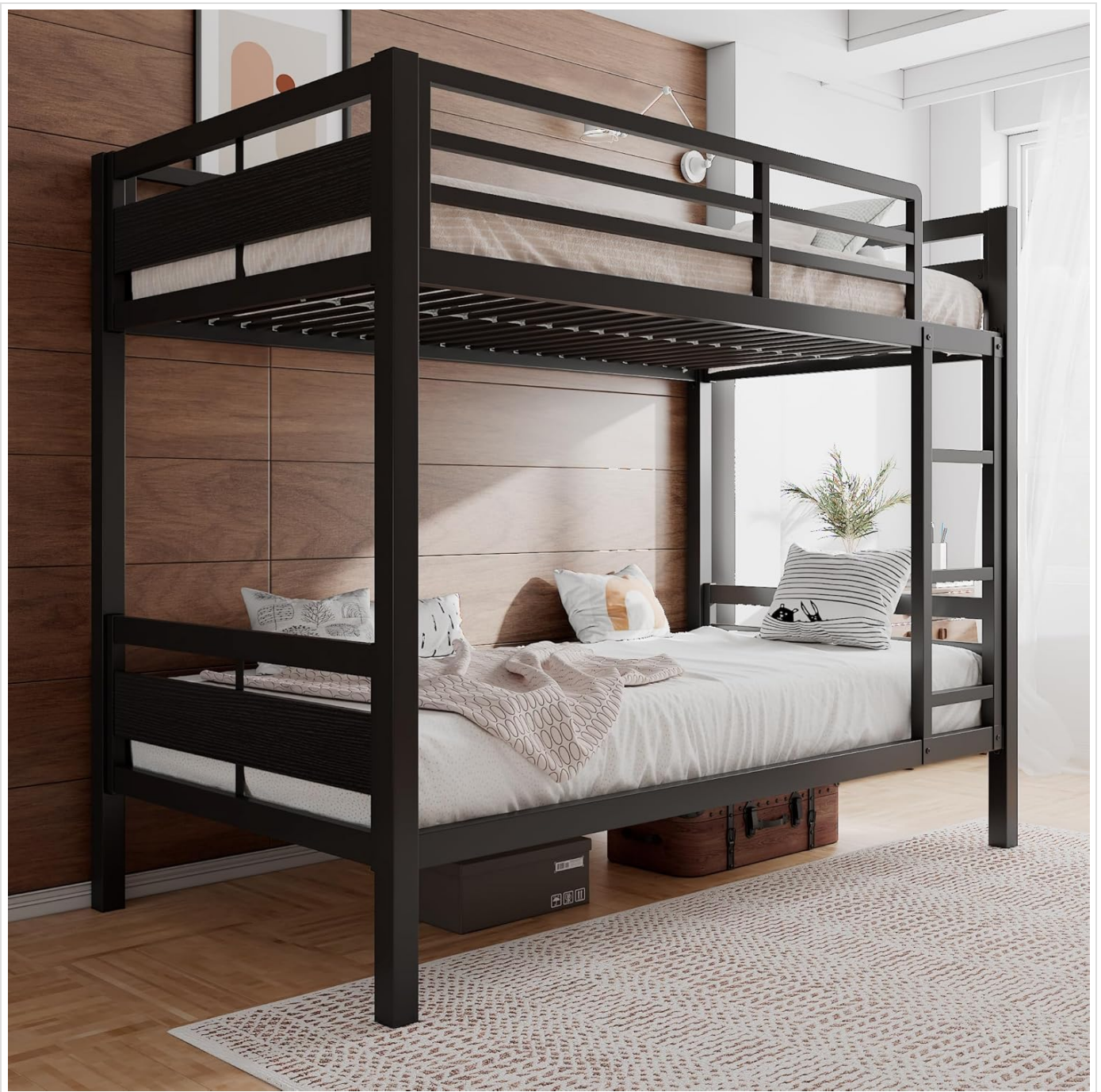
Image: The Einhorn Twin Over Twin Bunk Bed, showcasing its black metal frame and space-saving design in a modern bedroom.