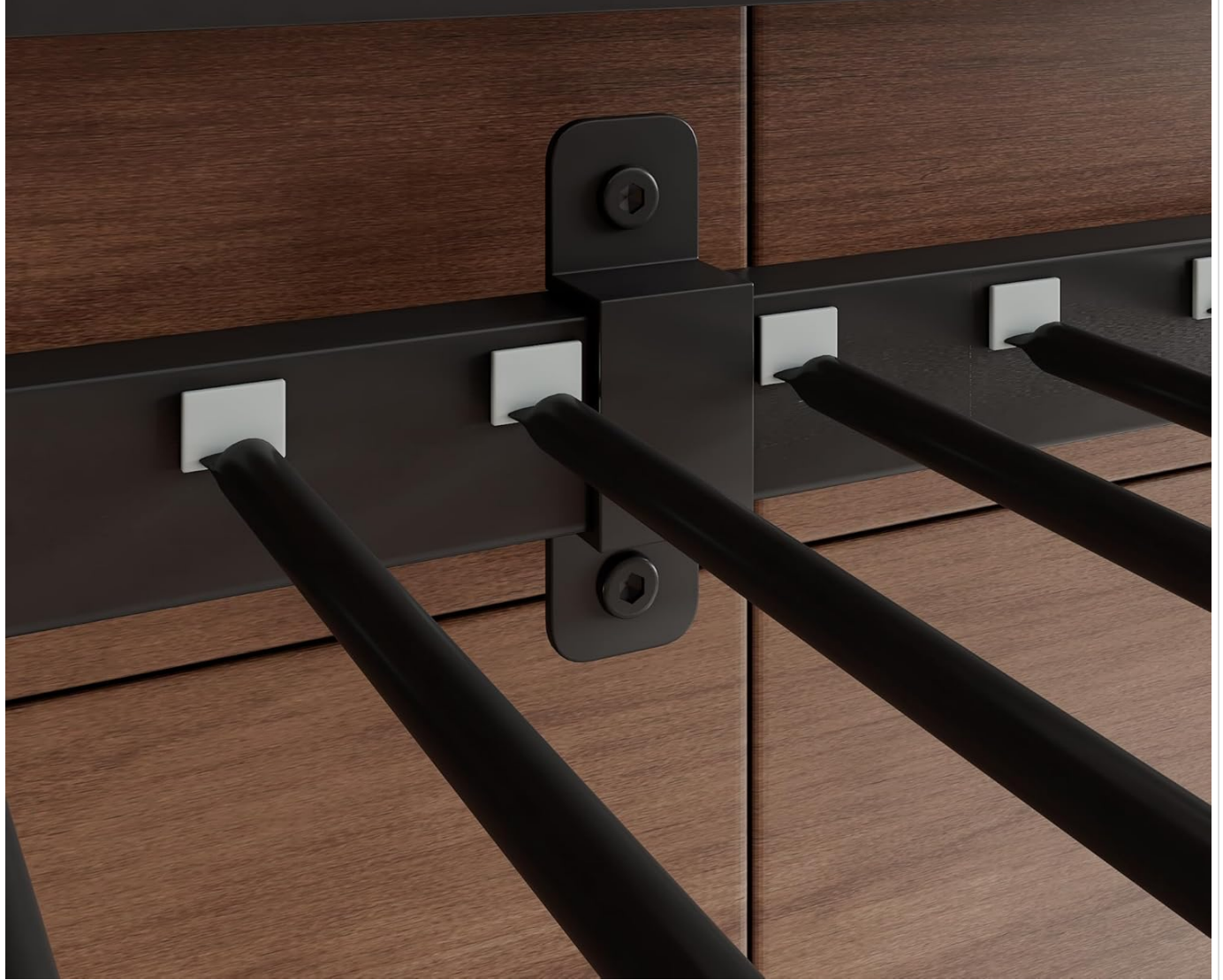
Image: Illustration of the wall anchoring system, designed to prevent bed movement and enhance stability.

Prevent the bed from swaying or tipping over, especially to ensure no wiggling and wobbling