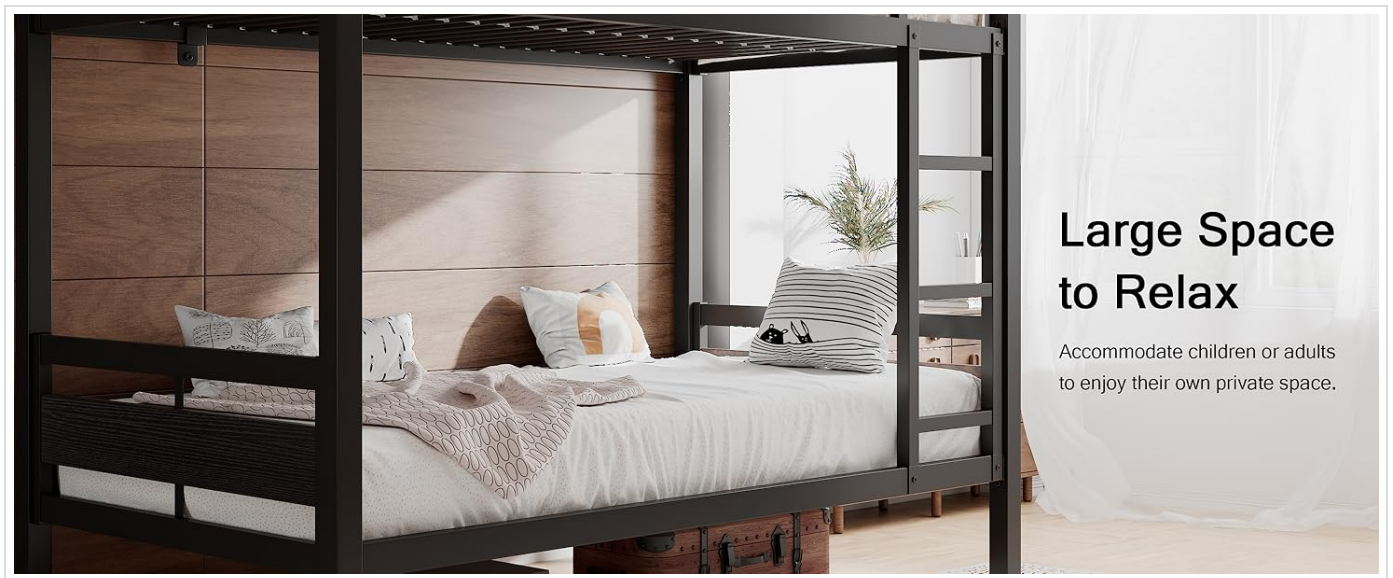
Image: The 12-inch under-bed storage space, ideal for maximizing floor area and organizing belongings.