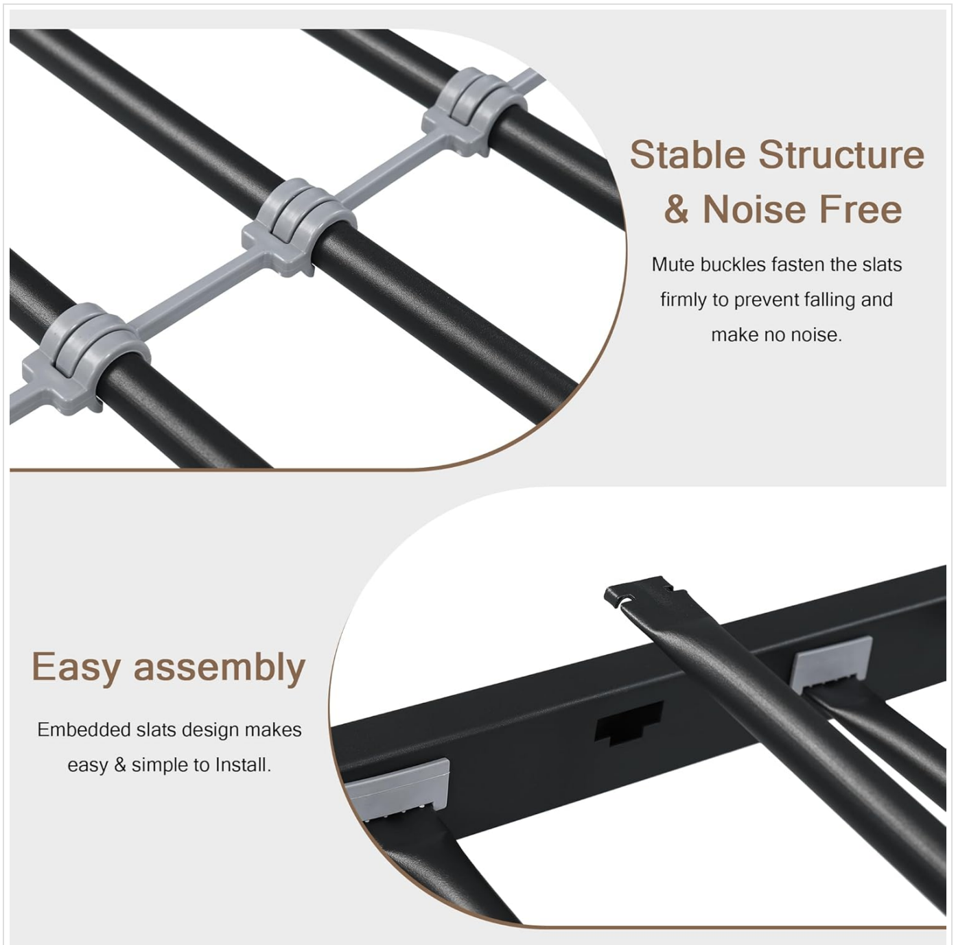
Image: Detail showing the stable structure with mute buckles for noise reduction and the embedded slat design for easy assembly.