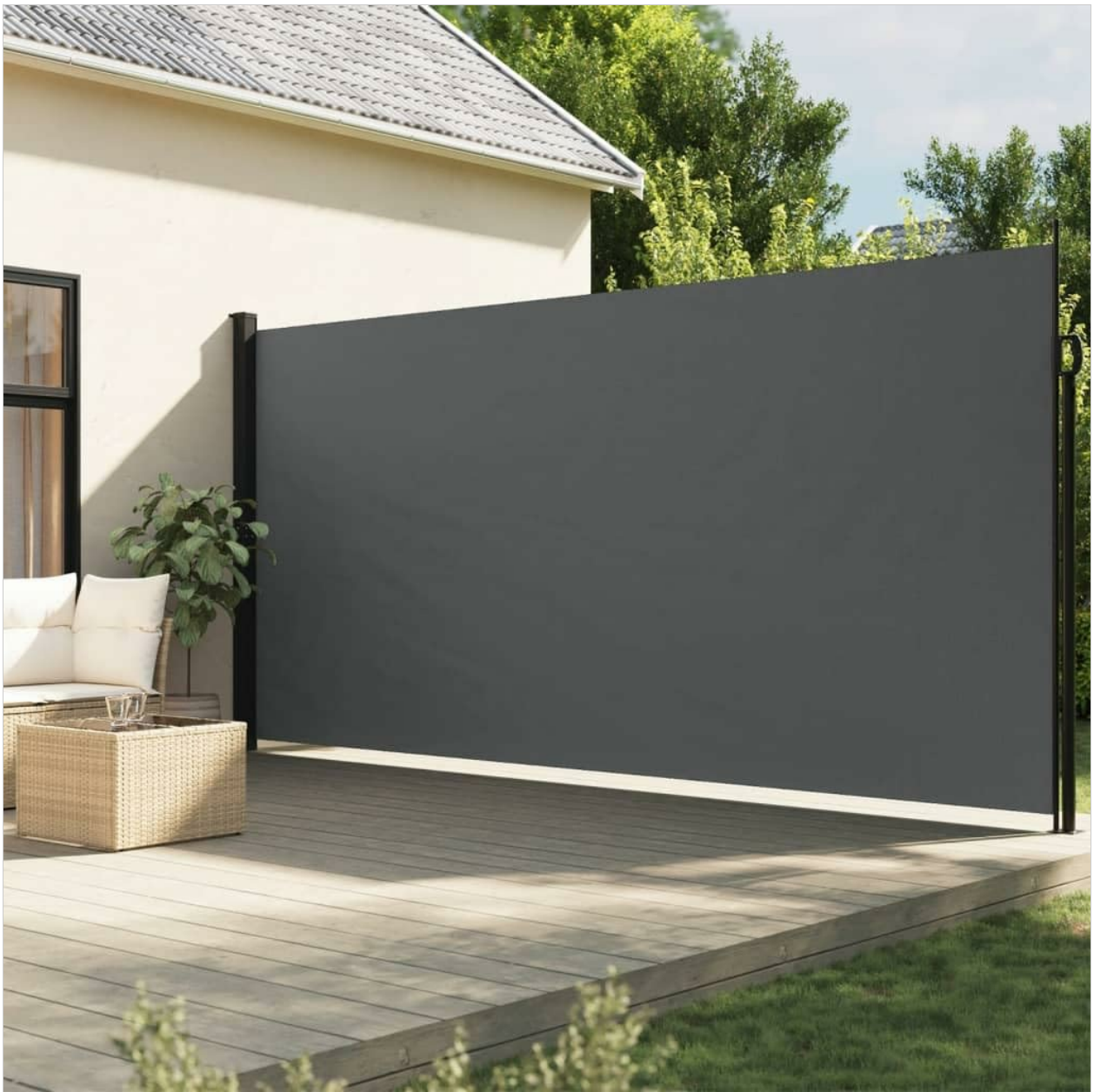
Image: The Generico Retractable Side Sun Blind in its extended position, providing privacy and shade.