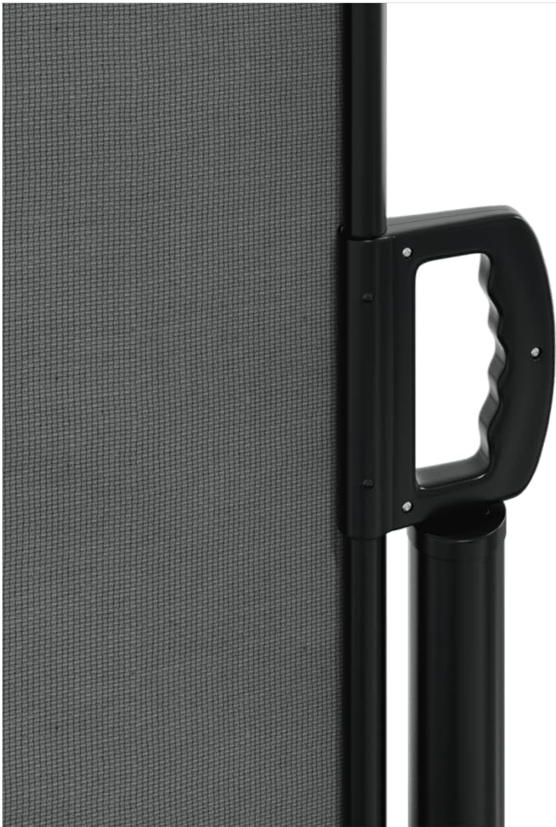
Image: A detailed view of the handle mechanism, showing how it connects to the receiving post for securing the blind.