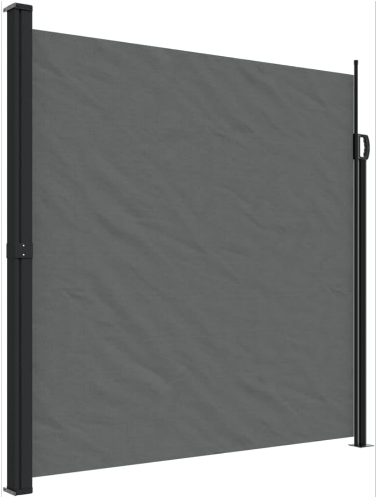
Image: The retractable side sun blind fully installed and extended, demonstrating its functional appearance.