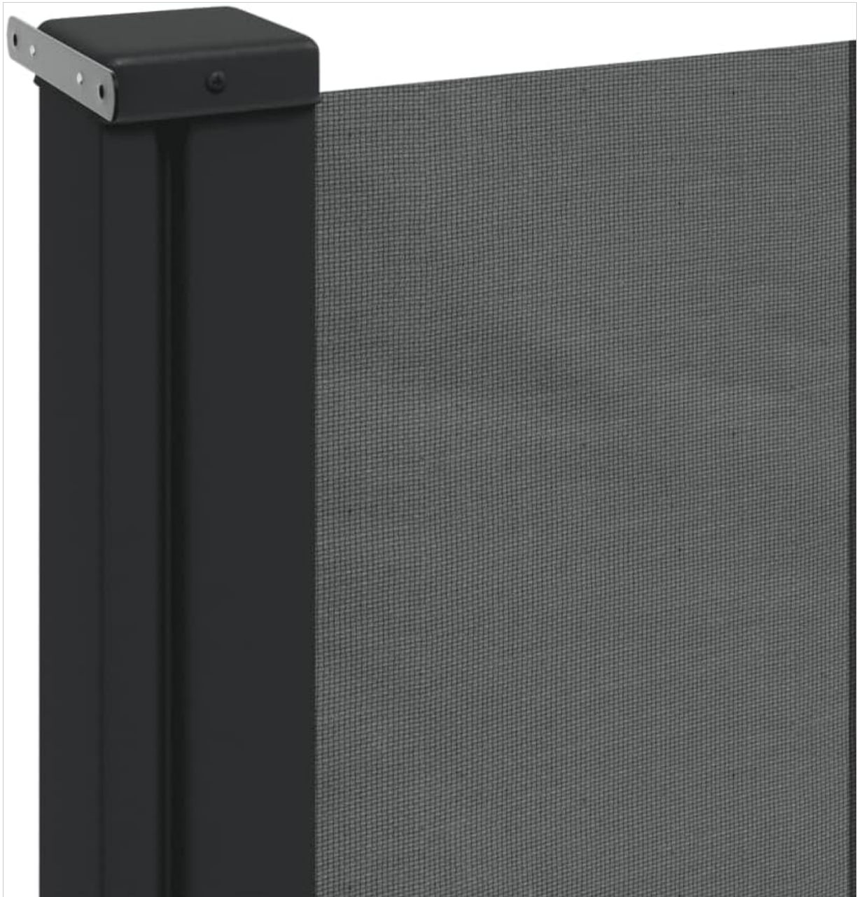
Image: Close-up of the top mounting bracket for the main blind post, showing how it attaches to the wall.