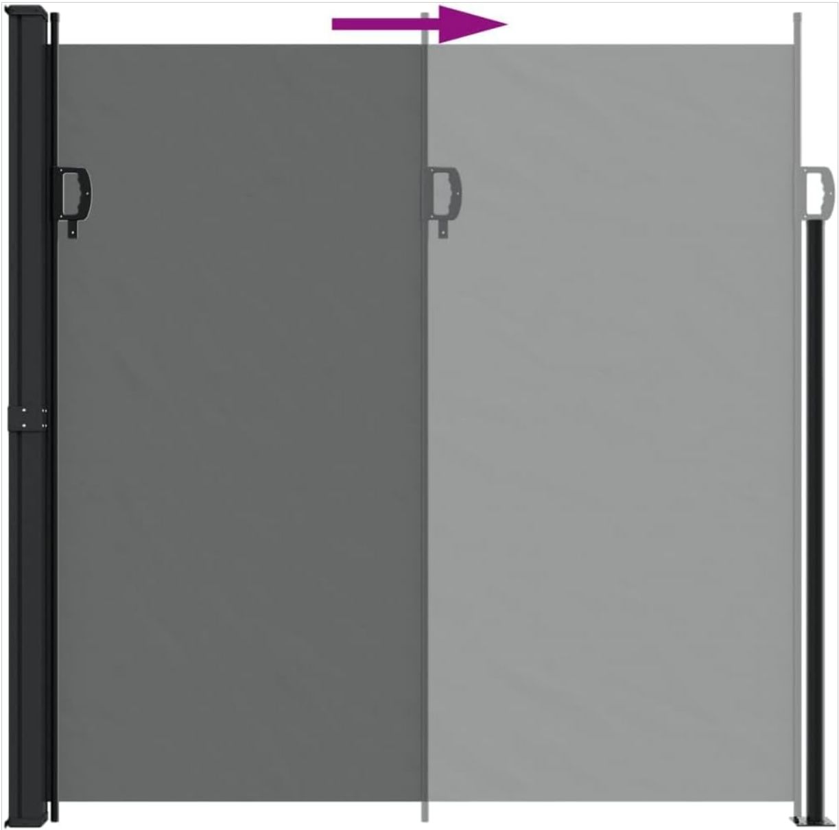
Image: A visual representation of the blind being extended from its housing, indicated by an arrow.