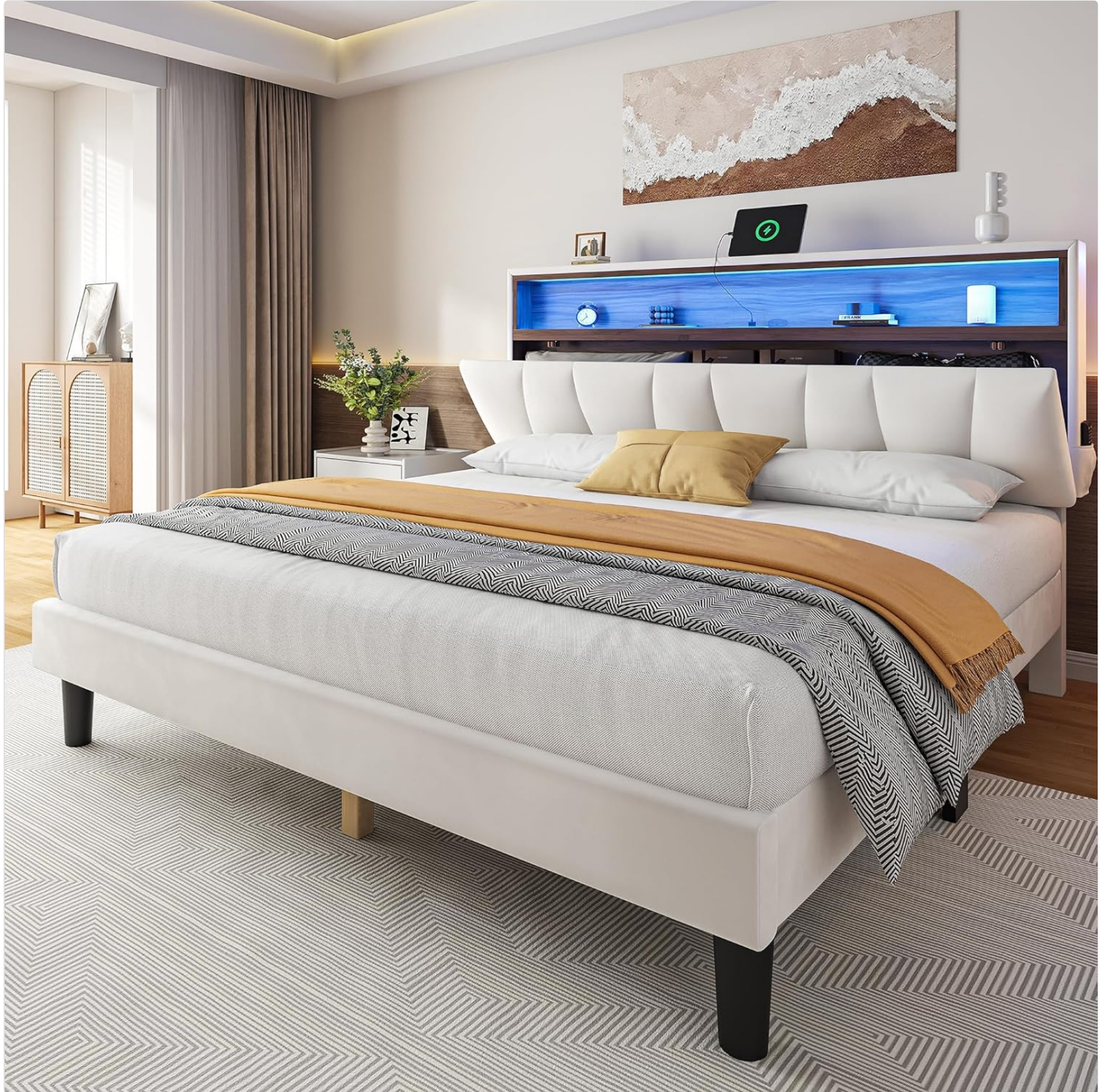
Image: Fully assembled YITAHOME Queen Size Bed Frame, showcasing the upholstered headboard with integrated LED lighting and storage.

Unpack the headboard and identify the integrated LED strip lights and charging station. Ensure all wiring is intact.