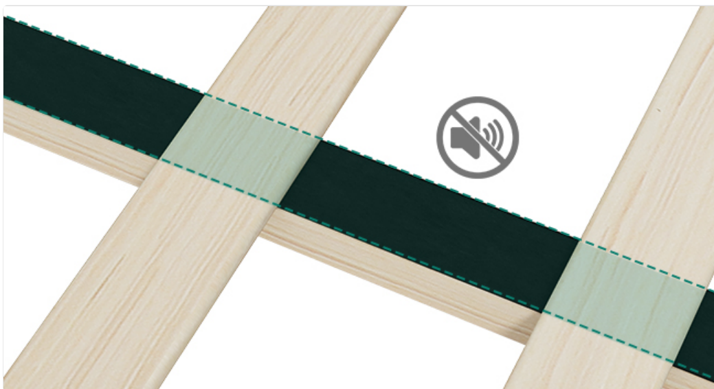
Image: Close-up view illustrating the noiseless design feature, where a fabric strip prevents direct wood-on-wood contact.