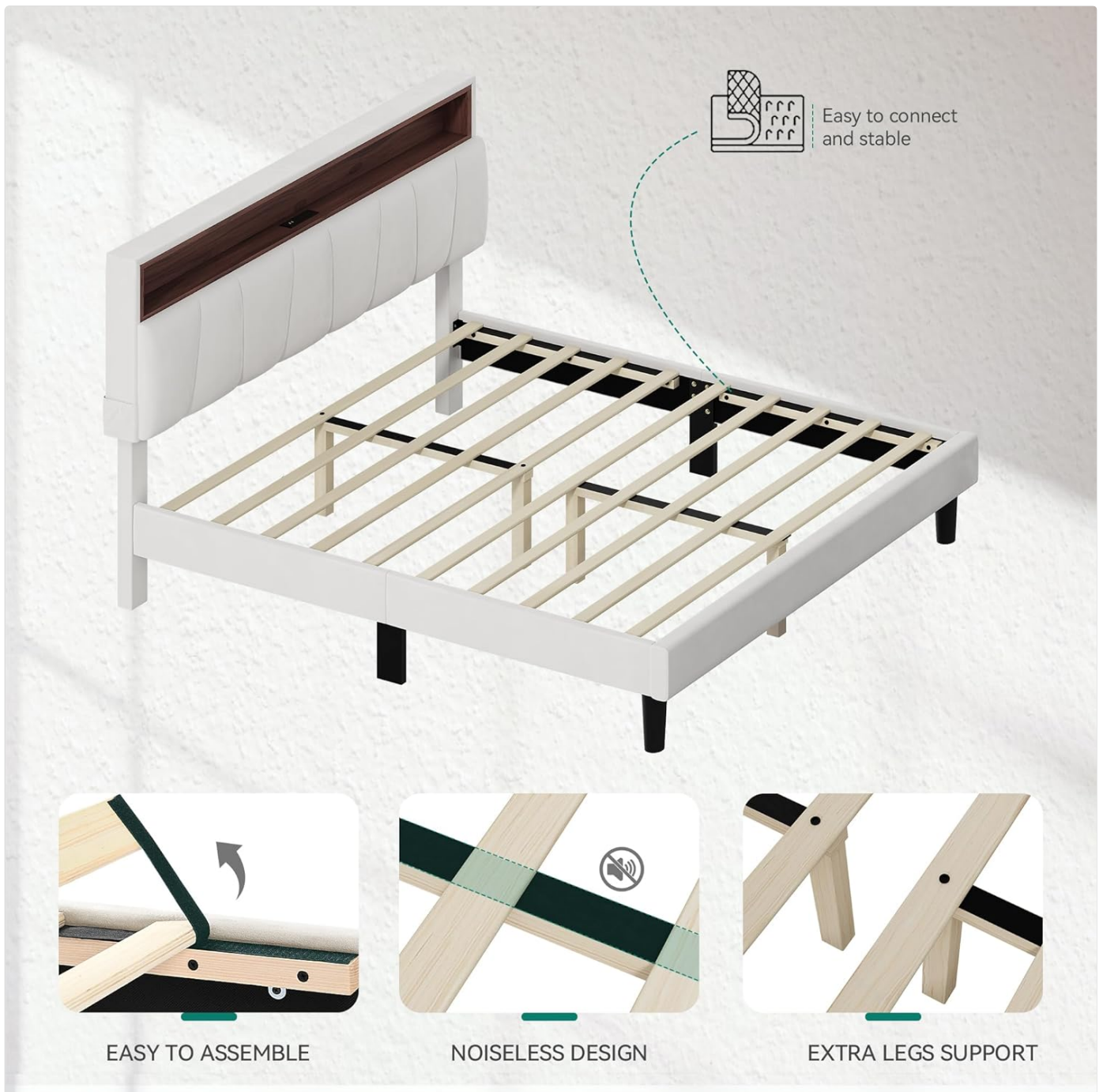
Image: Visual representation of the bed frame's internal structure, highlighting easy assembly, noiseless design with Velcro strips for slats, and additional central support legs.