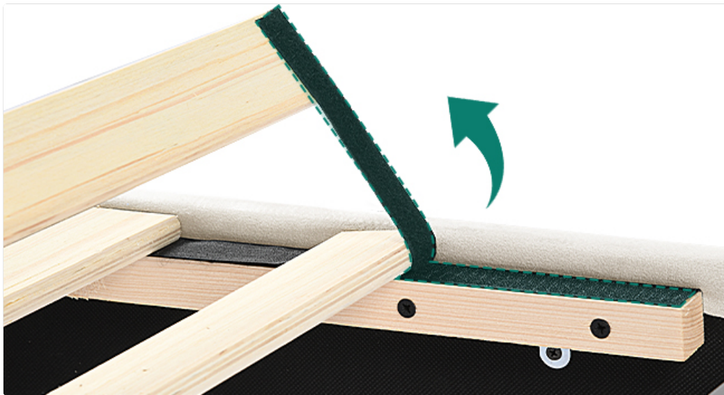
Image: Close-up view demonstrating the easy assembly of wood slats using Velcro fasteners.