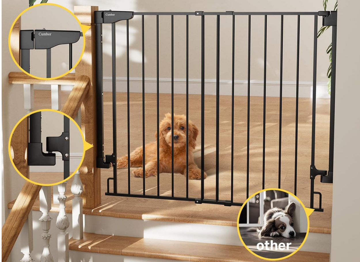
Image: Childproof and pet-proof design with a double-lock system and curved sides for ultimate safety.

Double lock design and curved sides prevent pets and toddlers from slipping through