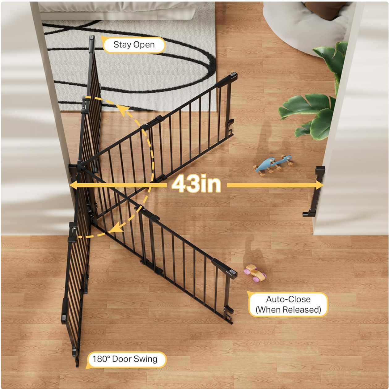
Image: The gate features a 180-degree door swing and a stay-open function when opened fully.