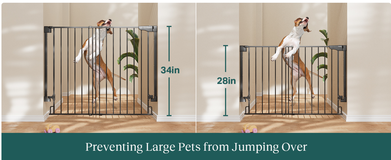
Image: The Cumbor no-bottom-bar gate easily adjusts from 29.2 to 43 inches to fit various spaces.

Image: Loosen screws and slide panels to adjust the gate's width to fit your opening.