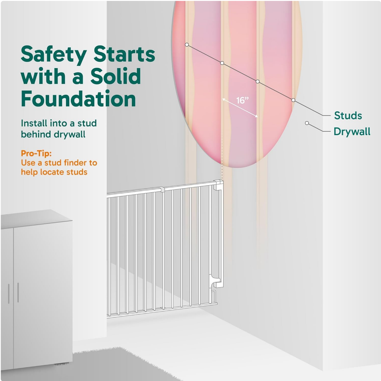
Image: Use a stud finder to locate studs for secure drywall installation.

Pro-Tip: Use a stud finder to help locate studs