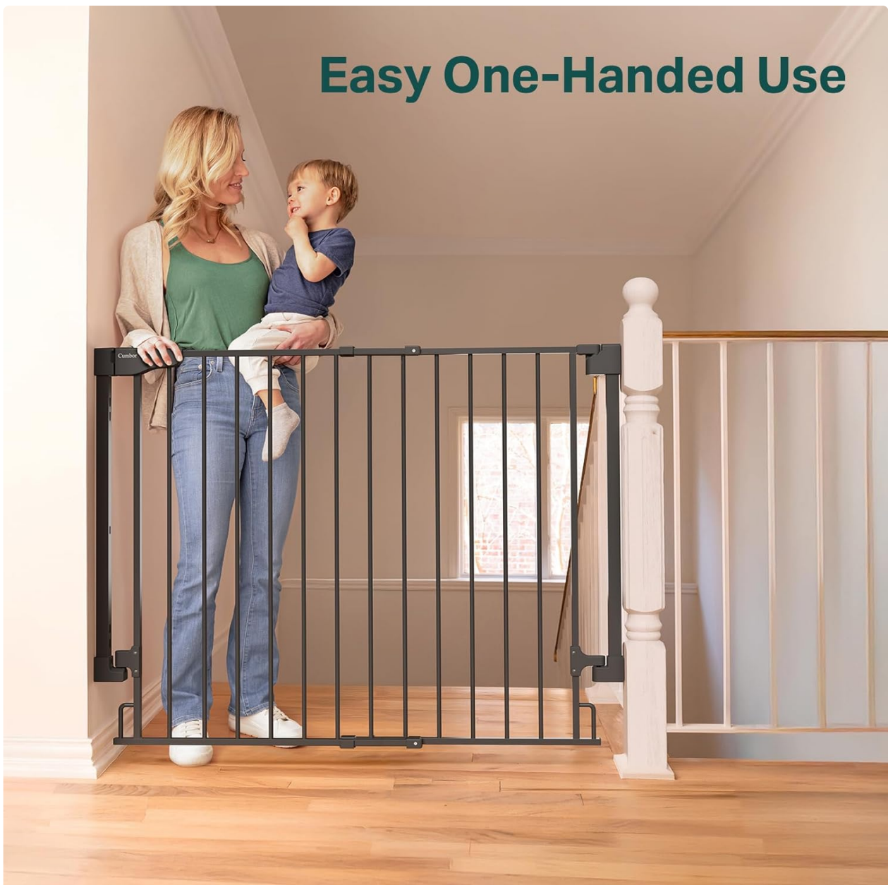
Image: The gate allows for easy one-handed operation, ideal for busy parents.