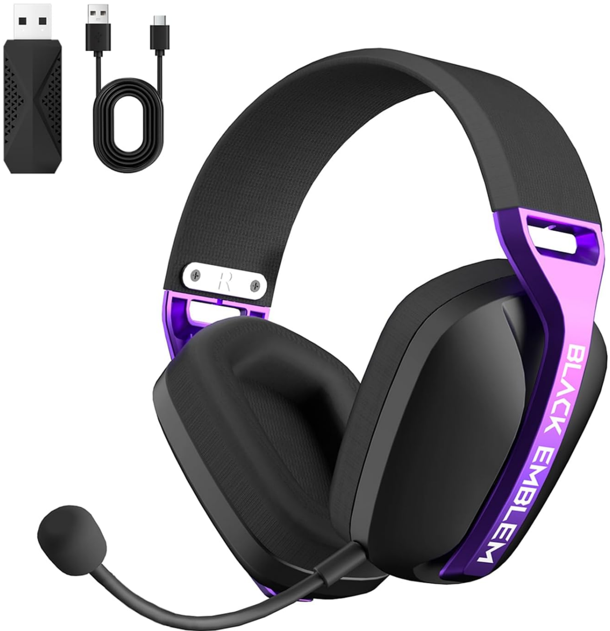
Image: The Black Emblem X1 Wireless Gaming Headset, showcasing its black and purple design, removable microphone, USB dongle, and USB-C charging cable.