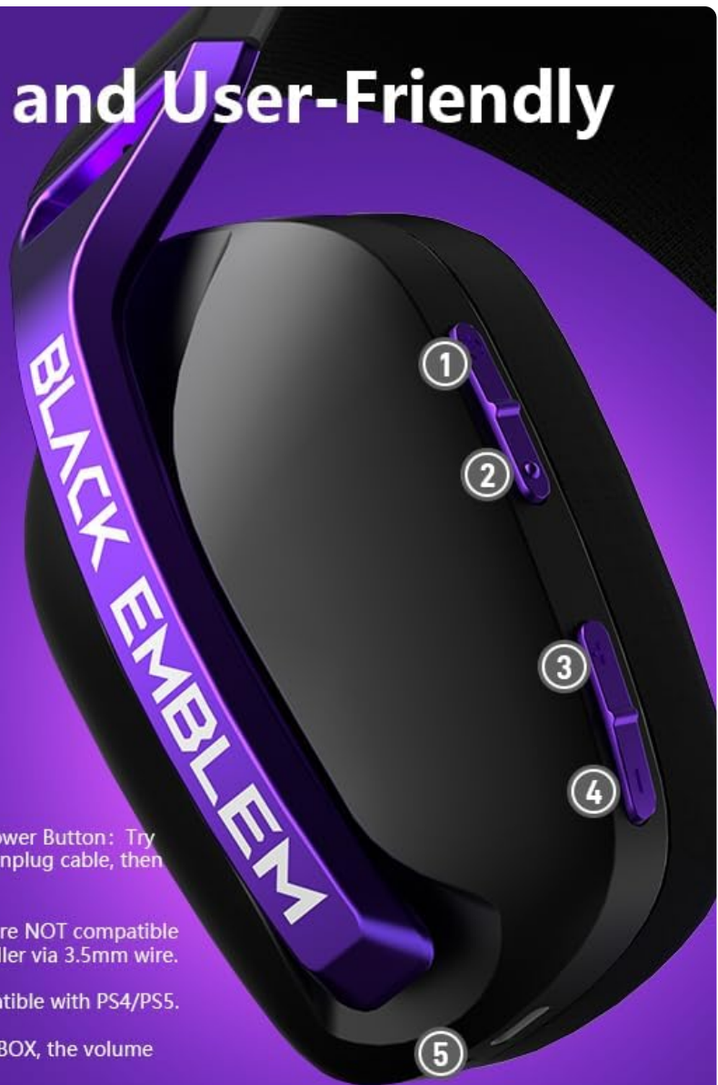
Image: The Black Emblem X1 headset highlighting its impressive 40-hour battery life, allowing for prolonged use on a single charge.

Note 4: When connected to PS4/PS5/XBOX, the volume buttons stop working.