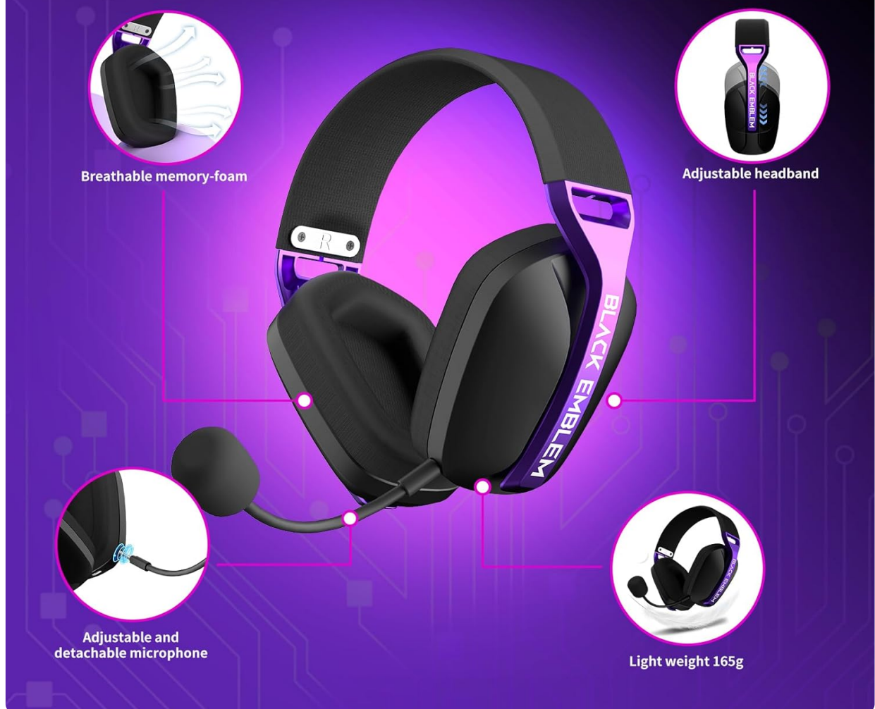
Image: A diagram highlighting the comfortable design elements of the headset, such as breathable memory-foam earcups, an adjustable headband, and an adjustable, detachable microphone.