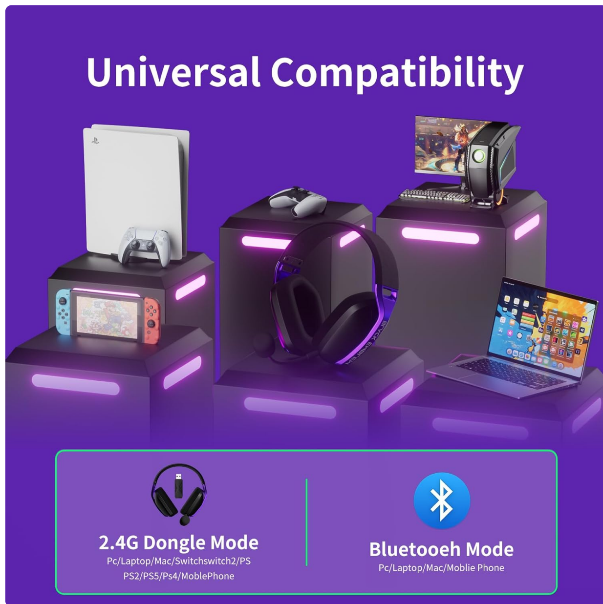
Image: Visual representation of the headset's universal compatibility across various platforms, including PCs, PlayStation consoles, Nintendo Switch, Mac, and mobile devices.

Video: Demonstrates how to connect the Black Emblem X1 headset to a PlayStation console using the 2.4GHz USB dongle.