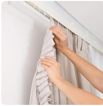
Image: Hands attaching a curtain to the runners on the smart curtain track.