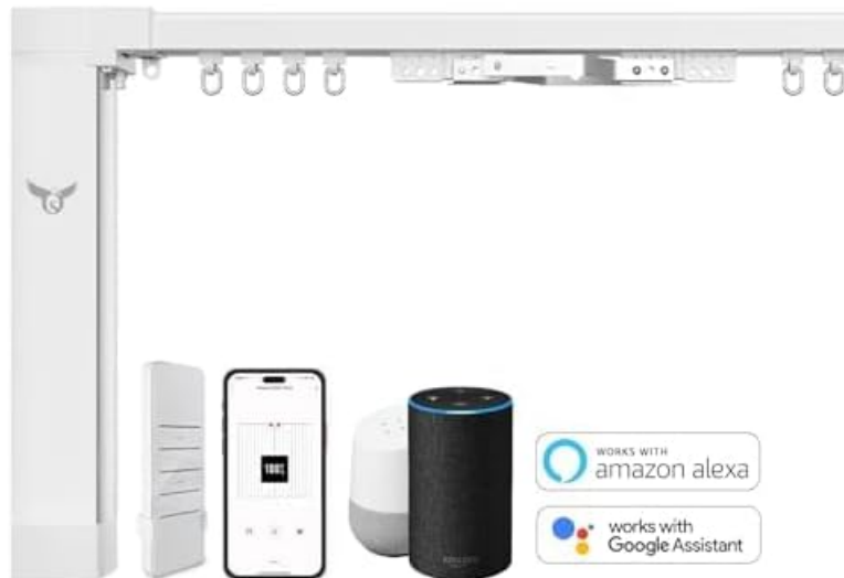
Image: Overview of the Osprey Smart Curtain Track system, including the track, motor, remote, and compatible smart speakers.