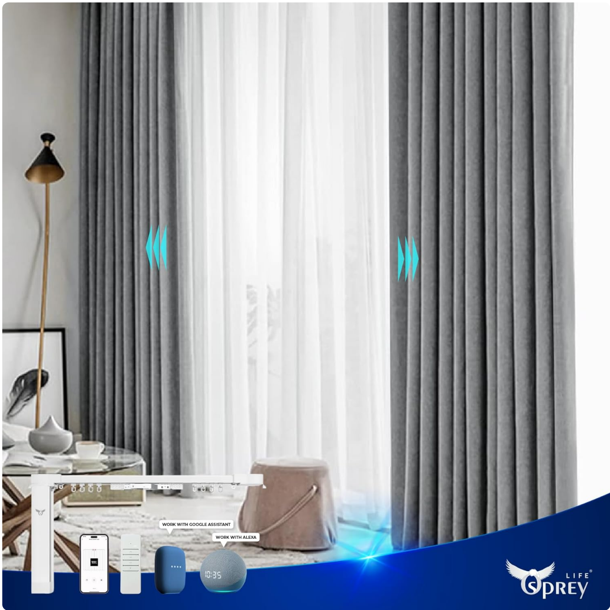
Image: Curtains in a living room being controlled by smart home voice assistants like Alexa and Google Assistant.