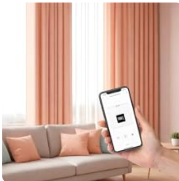
Image: A hand holding a smartphone showing the Osprey Smart Home App, used for controlling the curtain track.

Download the Osprey Smart Home App from your device's app store. Follow the in-app instructions to pair your curtain track. The app allows for precise control, scheduling, and customization.