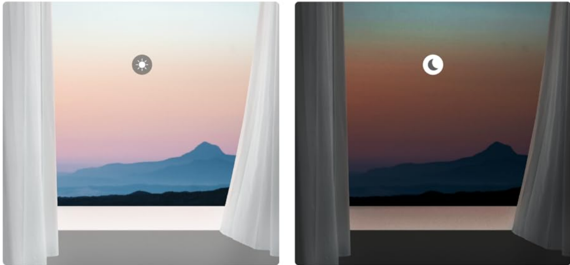
Image: Visual representation of curtains opening for daytime and closing for nighttime, demonstrating the scheduling function.