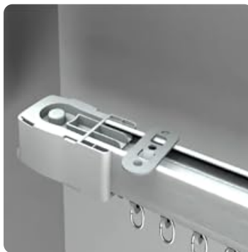
Image: Detailed view of the mounting bracket and track connection point.

Image: Close-up view of installing the mounting bracket onto the curtain track.