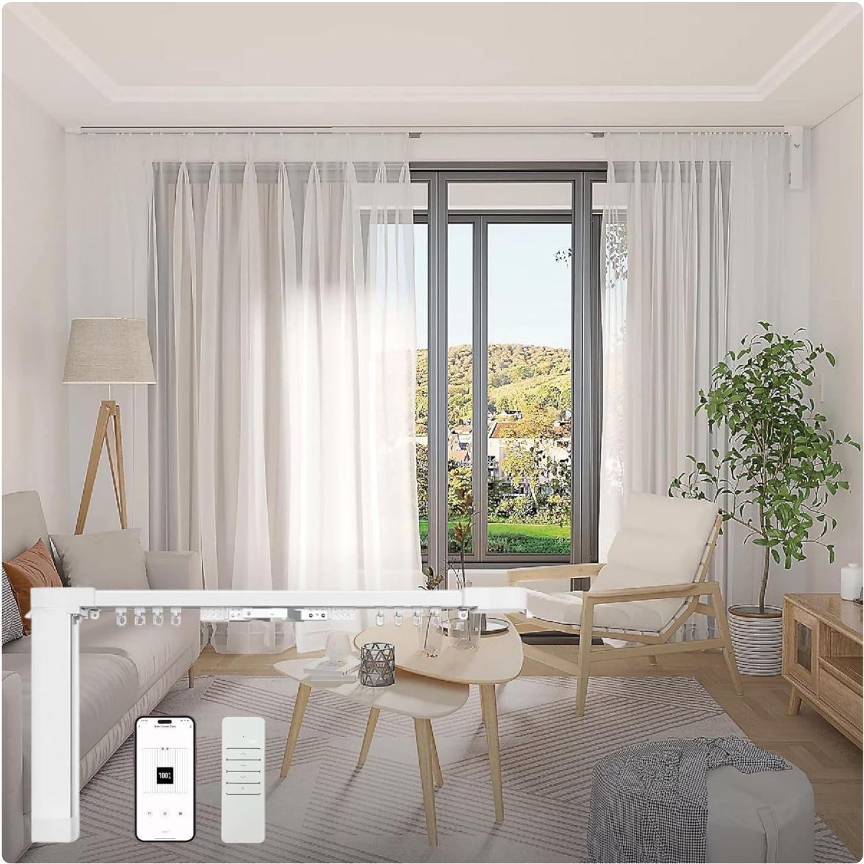
Image: Osprey Smart Curtain Track installed in a living room, showing remote and app control options.