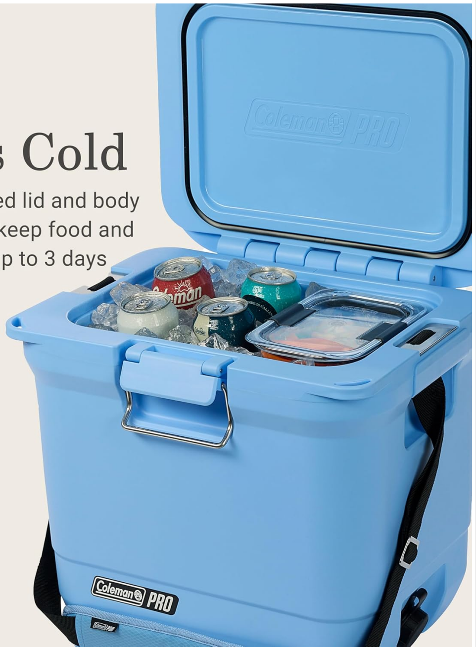
Image: The cooler's interior, demonstrating its capacity for beverages and ice, designed for extended cold retention.