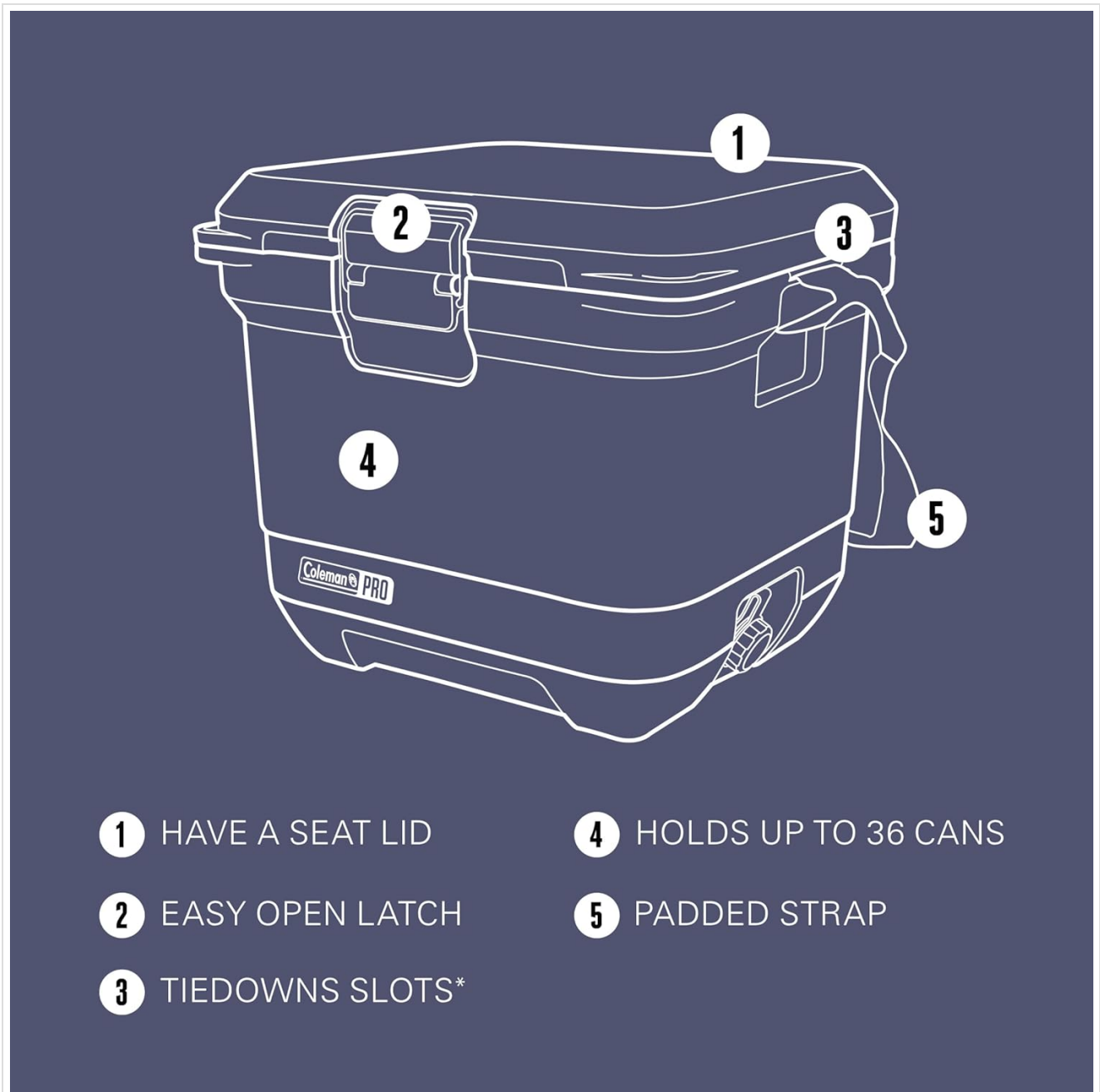
Image: A diagram highlighting the main functional components of the Coleman Pro Hard Cooler.