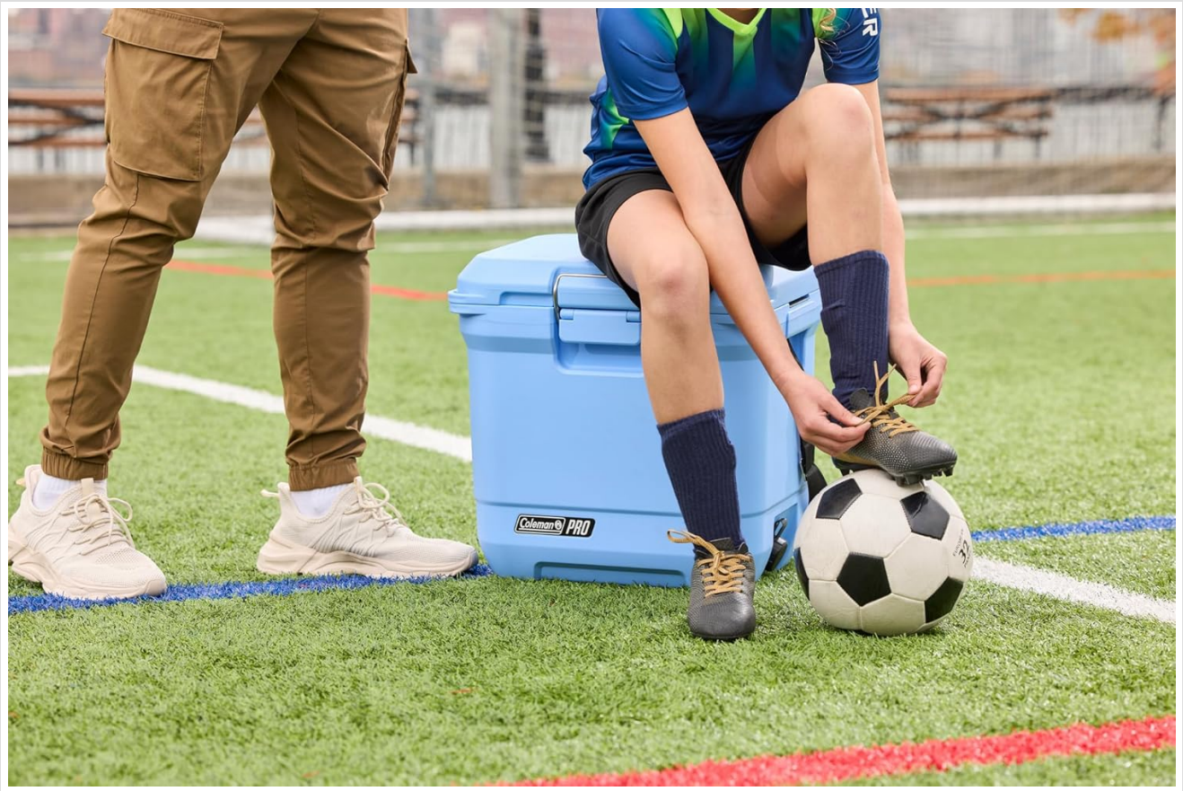
Image: The cooler's lid supporting an individual, highlighting its dual function as a sturdy seat.