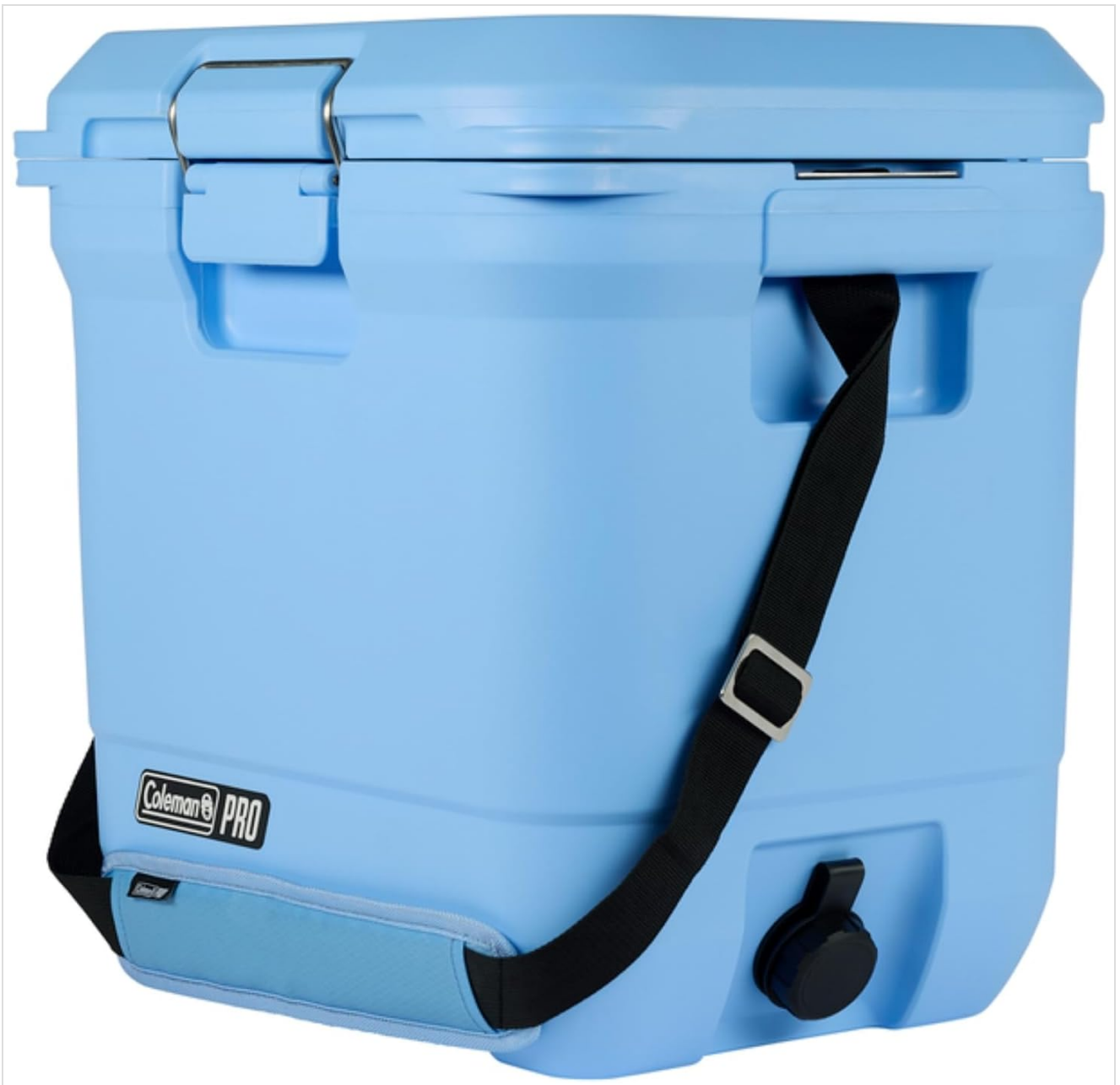
Image: The Coleman Pro 25-Quart Hard Cooler, showcasing its robust design and integrated shoulder strap for portability.