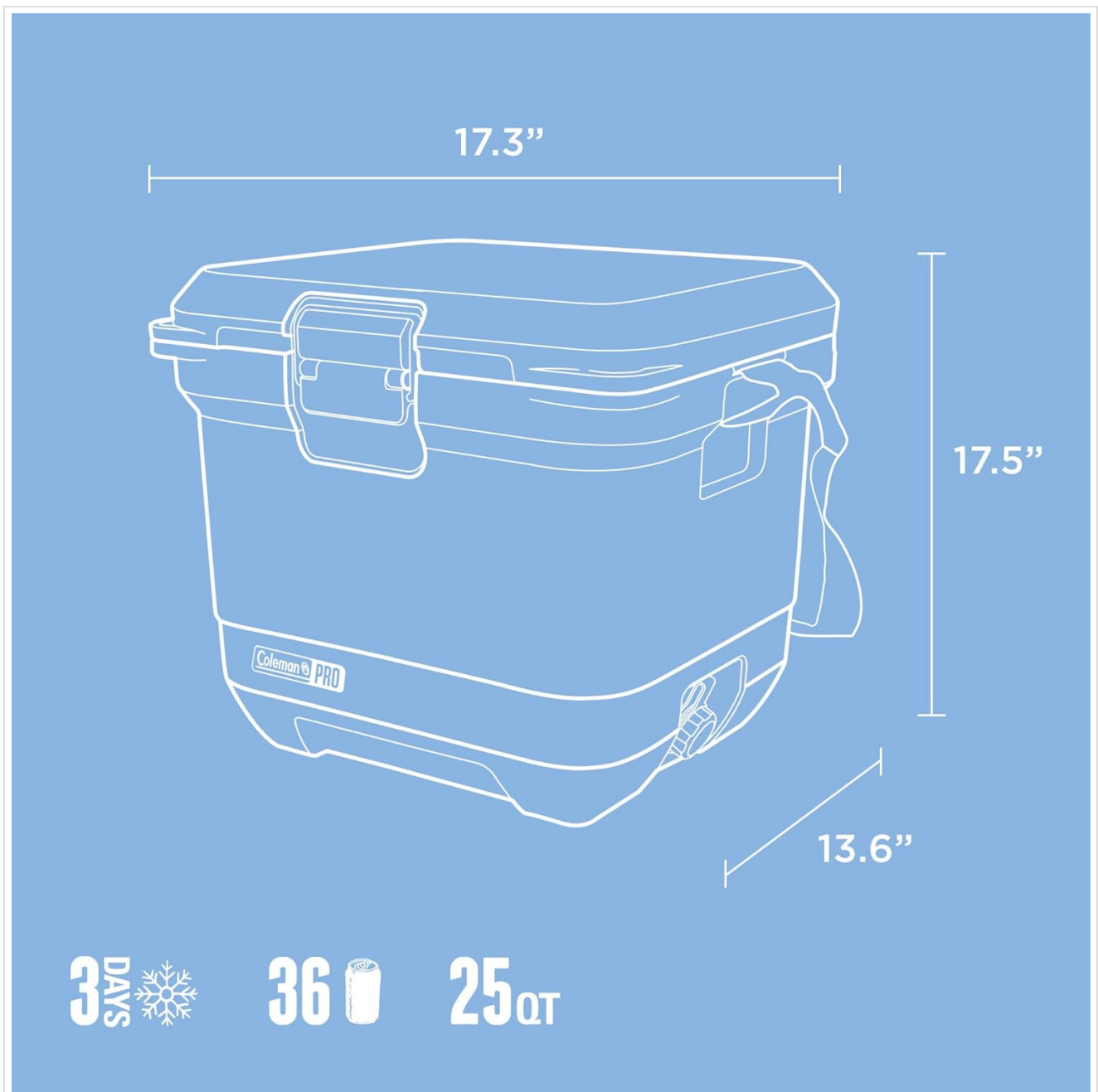
Image: Dimensional overview of the Coleman Pro 25-Quart Hard Cooler.