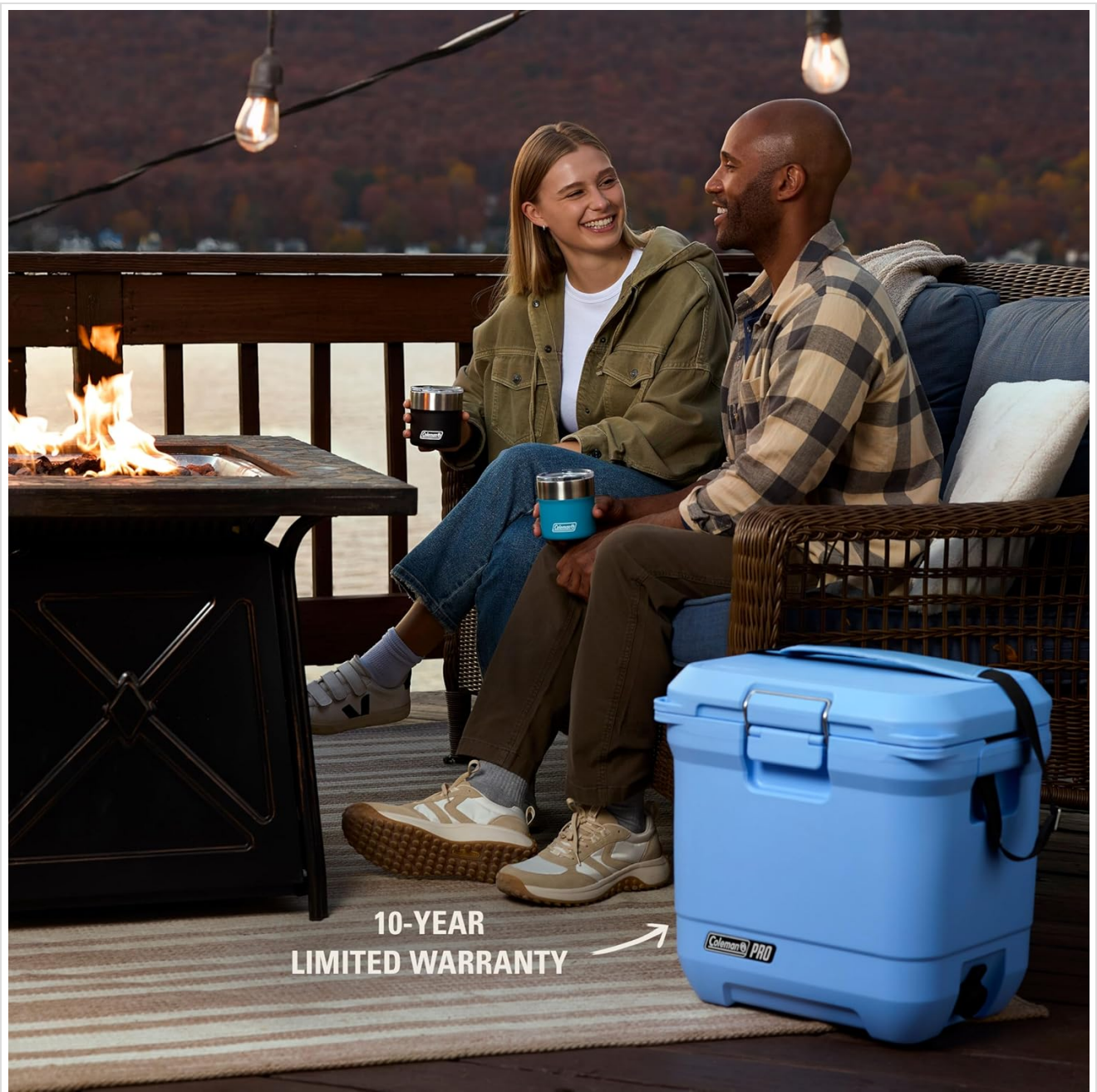
Image: The cooler in a lifestyle setting, emphasizing its long-term reliability backed by a 10-year limited warranty.