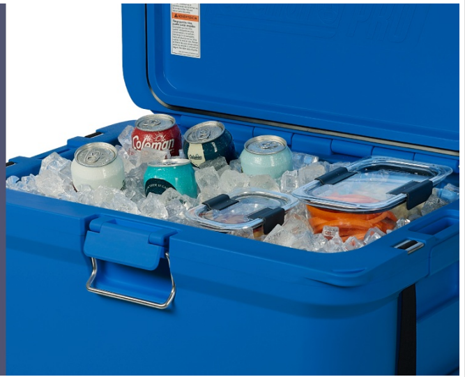
Image: The cooler's interior, featuring the antimicrobial liner designed to inhibit the growth of odor-causing bacteria.

Fully insulated lid and body designed to keep food and drinks cold up to 5 days.