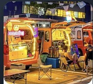
Night Market Stalls