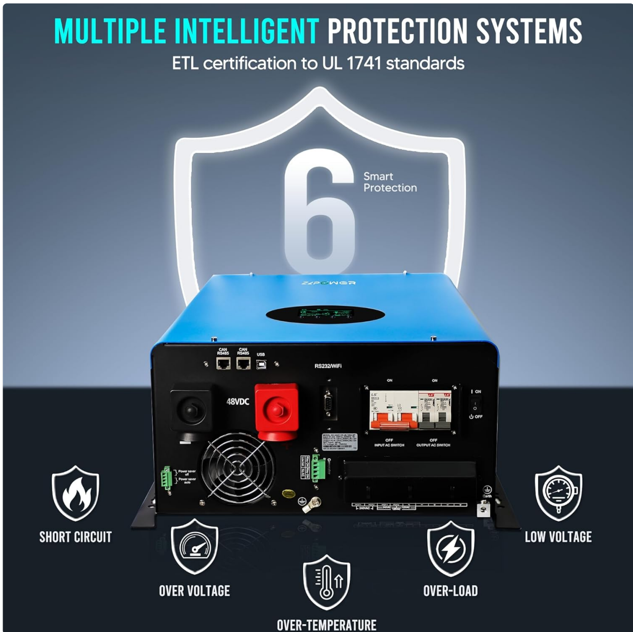
Image 3.2: An illustration highlighting the six smart protection features integrated into the inverter, ensuring system safety and longevity.