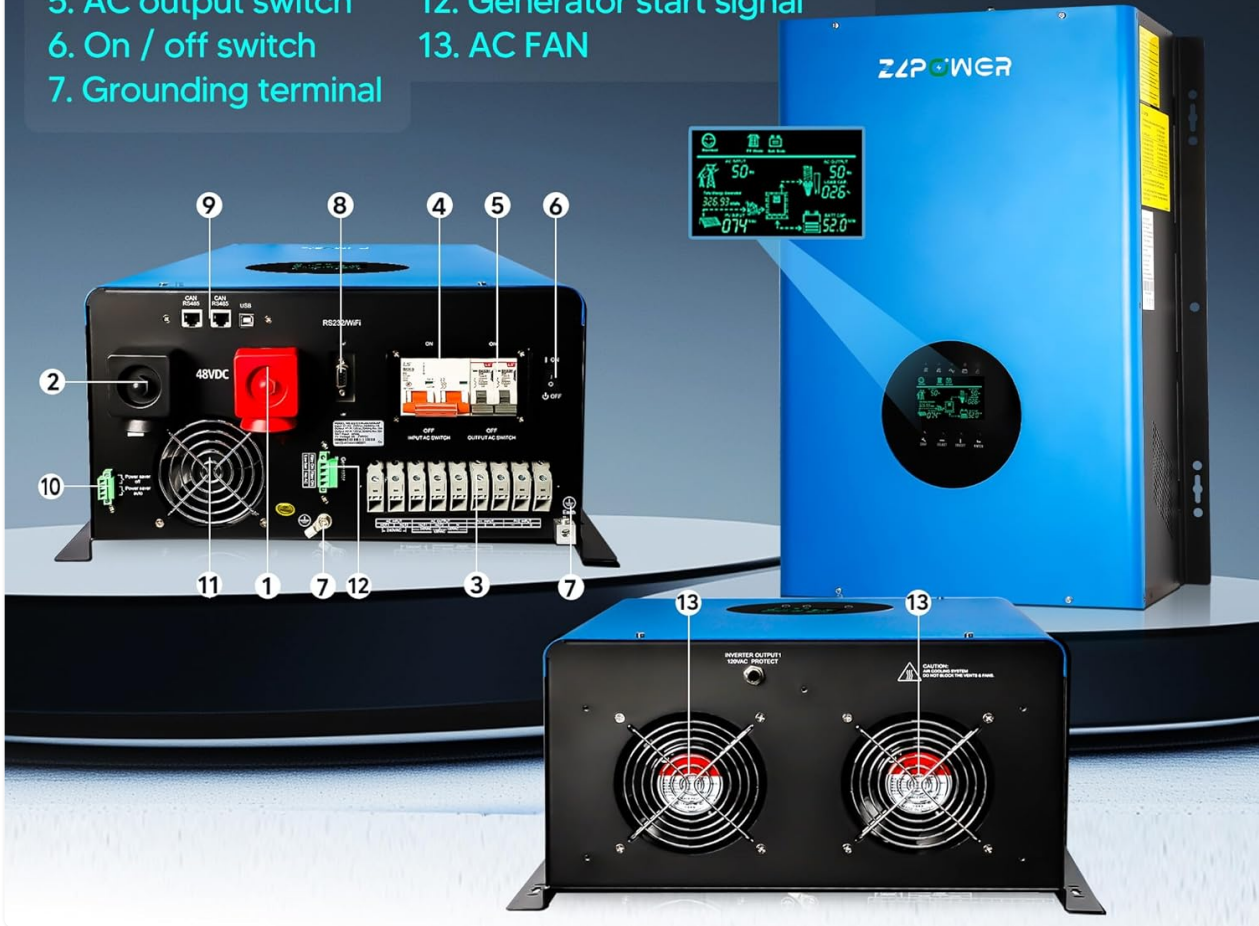
Image 4.2: A detailed diagram labeling all wiring terminals and ports on the inverter, including battery connections, AC input/output, communication ports, and fan locations.