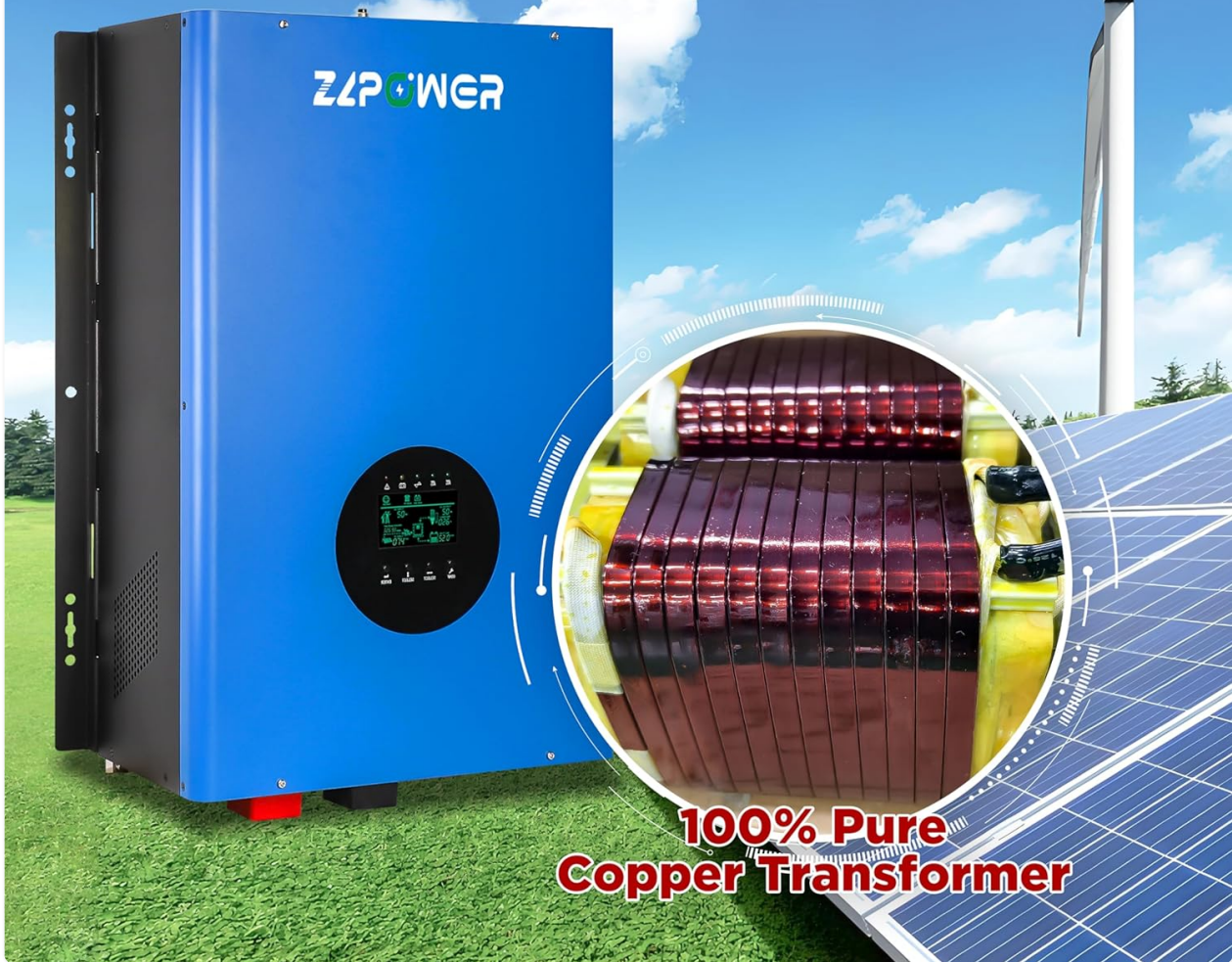
Image 1.1: The ZLPOWER 10000W Solar Hybrid Inverter, showcasing its application in a renewable energy system with solar panels and a wind turbine.