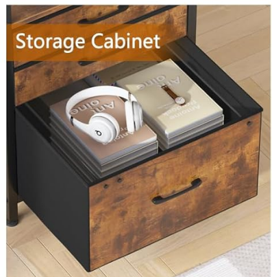
Figure 6: The multifunctional file drawer system, illustrating its capacity for letter-sized files, A4 documents, and general storage.