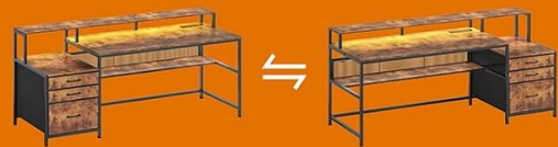
Figure 3: Illustration of the desk's reversible design, allowing the drawer unit to be configured on either the left or right side.