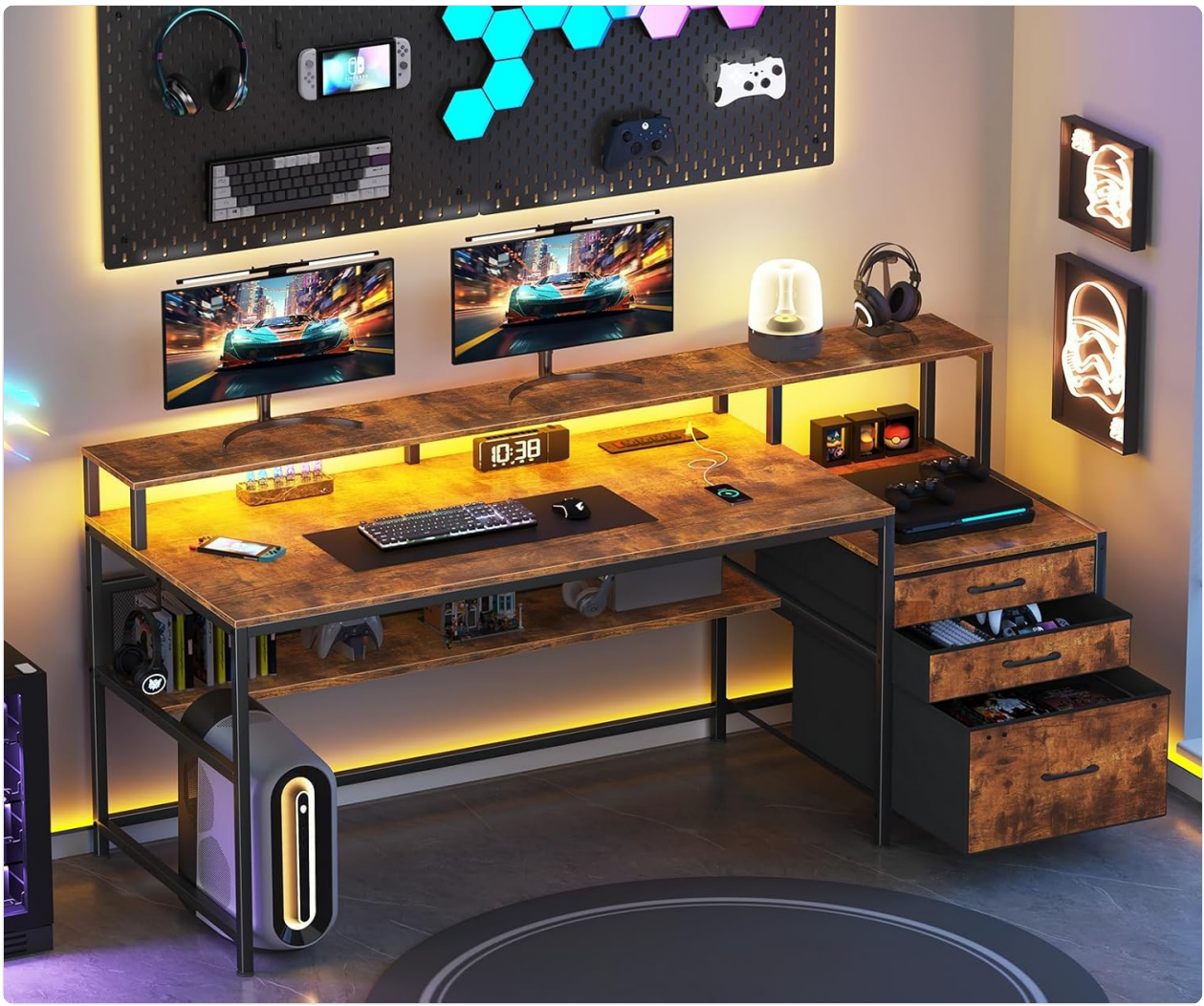
Figure 1: Overall view of the YOMILUVE 66" Computer Desk, showcasing its spacious design, monitor stand, and integrated features.