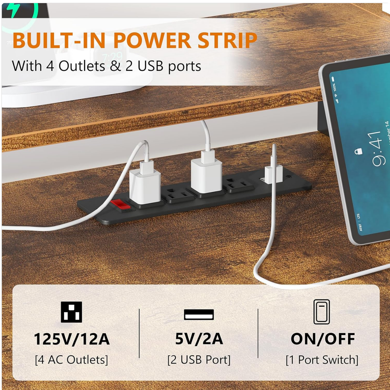
Figure 5: A detailed view of the integrated charging station, highlighting the AC outlets and USB ports for device connectivity.