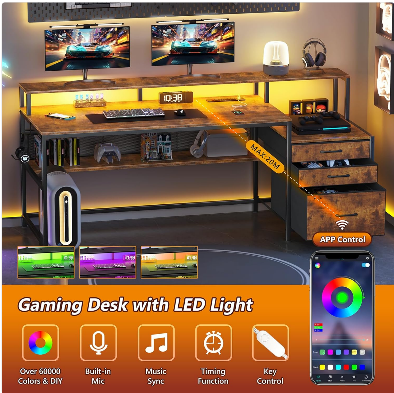
Figure 4: The LED light strip in operation, demonstrating various color options and the mobile application interface for control.