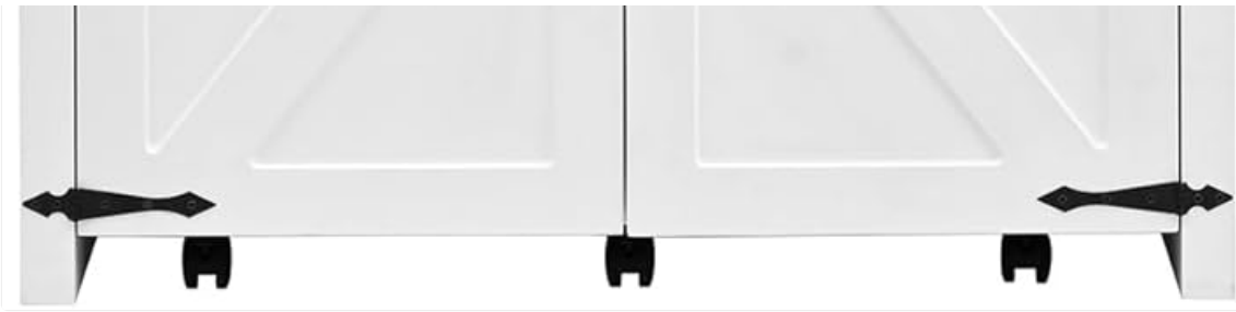
Figure 2.1: Anti-Tipping Device and Safety Warning. Always install the anti-tipping device for enhanced safety and stability.