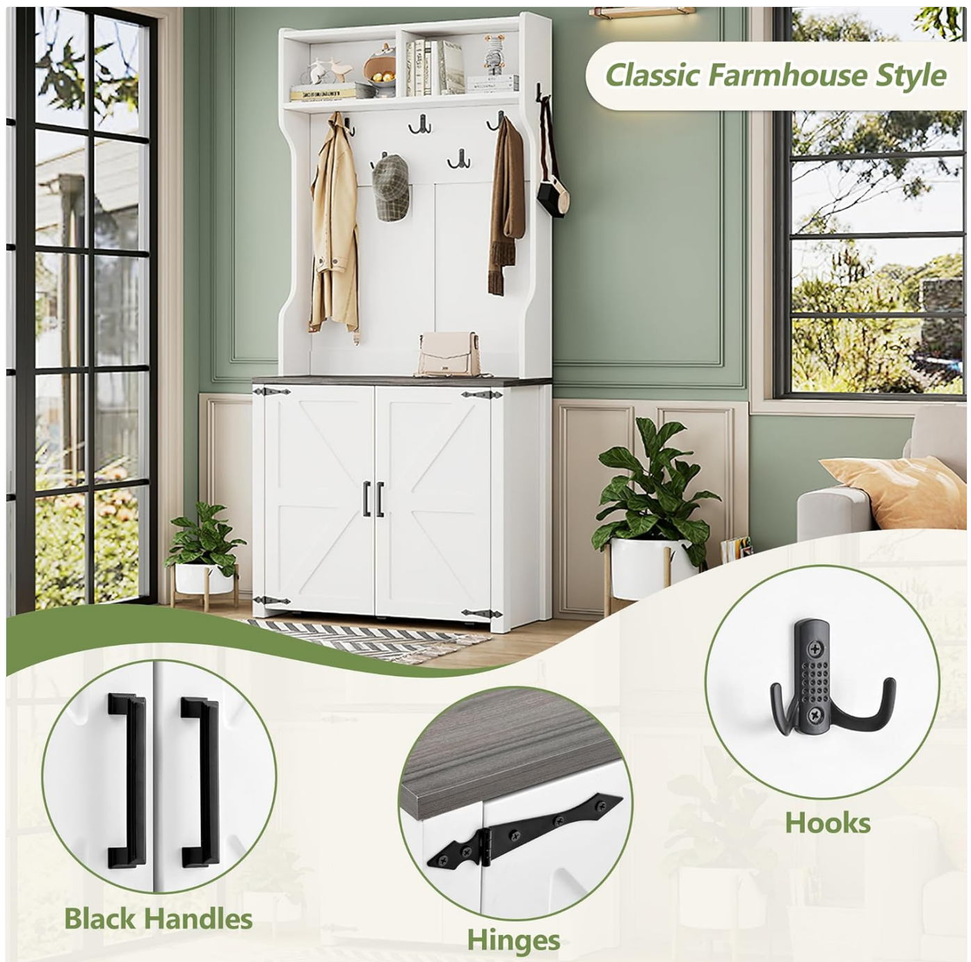
Figure 3.4: Farmhouse Style Accents. This image details the black handles, hinges, and hooks that contribute to the rustic aesthetic.