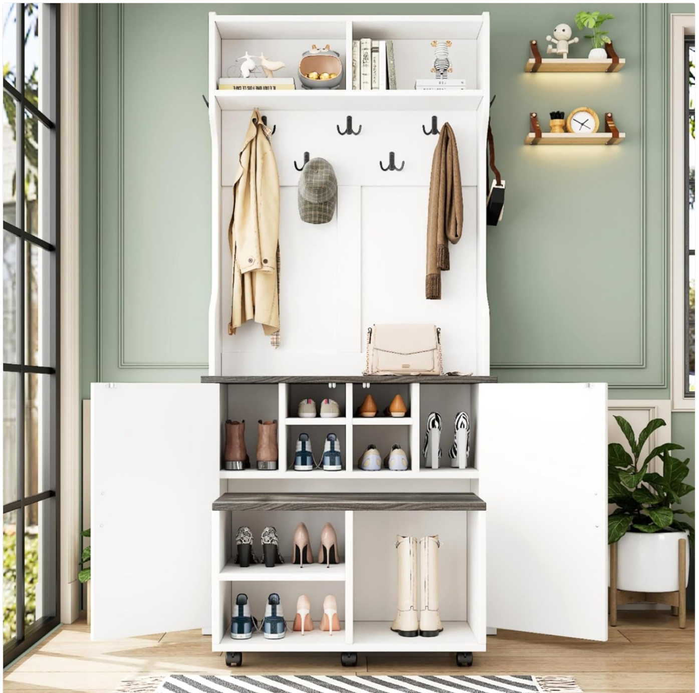
Figure 3.1: Polibi 4-in-1 Hall Tree in White. This image displays the overall appearance of the hall tree with its barn doors, open shelving,