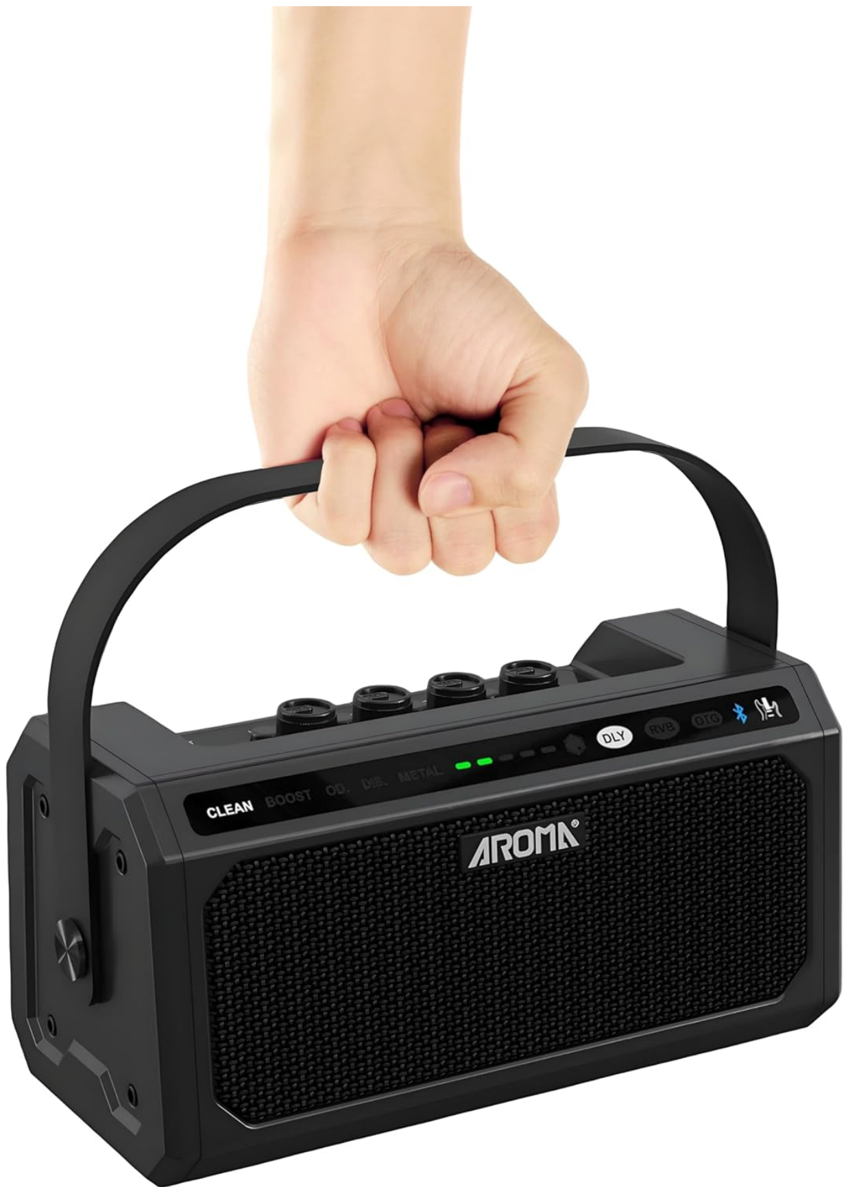
Figure 1: Ulumac Aroma Portable 10W Mono Electric Guitar Practice Amp with carry handle.