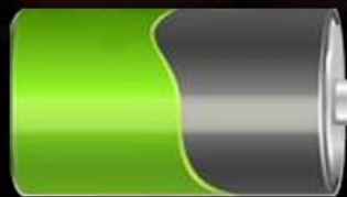
Figure 3: The amplifier features a 2200mAh Li-ion rechargeable battery, providing up to 5.5 hours of continuous use.