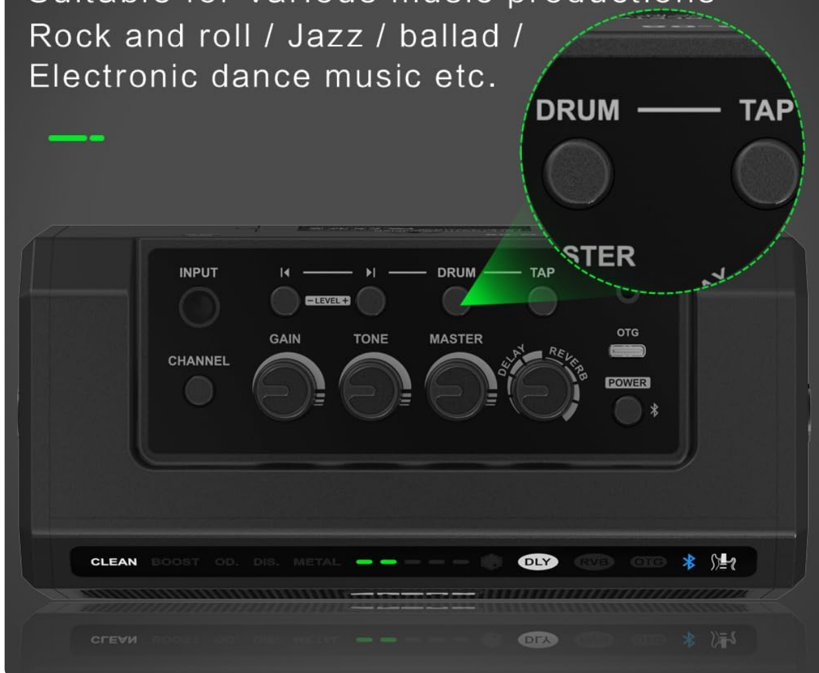
Figure 4: The control panel highlights the drum machine and tap tempo buttons, offering 20 rhythm patterns.

Suitable for various music productions Rock and roll / Jazz / ballad / Electronic dance music etc.