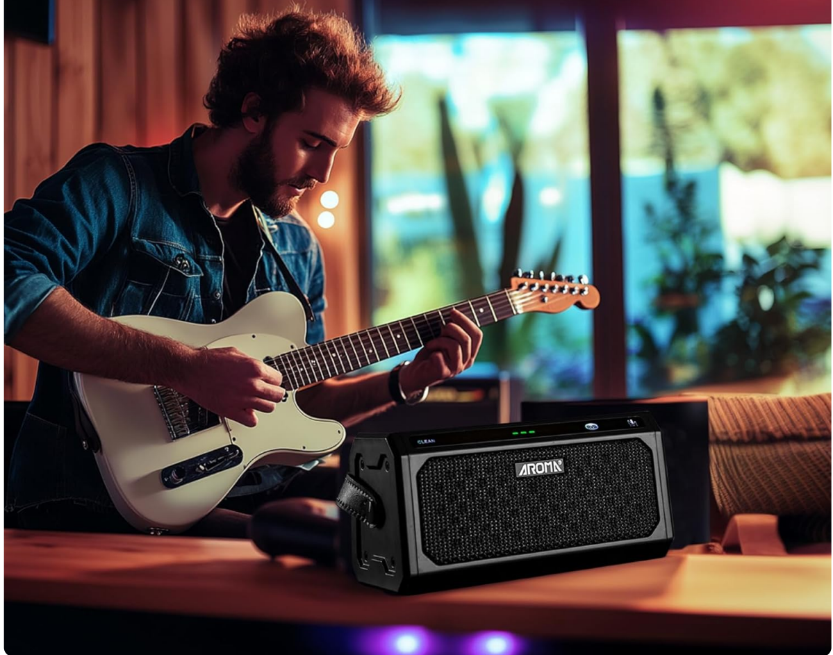
Figure 5: The amplifier supports Bluetooth 5.3 for seamless wireless connection, ideal for playing along with backing tracks.