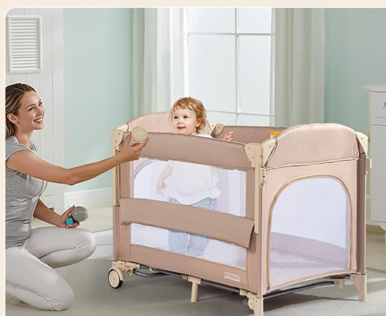
Baby Activity Center