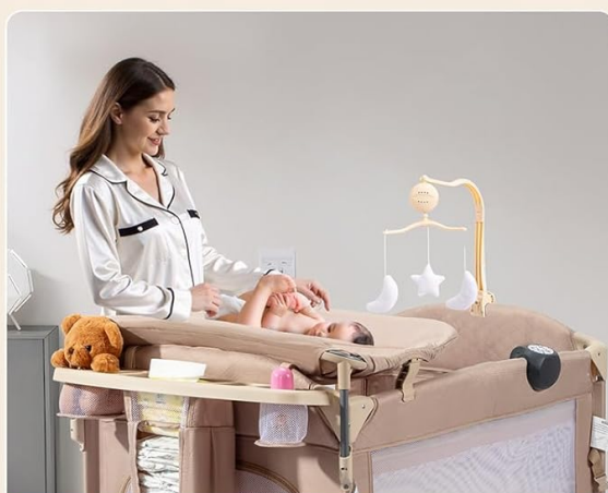
Changing Table Mode