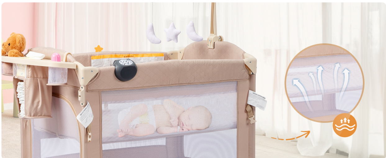
Image: Overview of the JOYMOR 9-in-1 Bedside Bassinet in its bedside co-sleeper configuration.

The JOYMOR 9-in-1 Bedside Bassinet is designed to provide a versatile and comfortable environment for your baby. This multifunctional unit can be configured as a baby bassinet, a bedside co-sleeper, a gentle rocking cradle, and a playard. It also includes practical accessories such as a changing station, storage shelf, electric music center, and mosquito net, adapting to your baby's needs from infancy through toddlerhood.