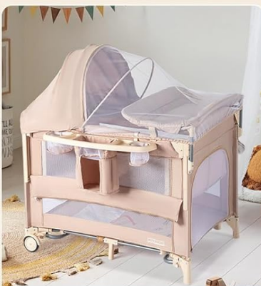
Baby Bed with Canopy