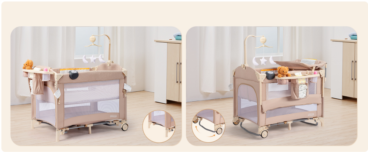
Image: Visual representation of the four primary modes: bedside bassinet, standalone baby bed, playard, and rocking bassinet.