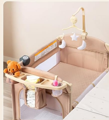
Bedside Co-Sleeping Bassinet

Image: The bassinet configured in different modes, including changing table, activity center, and rocking bassinet, illustrating its versatility.