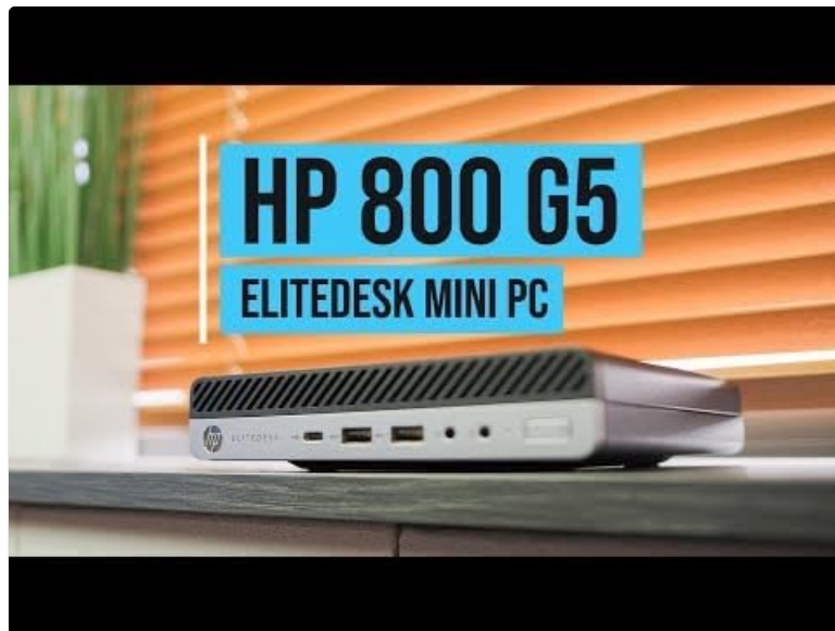
Figure 3.1: The compact HP EliteDesk 800 G5 Mini PC can be discreetly mounted behind a monitor for a clean workspace.

Video 3.1: An overview of the HP 800 G5 EliteDesk Mini PC, showcasing its compact design and features.