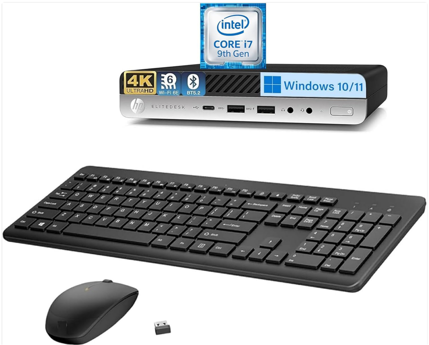
Figure 1.1: HP EliteDesk 800 G5 Mini PC with included wireless keyboard and mouse.