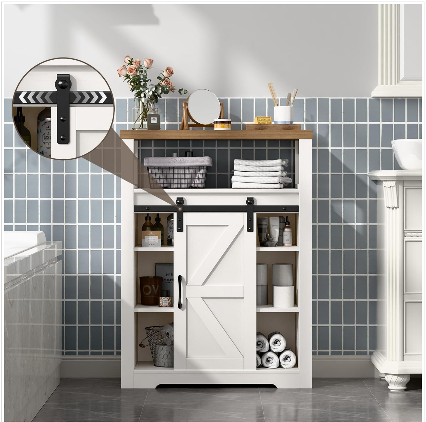
Figure 2.1: The Halitaa Farmhouse Cabinet positioned in a bathroom, demonstrating its functional and aesthetic integration.

This cabinet is suitable for use in bathrooms, kitchens, living rooms, or hallways, providing both open and concealed storage options.