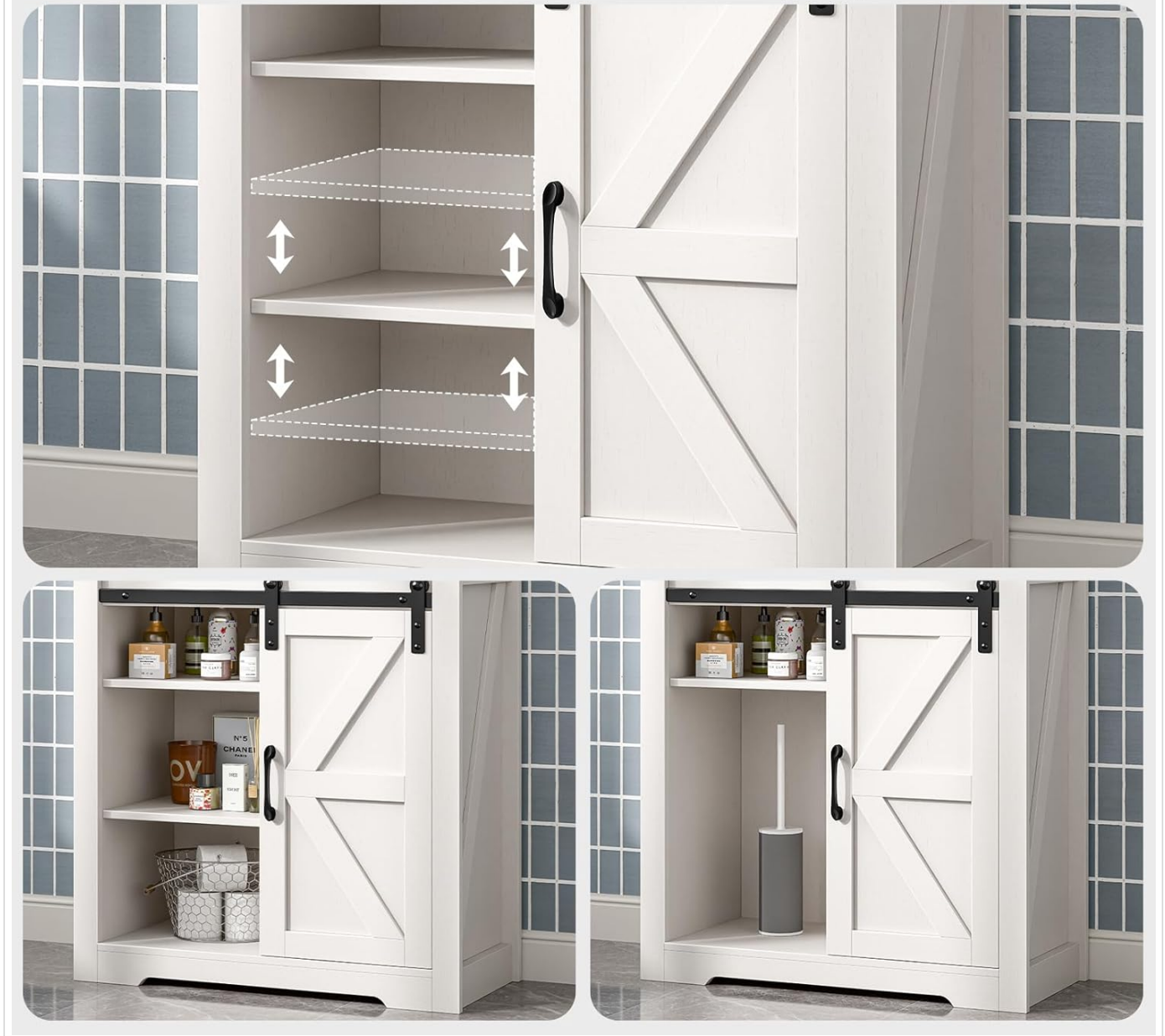
Figure 5.2: Illustration of adjustable shelf positions.

Meet the size of different storage space