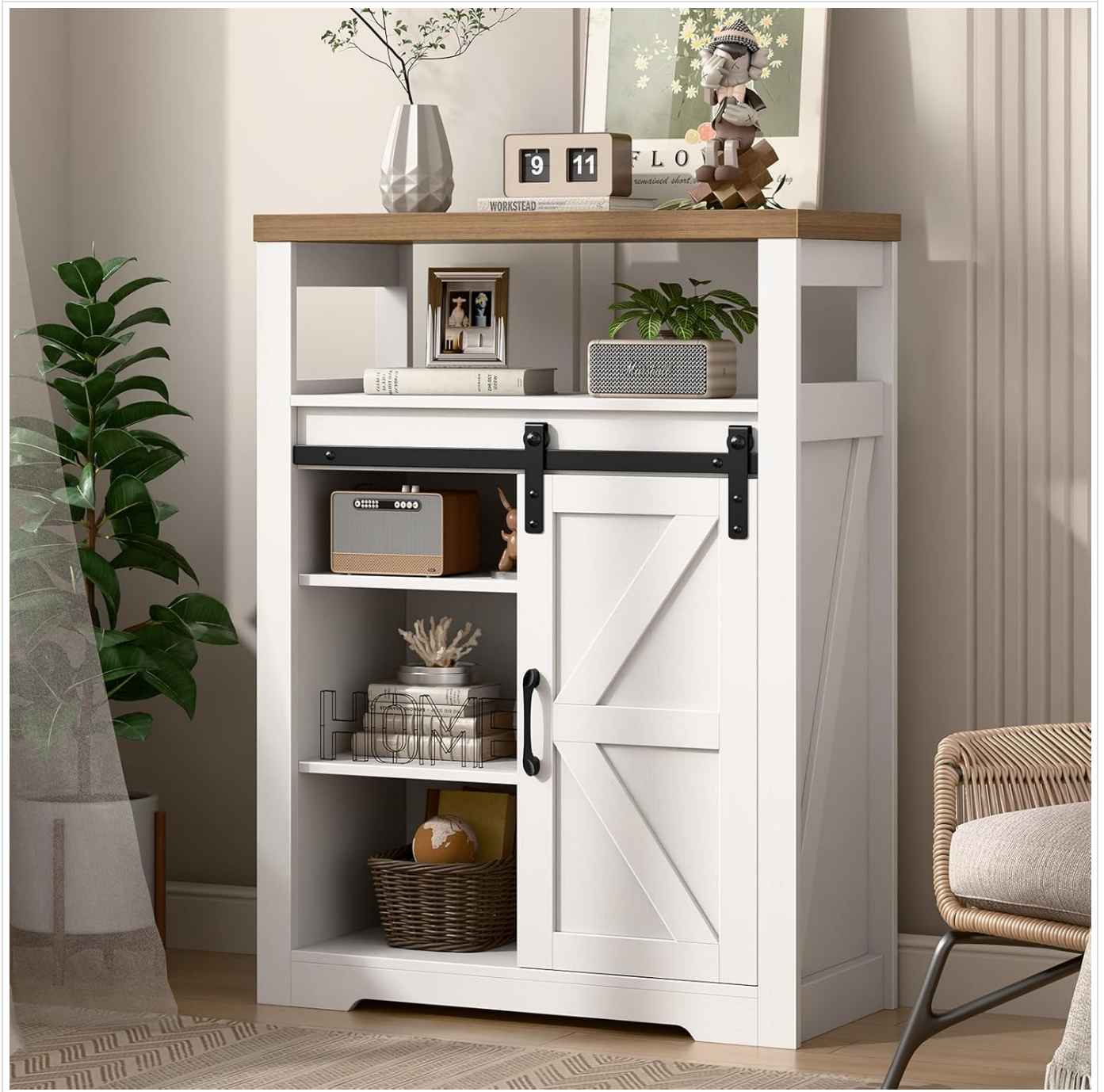
Figure 5.1: Close-up of the sliding door track and hardware.

The cabinet features a smooth-gliding barn door style. To open or close, gently slide the door along its top track using the handle. Ensure the track is free from obstructions for optimal movement.