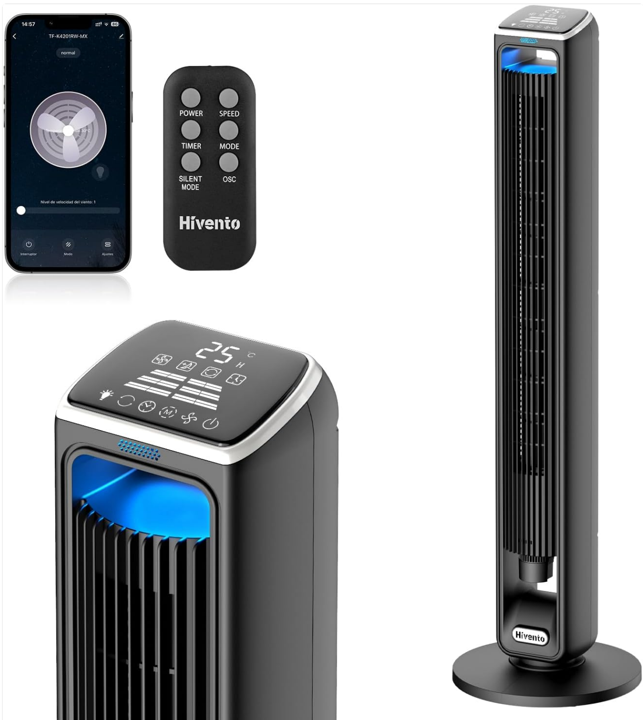
Image: The Hivento Smart Tower Fan, its remote control, and a smartphone displaying the control app.