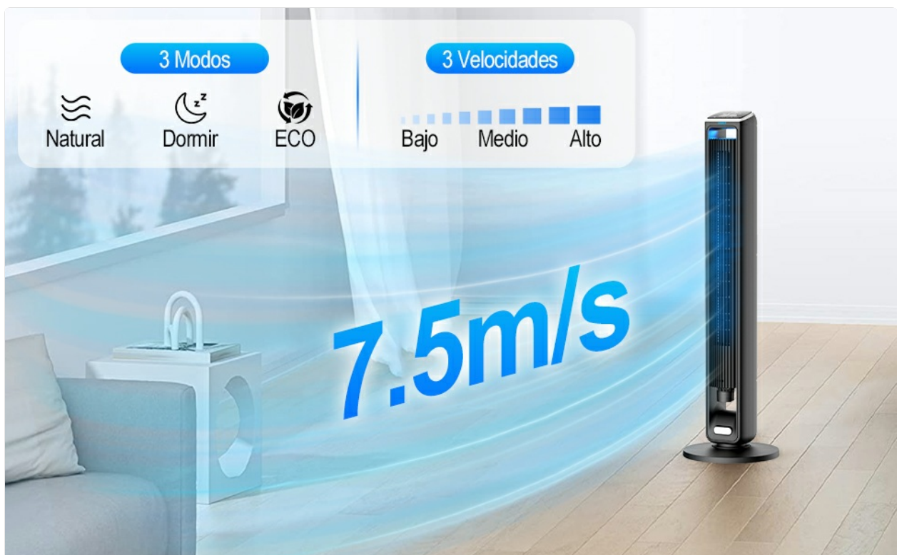
Image: Illustration of the fan's three modes and three speed settings, demonstrating customizable airflow.