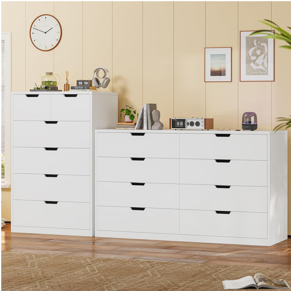
Image: A white 8-drawer dresser positioned in a bedroom, showcasing its modern design and ample top surface.