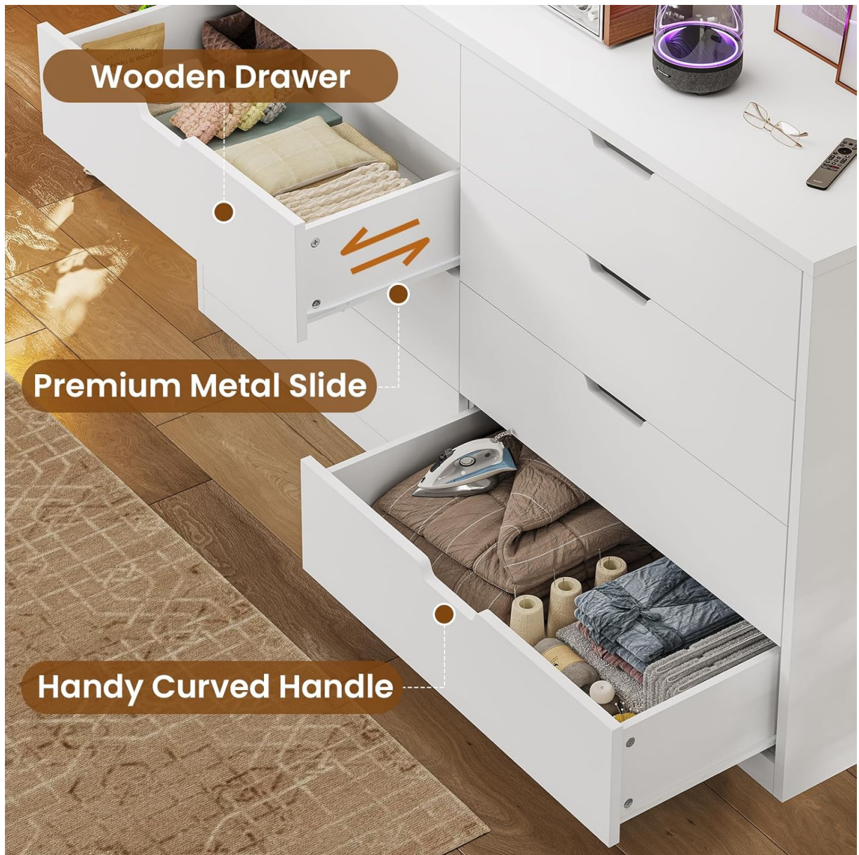
Image: Several drawers of the dresser are open, revealing various neatly organized items such as folded clothes, books, and small boxes, highlighting the ample storage space.