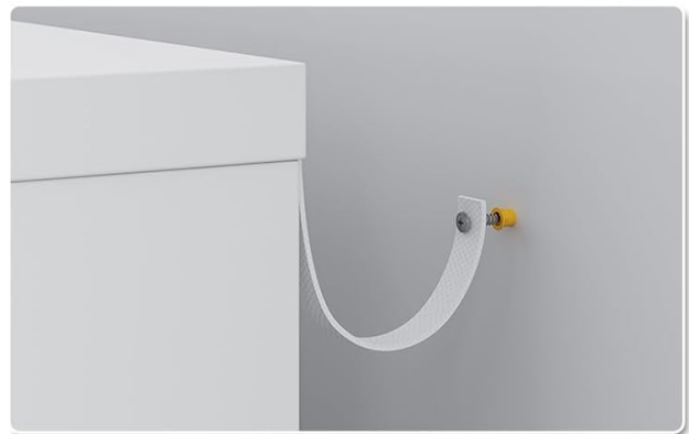
Image: Detailed views illustrating the grooved design of the drawer fronts, the smooth operation of the premium metal slides, and the installation of the anti-tipping device for safety.

Your browser does not support the video tag.