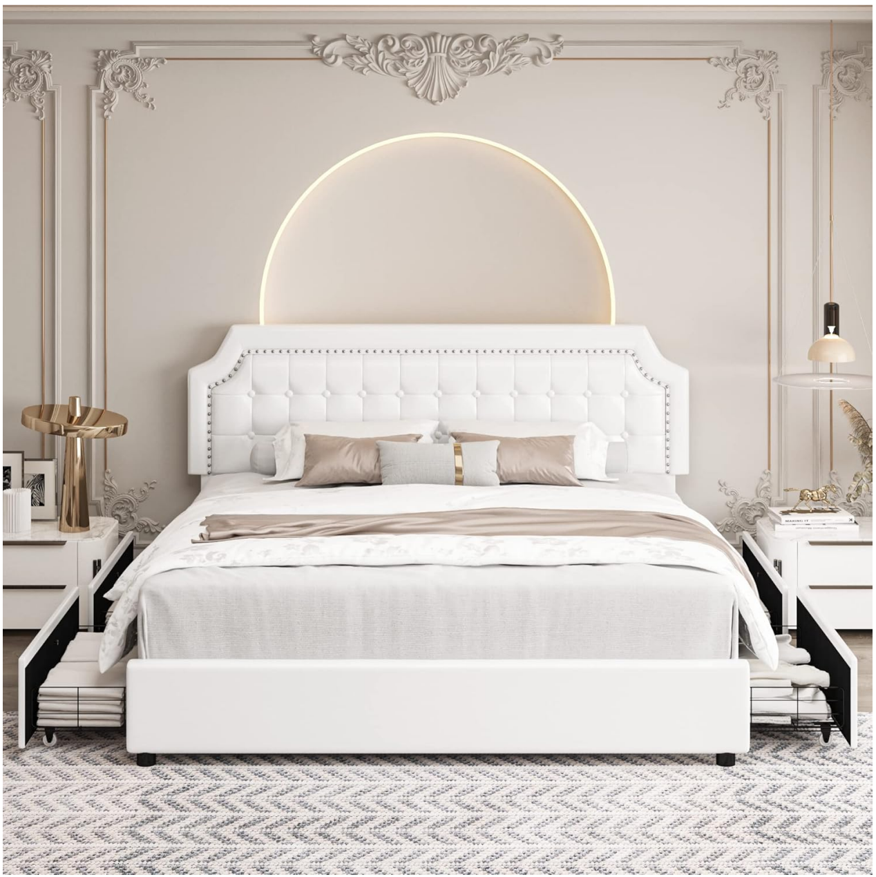
Image: Overview of the Brabrey King Size Upholstered Platform Bed Frame. This image displays the complete bed frame with its upholstered headboard, side rails, footboard, and four integrated storage drawers.