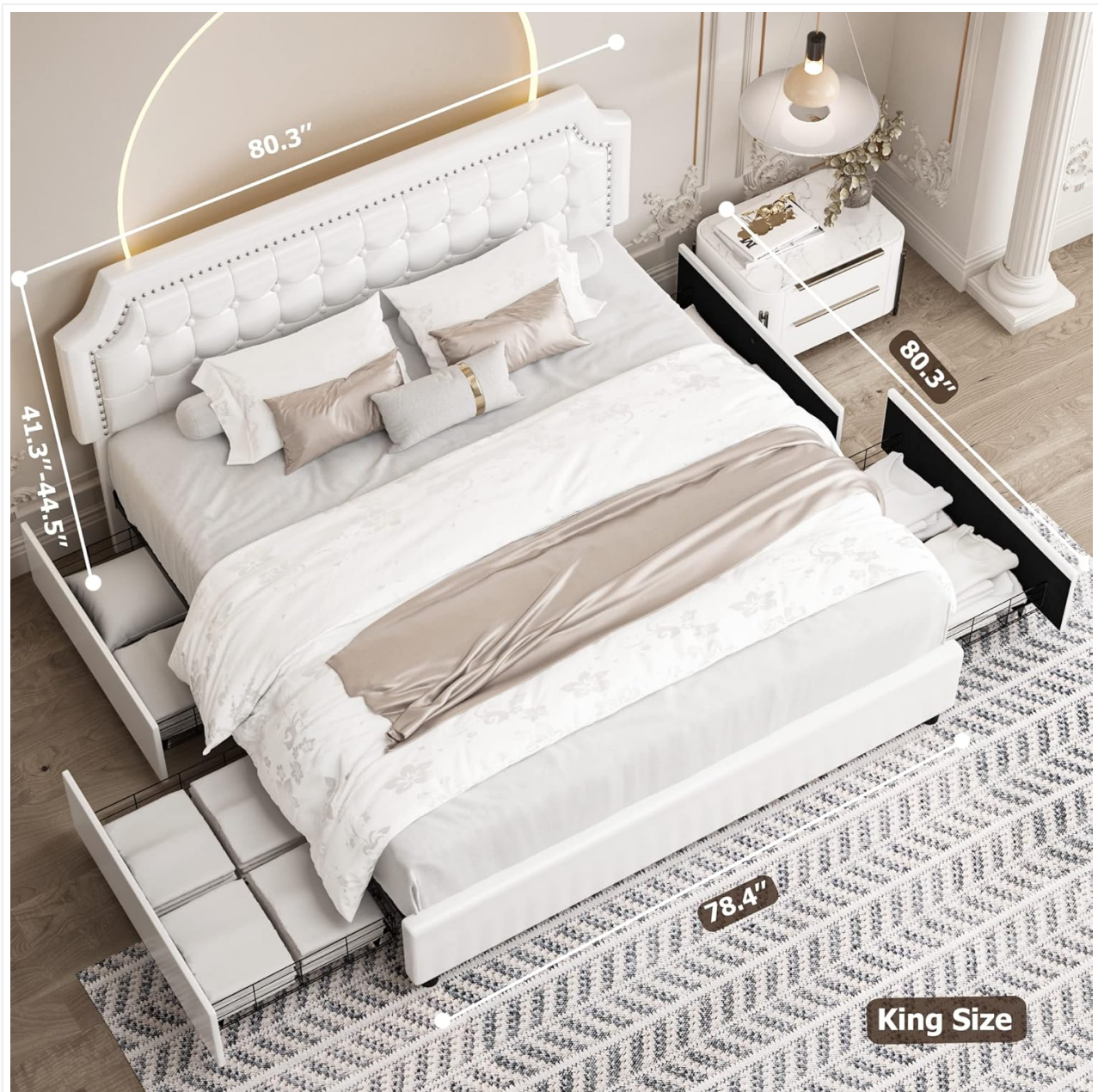
Image: Dimensional view of the King Size bed frame. This image illustrates the overall length, width, and height of the King Size bed frame, including the dimensions of the storage drawers.