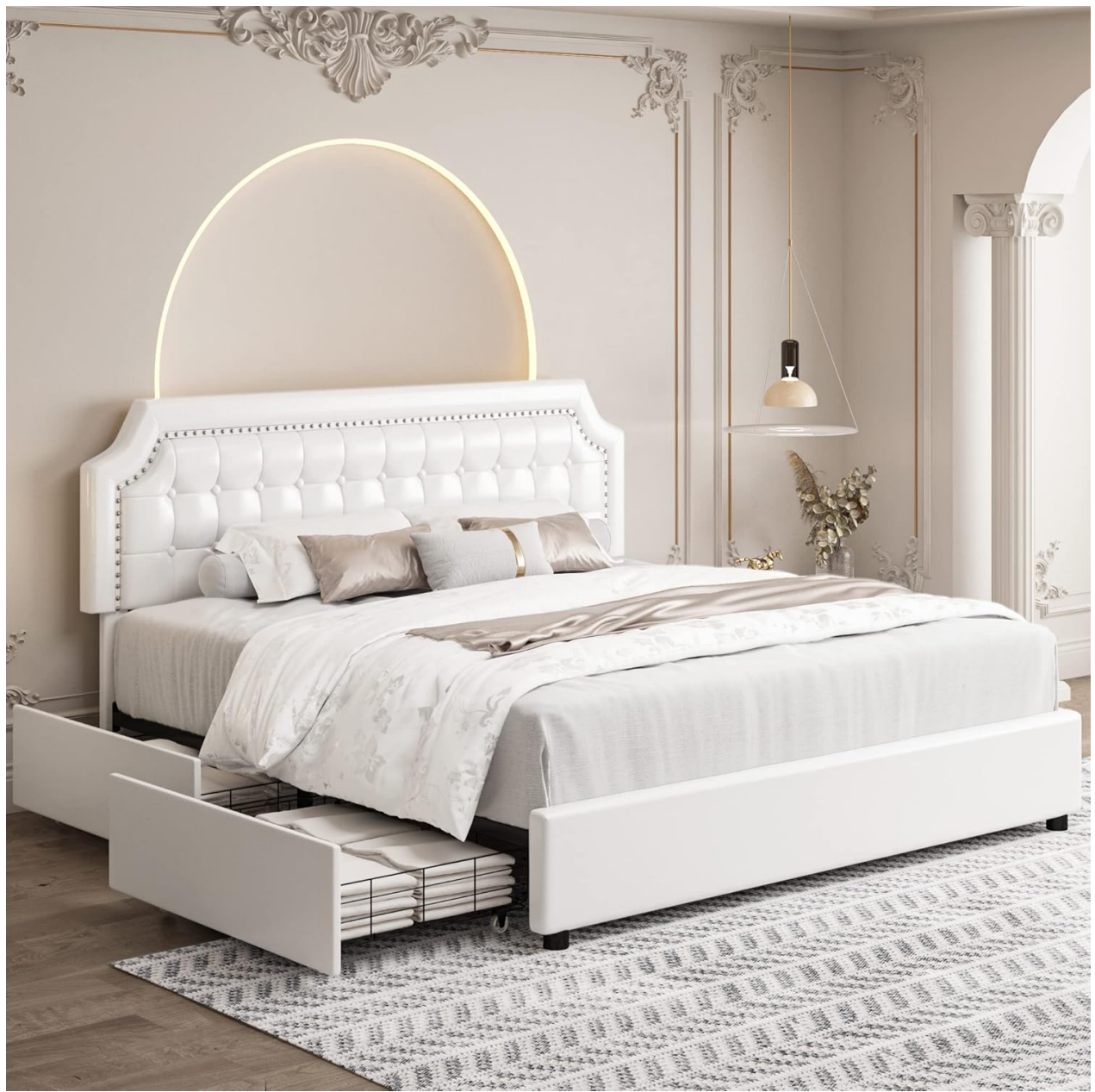
Image: Brabrety bed frame with all four storage drawers extended. This image shows the accessibility and capacity of the under-bed storage drawers.