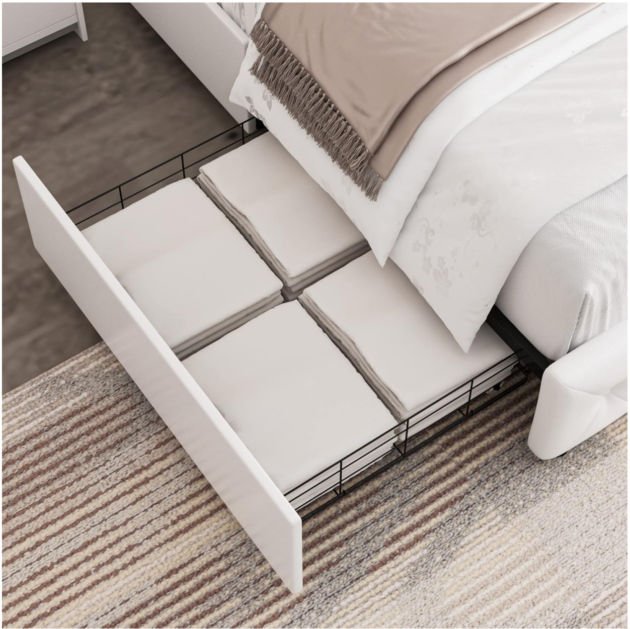
Image: Close-up view of an open storage drawer. This image shows one of the four under-bed drawers, highlighting its capacity for storing items like folded bedding.