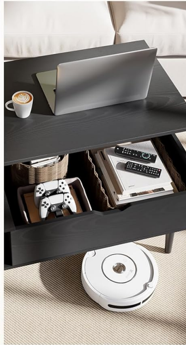
Large Hidden Compartment under the Top Table