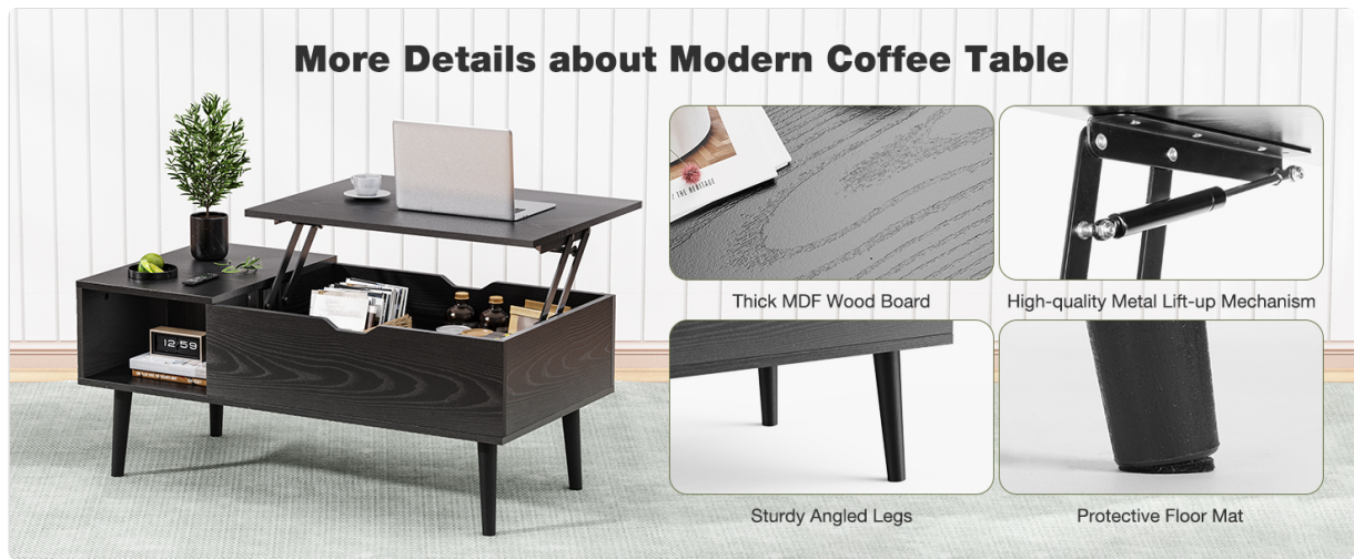
Image 4.2: Key features of the coffee table, including the lift mechanism and leg design.