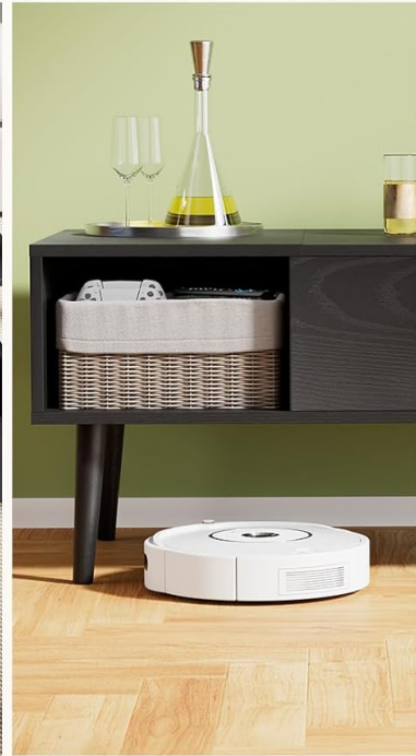
Storage Space for Robotic Vacuums