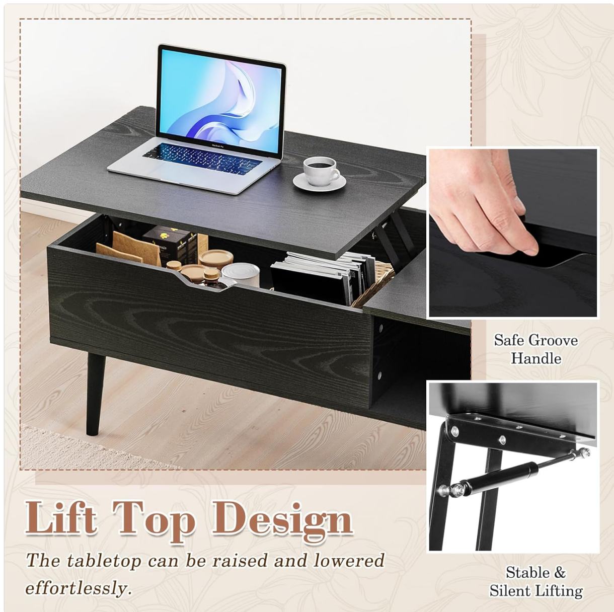
Image 5.1: Demonstrating the lift-top mechanism and safe groove handle.