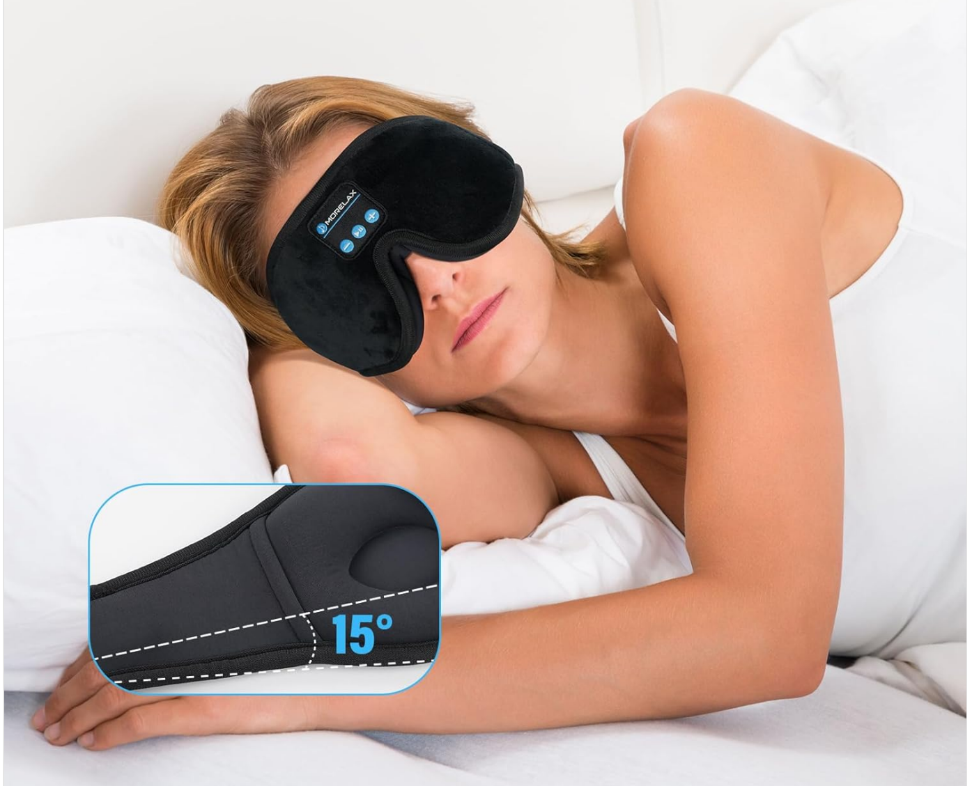
Figure 2: A user demonstrating the 3D contoured cup design of the sleep mask, ensuring a comfortable and pressure-free fit.

Designed with ultra-fit sides featuring a 15° tilt, which is perfect for side sleepers. offering a perfect fit and ensuring uninterrupted, pressure-free sleep.