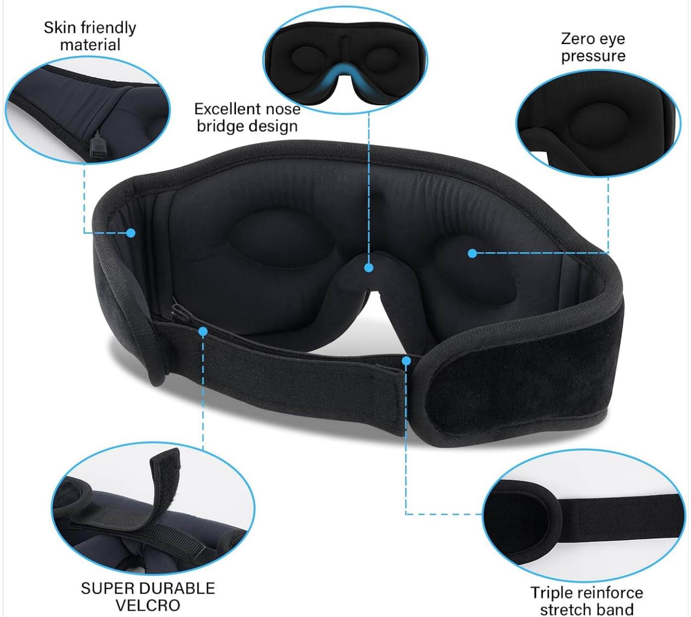
Figure 1: Morelax Bluetooth Sleep Mask MA303-1, highlighting skin-friendly material, excellent nose bridge design, zero eye pressure, super durable Velcro, and a triple reinforced stretch band.