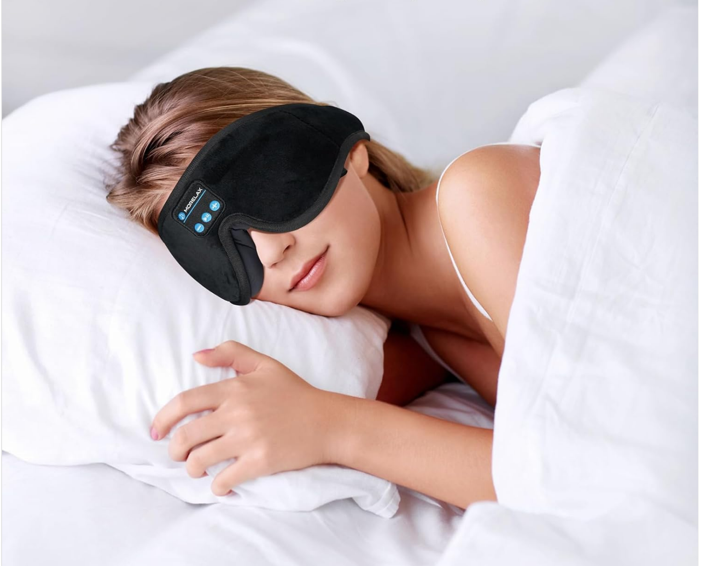
Figure 5: The sleep mask offers extended battery life, allowing for prolonged use on a single charge.