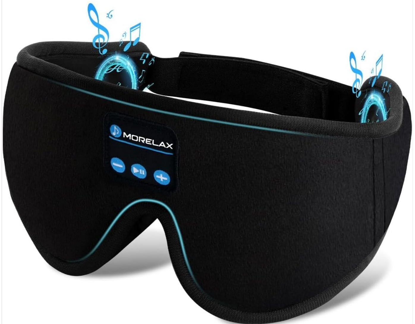
Figure 4: The sleep mask showcasing its HiFi stereo sound capabilities with Bluetooth 5.2 and 11MM drivers.