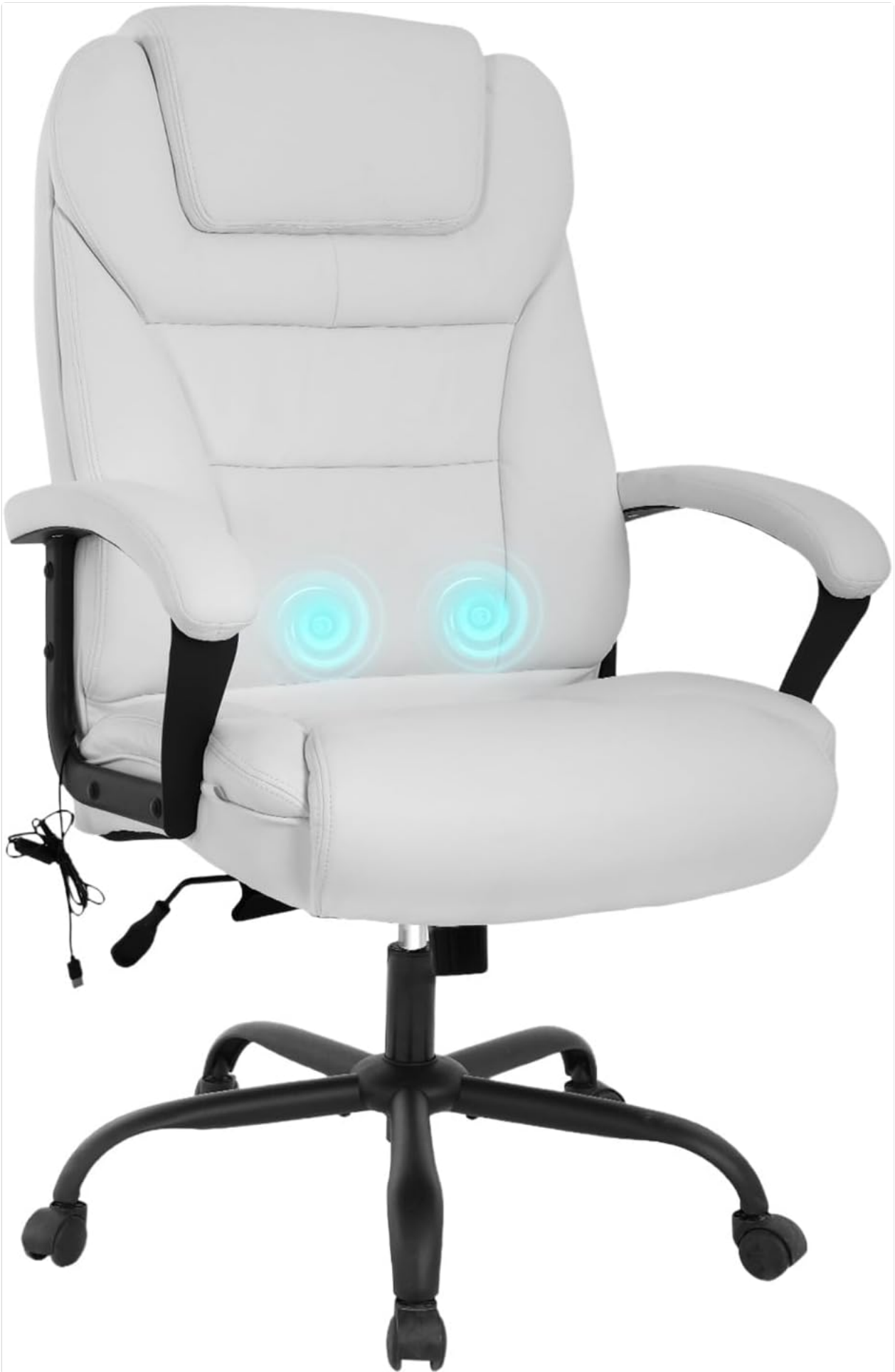
Image 1.1: The FDW Big and Tall Office Chair (White) in an office environment.