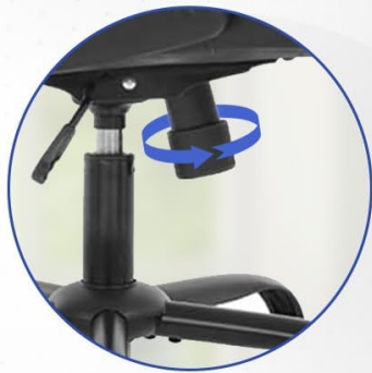
Tilt Tension Knob

The rocking mode can relax you from heavy work