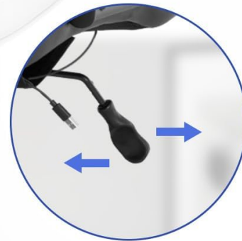
Out for reclining in for lock