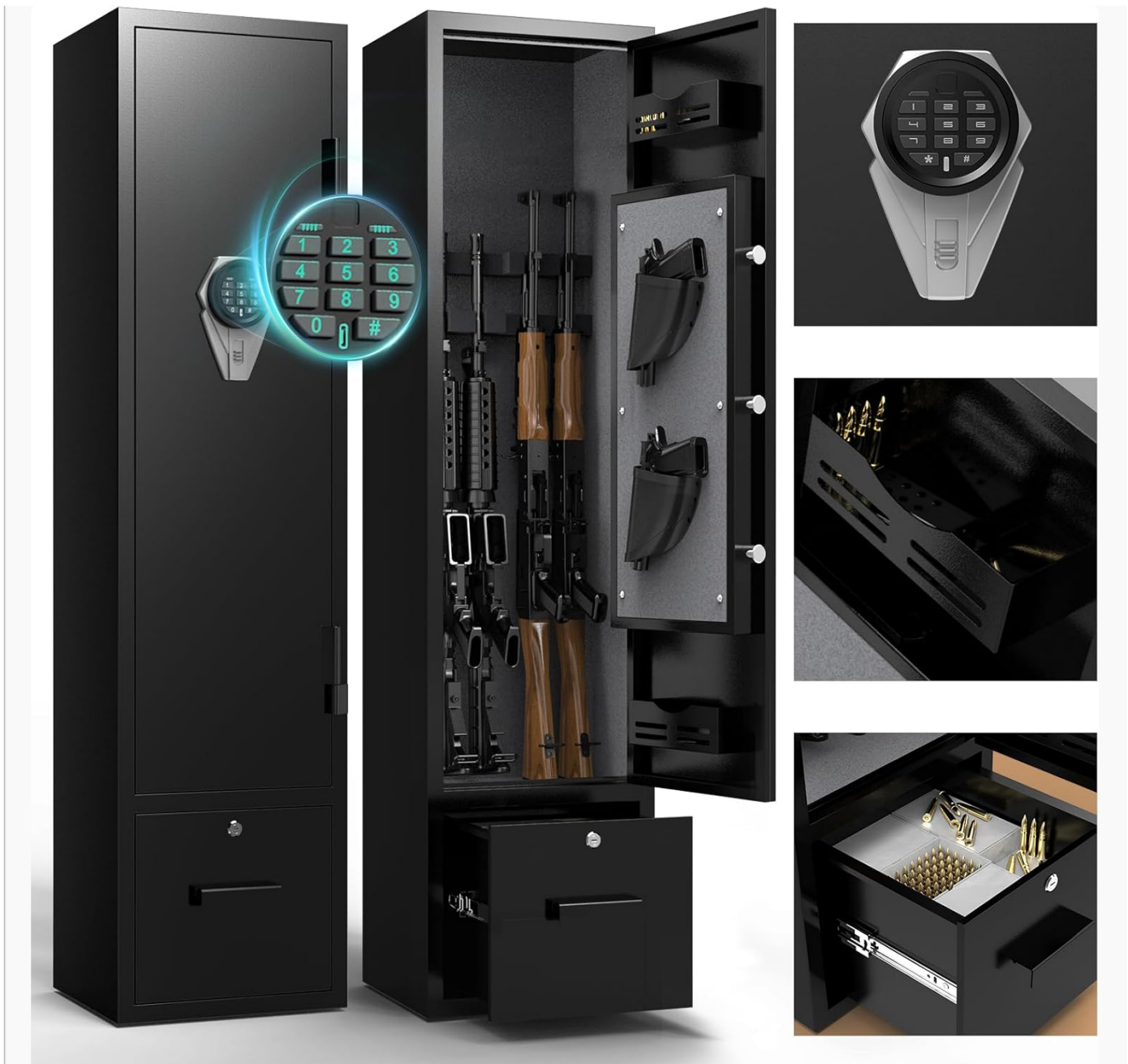
Image: The Marcree 3-5 Gun Safe, showcasing its sleek black exterior, digital keypad, and internal organization for firearms and accessories.