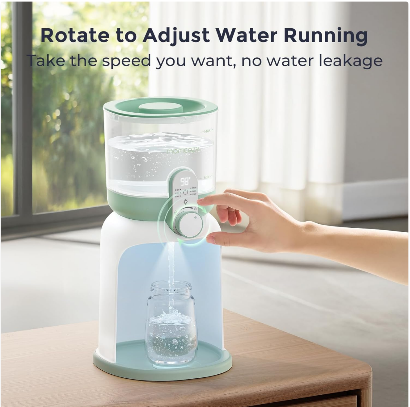
Image 5.2: Demonstrates rotating the knob to adjust the water flow speed, ensuring no water leakage.