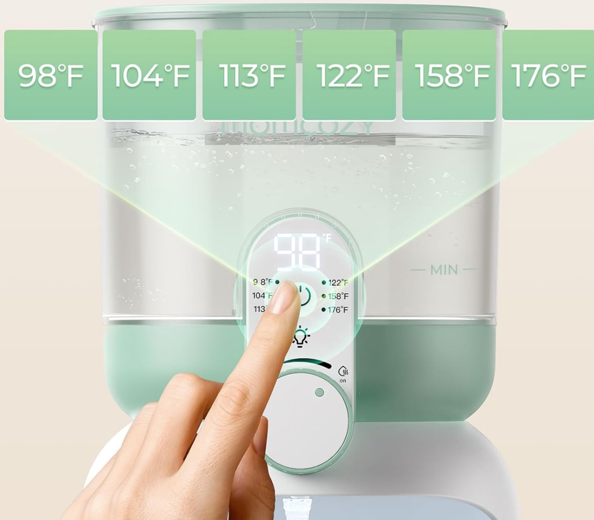
Image 3.1: The control panel displaying the 6 adjustable temperature options: 98°F, 104°F, 113°F, 122°F, 158°F, and 176°F.

For preferred warmth, tailored to your baby's needs