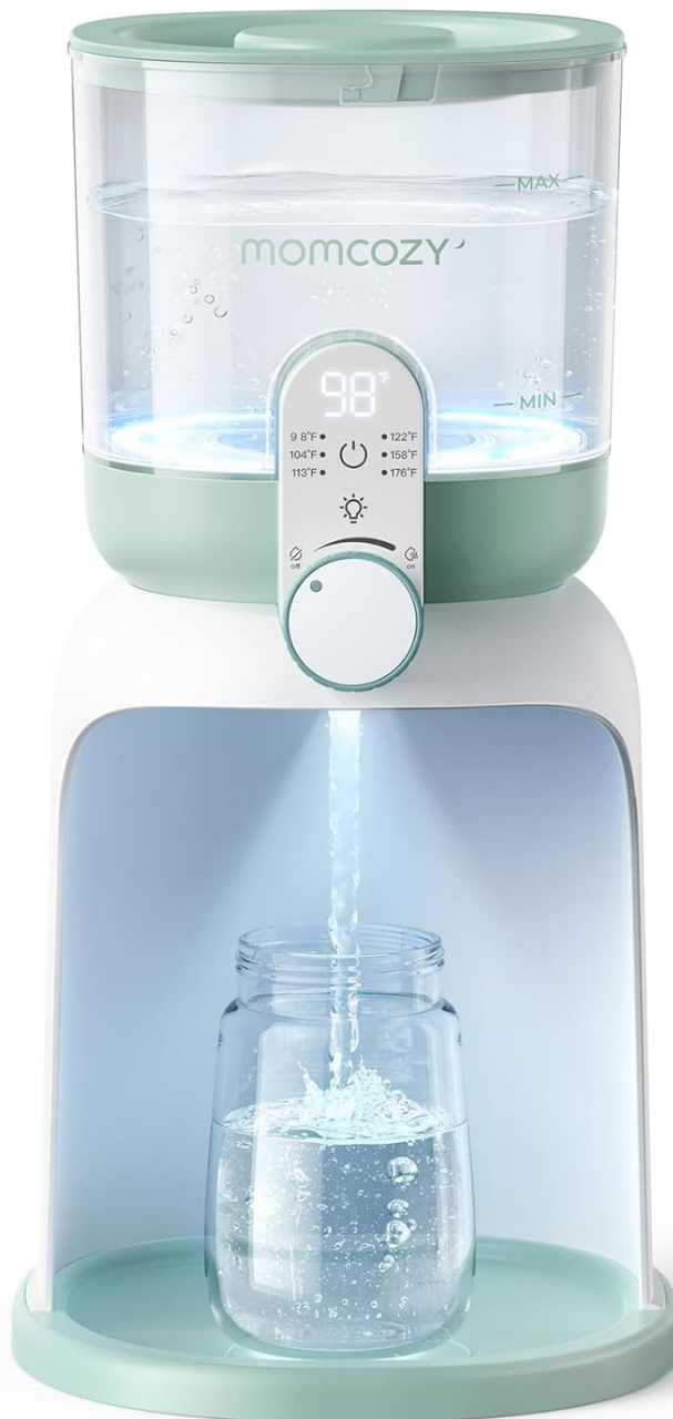
Image 1.1: The Momcozy Dual Lights Water Warmer, showcasing its sleek design and water dispensing function.