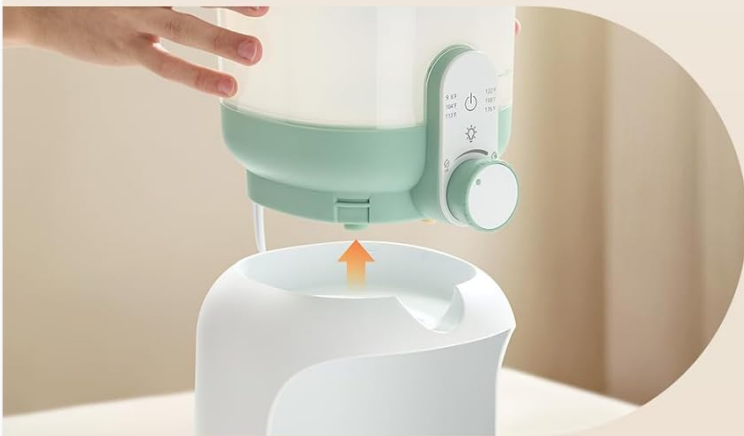
Image 6.1: Steps for detaching the removable water tank for easy cleaning: gently shake to release the latch, then lift.