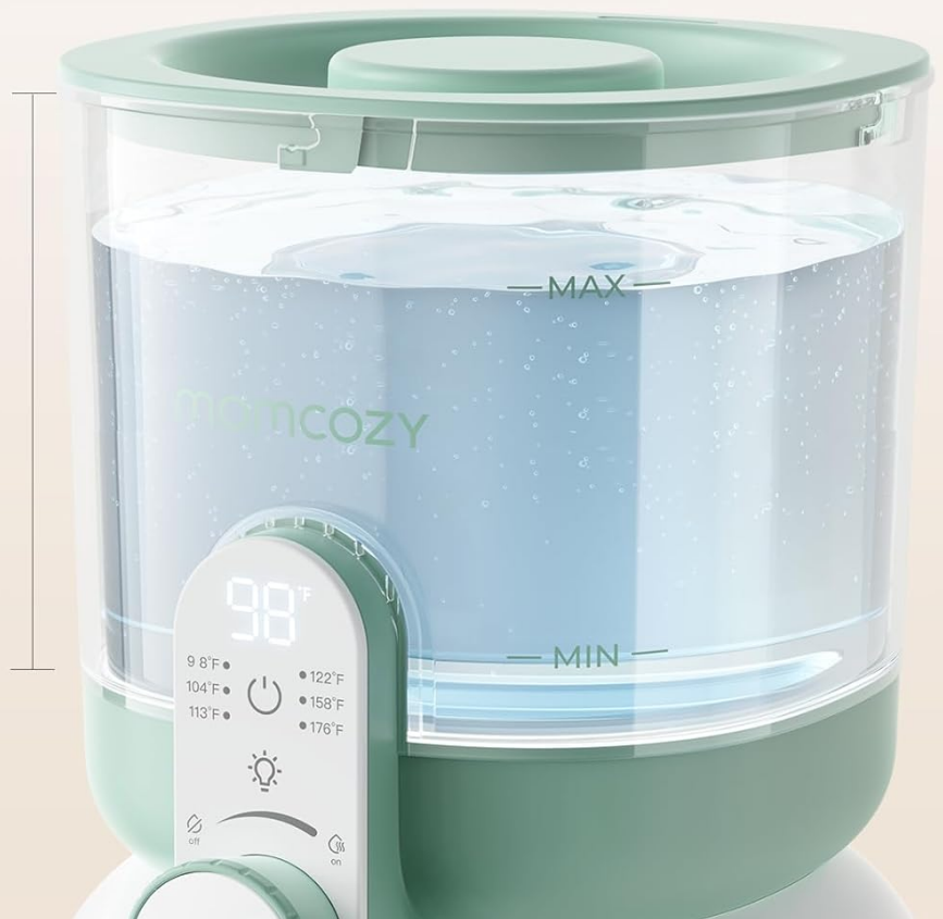
Image 3.2: Illustration of the 57 oz water tank capacity, capable of preparing approximately 14 bottles of 4 oz or 11 bottles of 5 oz.