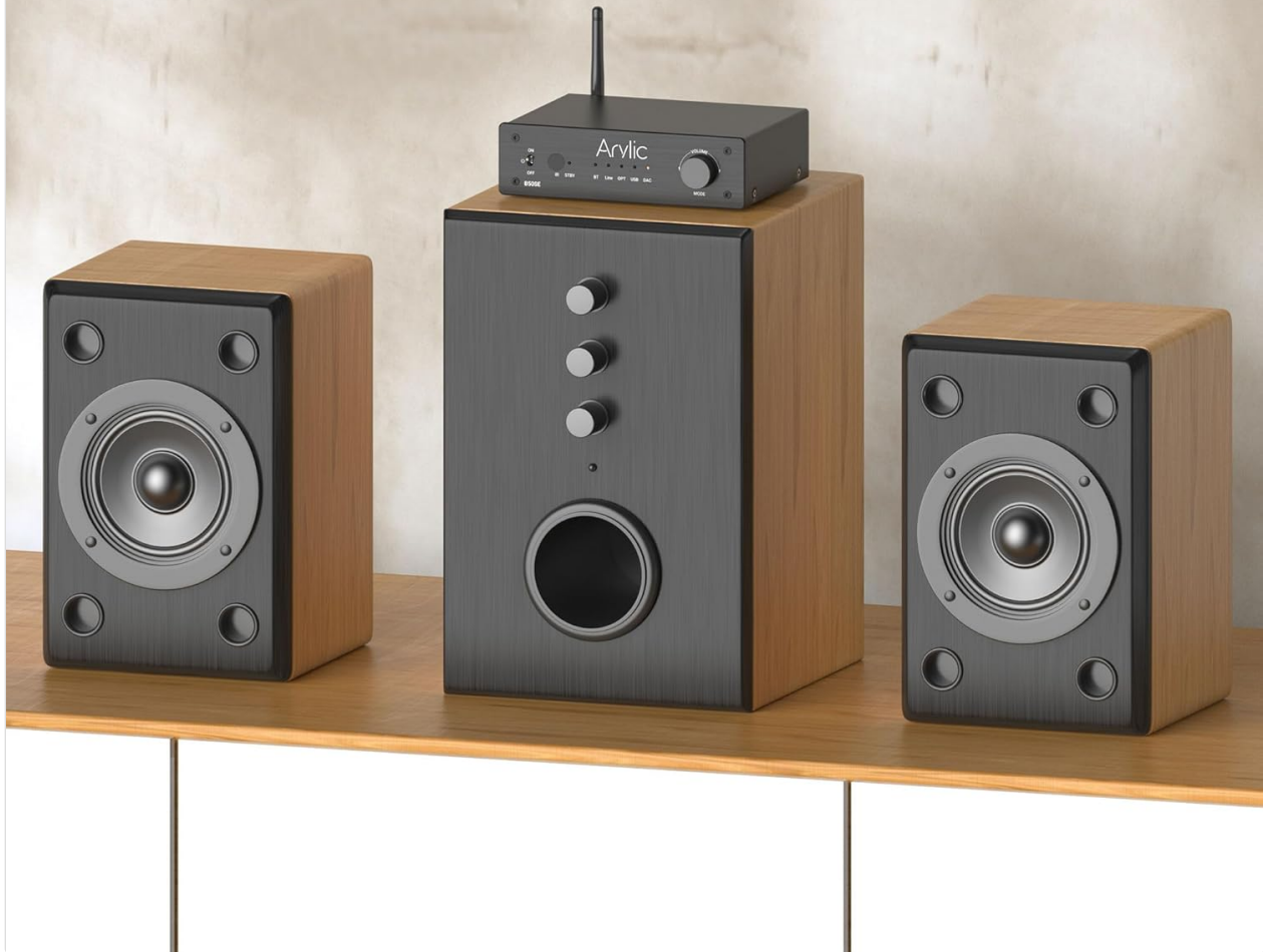
Figure 4.2: Example setup with Arylic B50SE, passive speakers, and an active subwoofer.