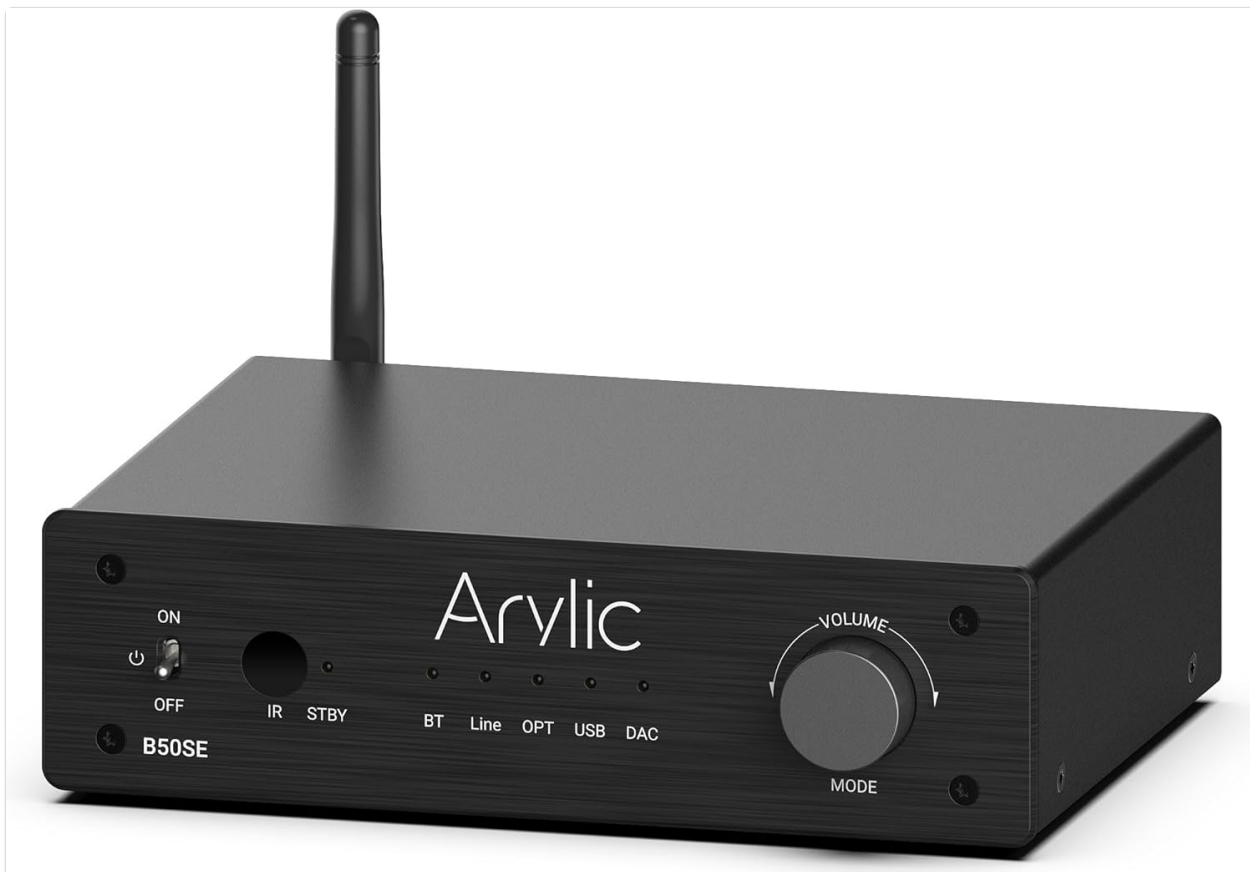
Figure 1.1: Front view of the Arylic B50SE Bluetooth 5.1 Stereo Receiver.

The Arylic B50SE Bluetooth 5.1 Stereo Receiver is a compact and powerful Class D integrated amplifier designed to enhance your home audio experience. It delivers 50W x 2 output, capable of driving various passive speakers, and features seamless Bluetooth connectivity, an intuitive EQ control application, and multiple input options for versatile use.