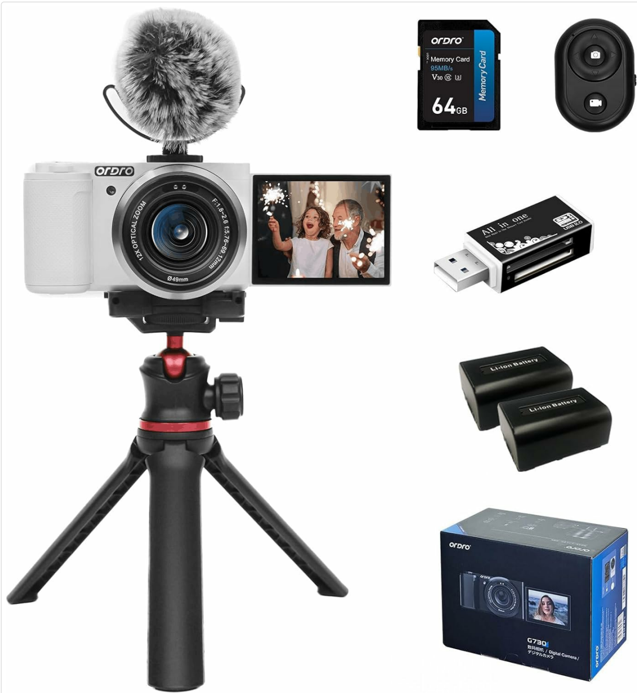
Figure 4.1: Front view of the ORDRO G730 Digital Camera, showing the lens and ORDRO branding.