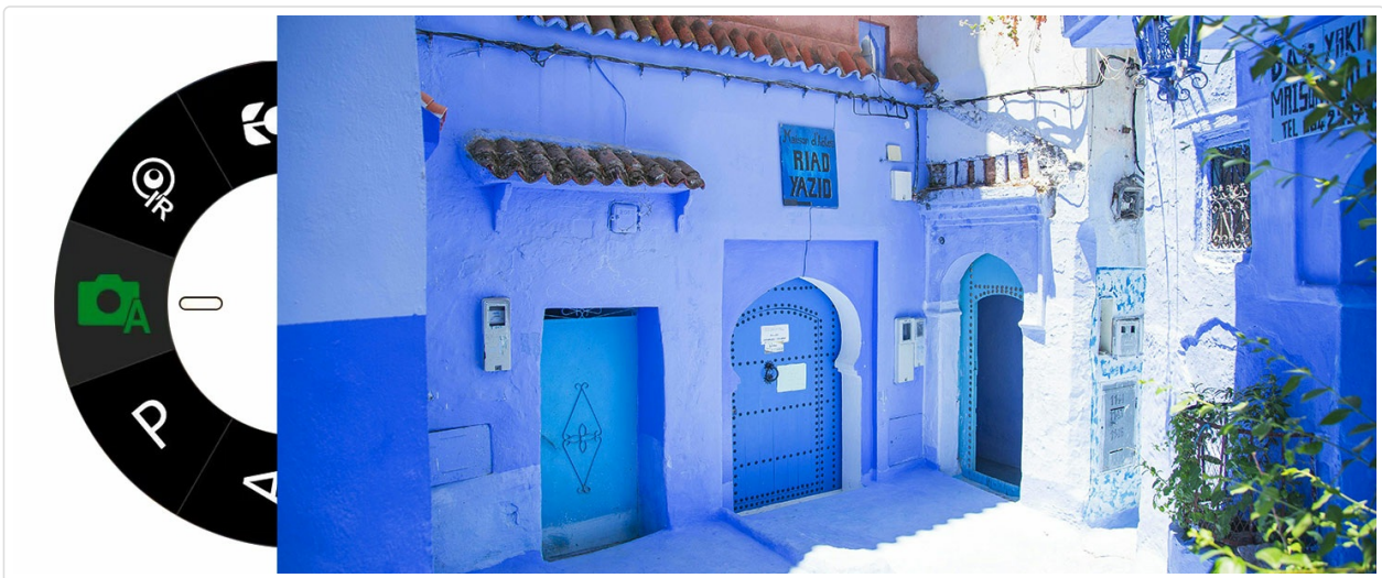
Figure 5.1: Overview of the ORDRO G730's video (5K 30fps, 4K 60fps, 2.7K 60fps, 1080p 60fps) and photo (64M, 56M, 48M, 36M, 30M) capabilities.