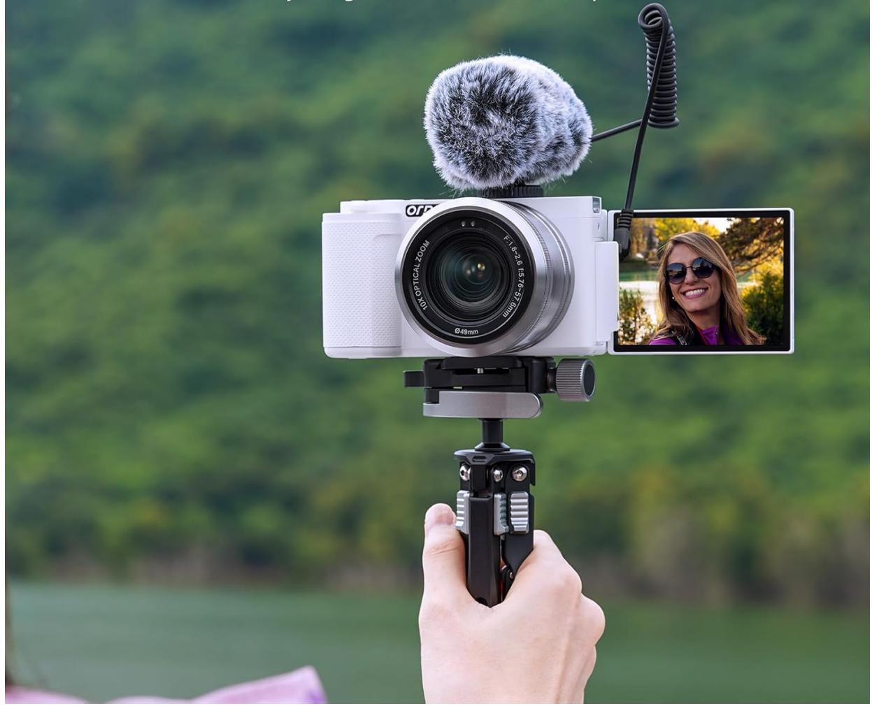
Figure 4.2: Side view of the ORDRO G730 Digital Camera, illustrating the 3.2-inch IPS touch flip screen in an open position.