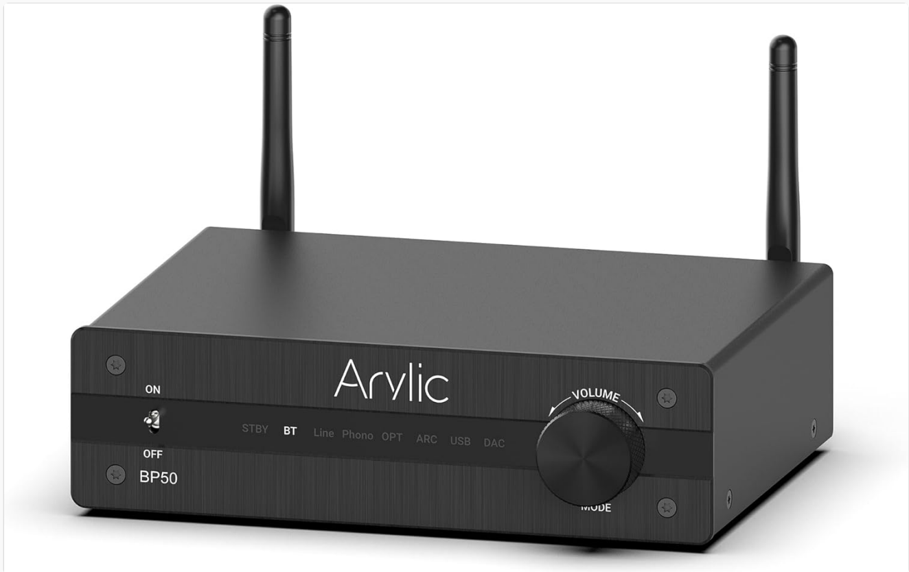
Figure 4.1: Front view of the Arylic BP50 preamplifier. It features a power switch, input indicators (Standby, Bluetooth, Line, Phono, Optical, HDMI ARC, USB, DAC), and a volume/mode knob.

The front panel provides easy access to essential controls and indicators: