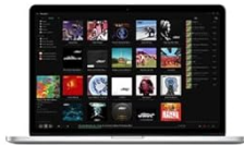
Laptop / PC