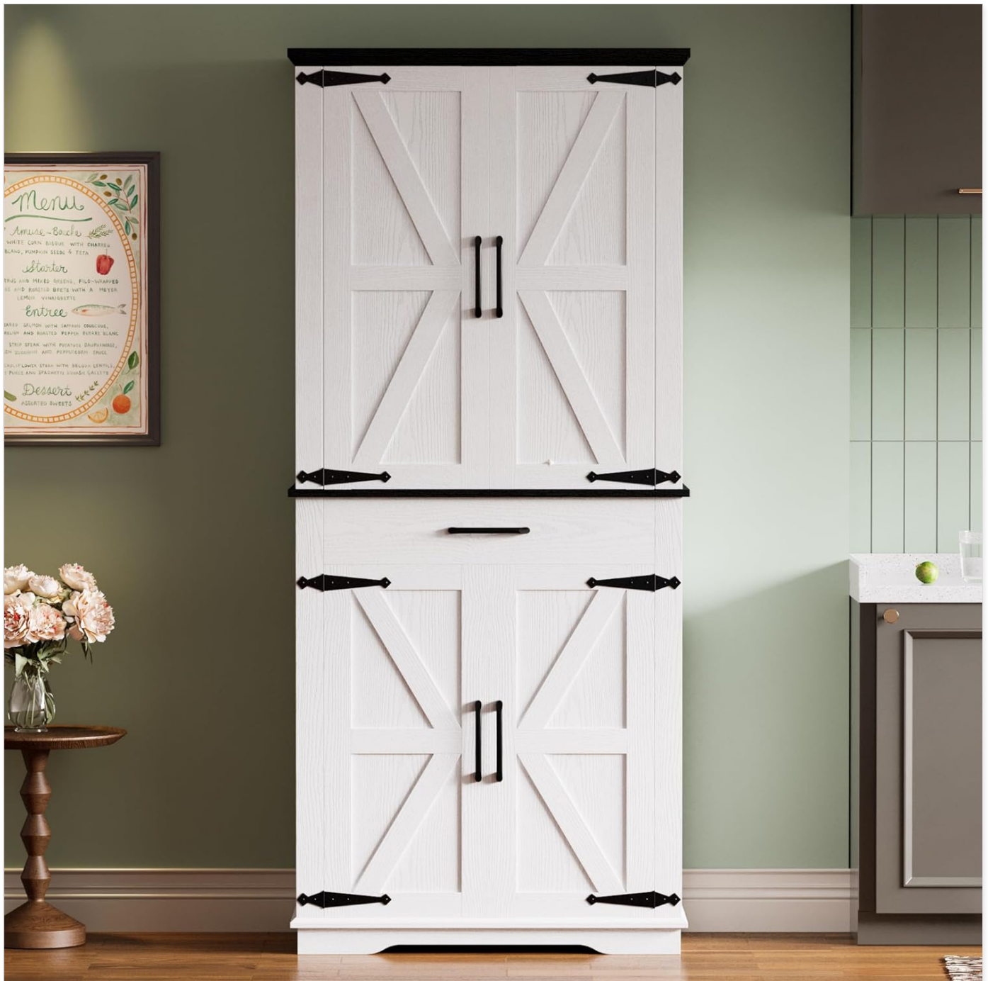
Image: Front view of the assembled IRONCK Farmhouse Kitchen Pantry Cabinet in white and black, showcasing its barn-door style and tall structure.