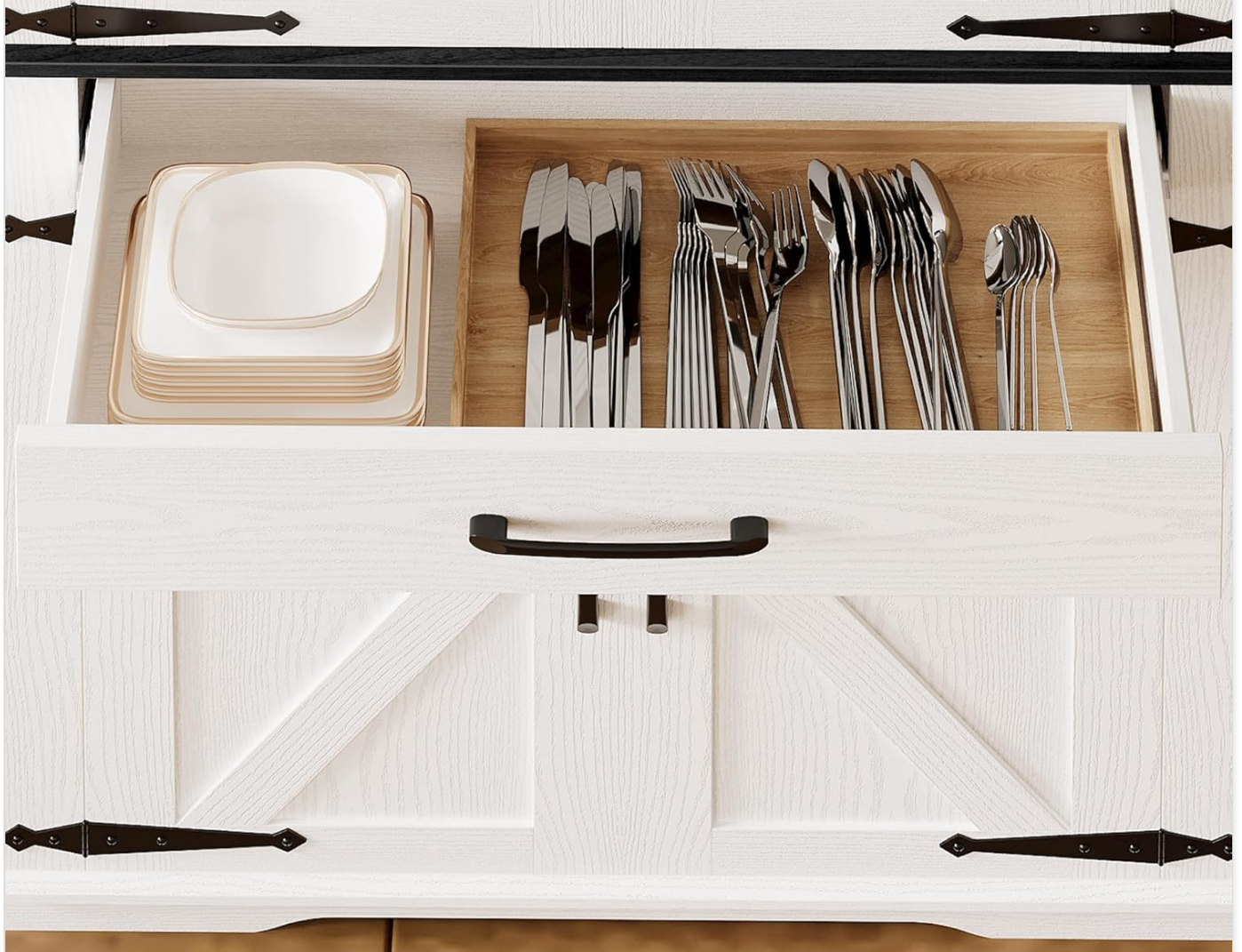
Image: Open drawer of the pantry cabinet, displaying organized cutlery and plates, highlighting its storage capacity.

Large drawers with smooth-running rails open and close easily, perfect for long-term use