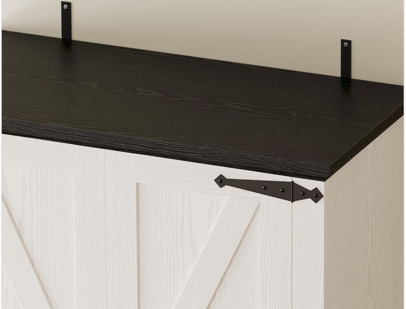
Image: Close-up view of the anti-tip kit installed at the top rear of the cabinet, demonstrating how it secures the unit to the wall for stability.

The anti-tip kit helps secure the tall cabinet to the wall for added stability and safety