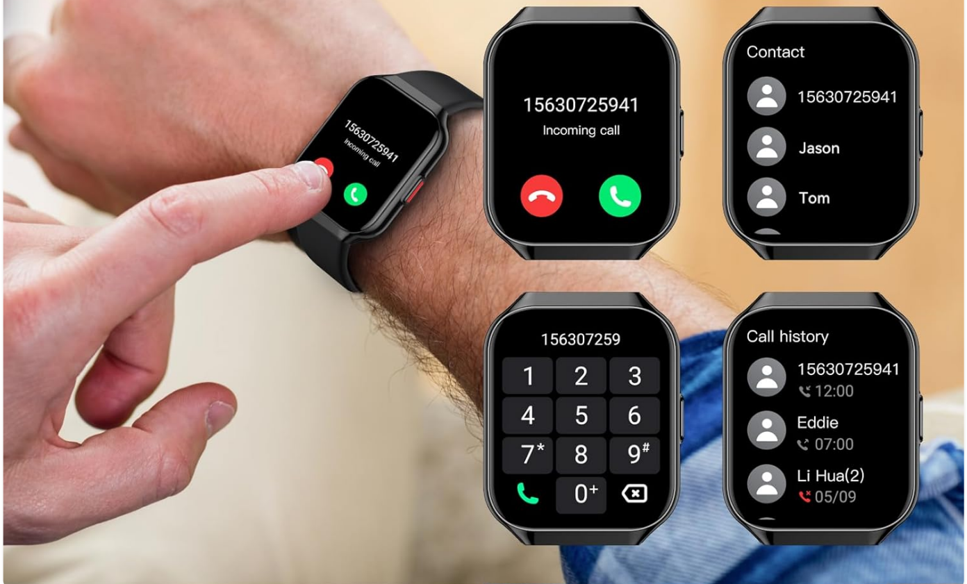
Image: The HOIFA Smart Watch P98 displaying various Bluetooth call functions, including microphone, call logs, speaker, dial pad, and contacts.