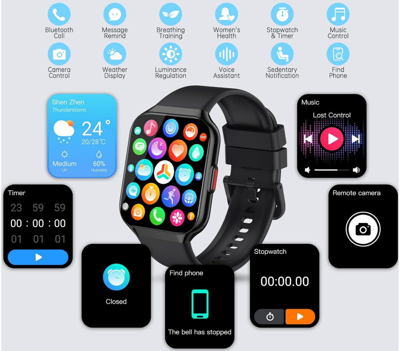
Image: The HOIFA Smart Watch P98 displaying a grid of app icons and examples of various functions like timer, weather, music control, and remote camera.