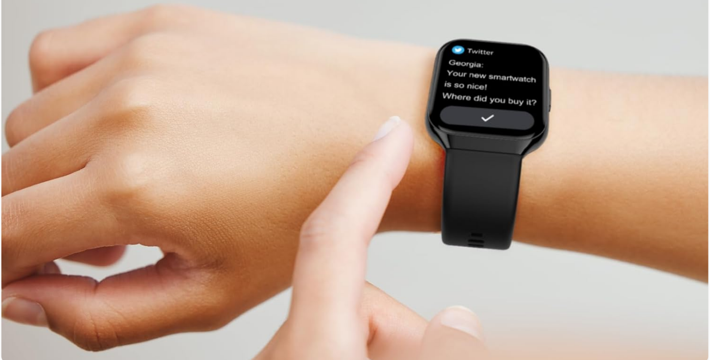
Image: The HOIFA Smart Watch P98 showing a message notification on its screen, with icons of various social media and messaging apps.