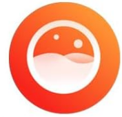
Blood Oxygen Monitor