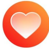
Heart Rate Monitor