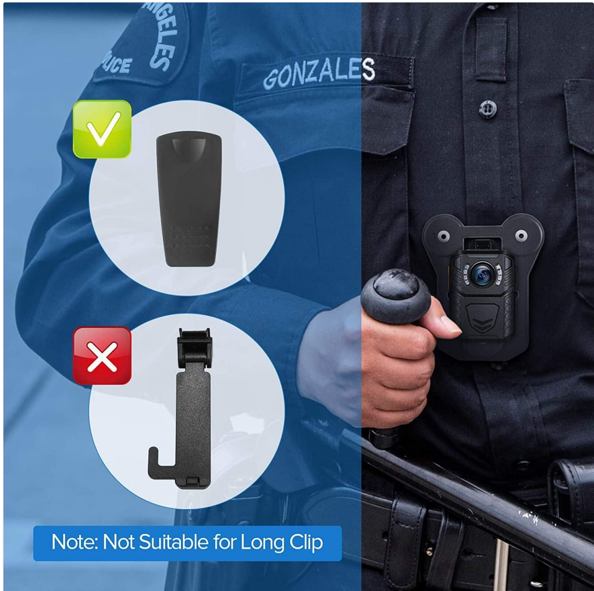
Figure 3.1: Example of the BOBLOV KJ23Pro body camera mounted on a uniform.

This image demonstrates the practical application of the body camera, securely attached to a uniform, ready for use.