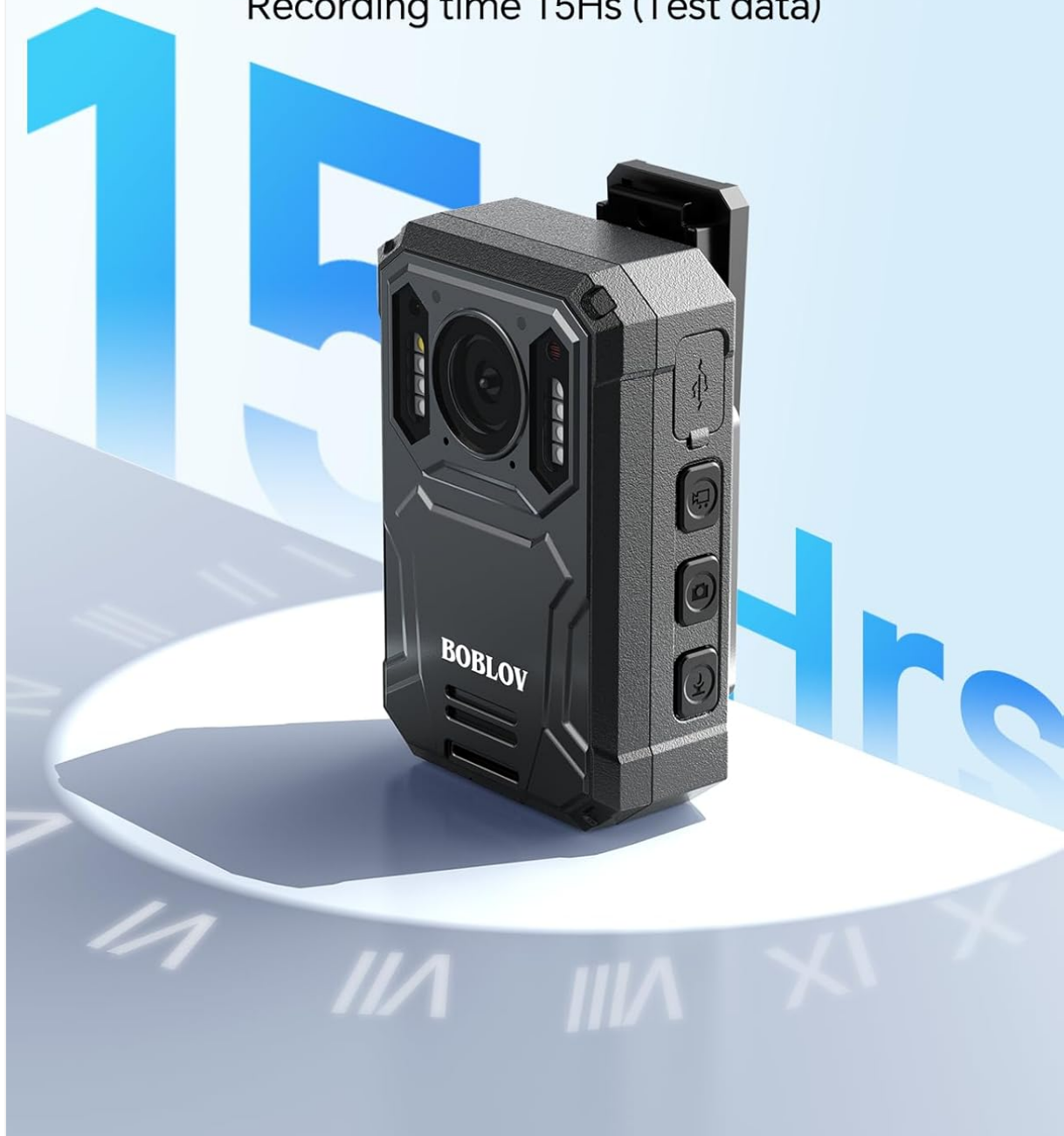
Figure 3.2: The KJ23Pro captures footage in 2K clarity for detailed viewing.

The image emphasizes the high-definition video capability of the KJ23Pro, ensuring critical details are captured with precision.