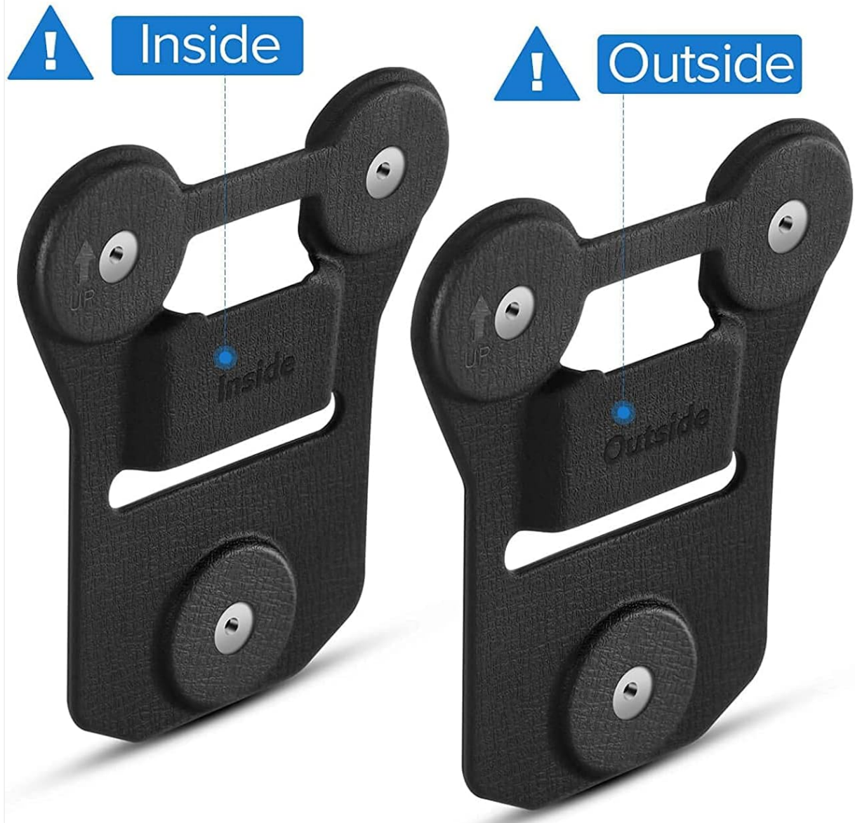
Figure 2.1: Distinguishing the 'Inside' and 'Outside' components for proper installation.

The image above illustrates how to differentiate between the 'Inside' and 'Outside' parts of the magnet mount, which is crucial for correct placement on your clothing.