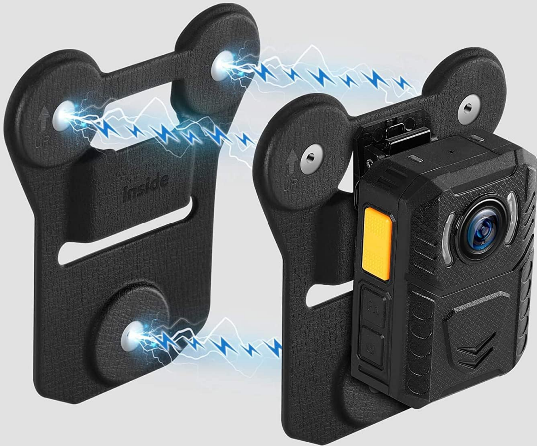
Figure 2.2: The six-magnet design provides strong magnetic force for secure attachment.

Six magnets attract each other to form the strongest Power