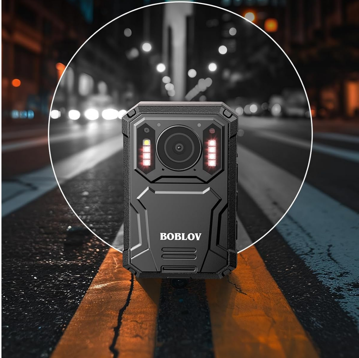
Figure 3.3: The KJ23Pro's 4000mAh battery provides up to 15 hours of continuous recording.

Ensure clear footage in the lowest light conditions.