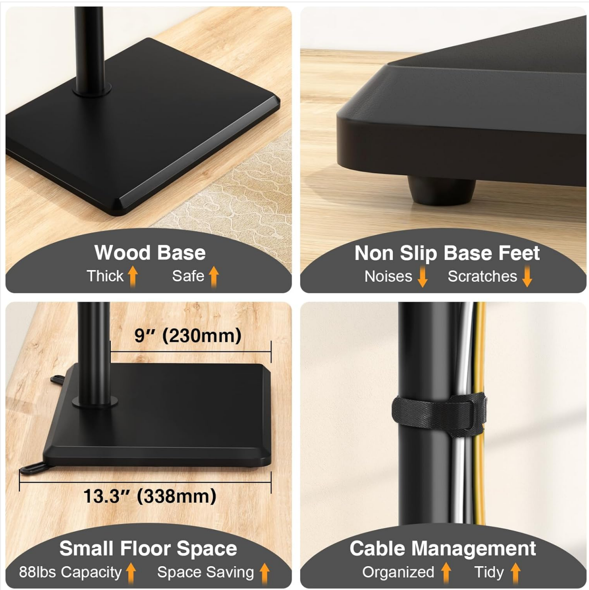
Image: Detailed view of the wooden base, highlighting its thickness, non-slip feet, compact footprint, and integrated cable management solution.