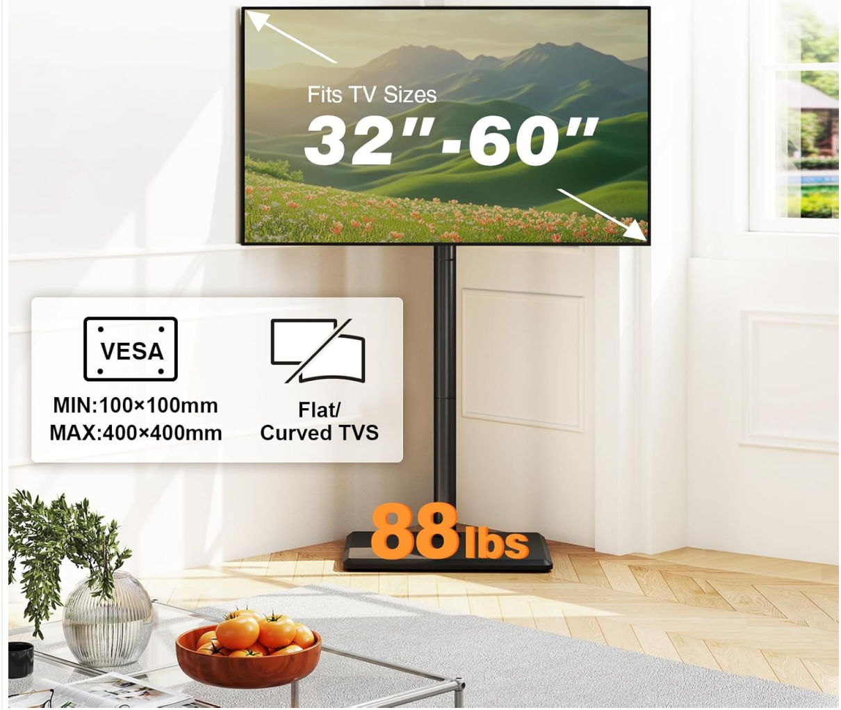
Image: Compatibility diagram illustrating supported TV sizes (32-60 inches), maximum weight (88 lbs), and VESA patterns (100x100mm to 400x400mm).