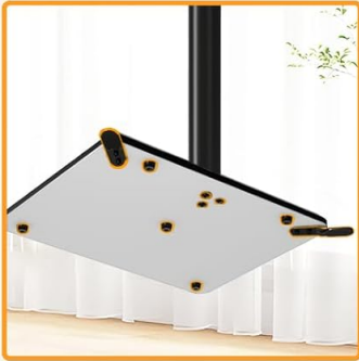
Supporting Foot & Non-Slip Pads