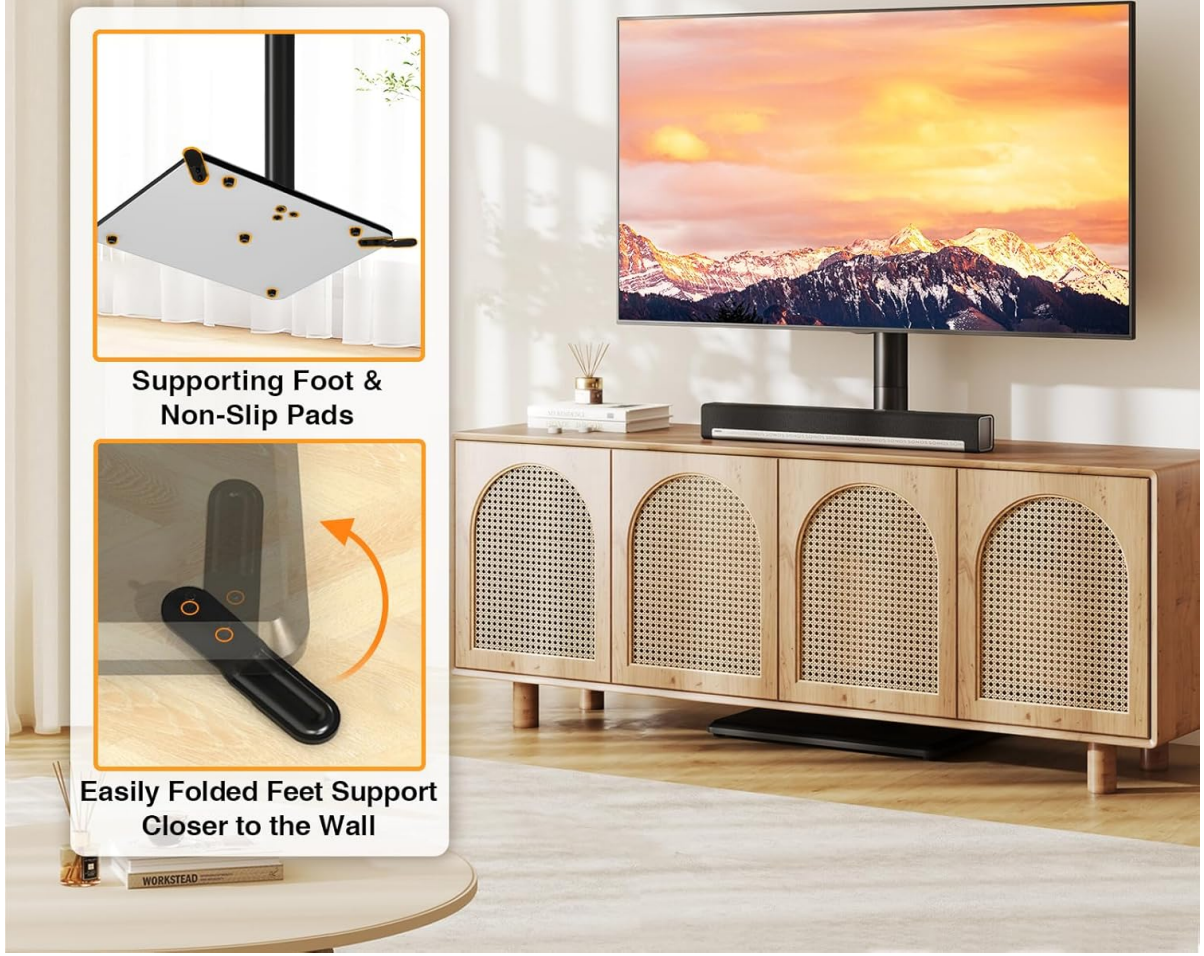
Image: Close-up of the base showing supporting feet and non-slip pads, with an illustration of how the feet can be folded for wall proximity.

Ensure the non-slip pads are securely attached to the bottom of the base feet to prevent scratches and provide additional stability.