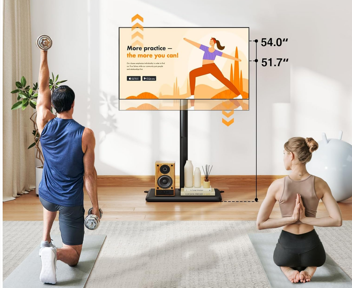
Image: Illustration demonstrating the adjustable height feature, with measurements indicating the minimum (51.7") and maximum (54") heights.