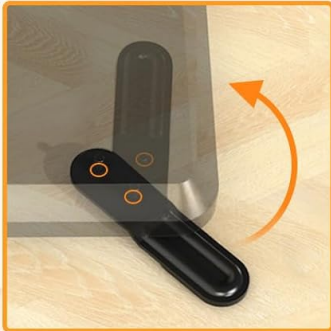
Easily Folded Feet Support Closer to the Wall