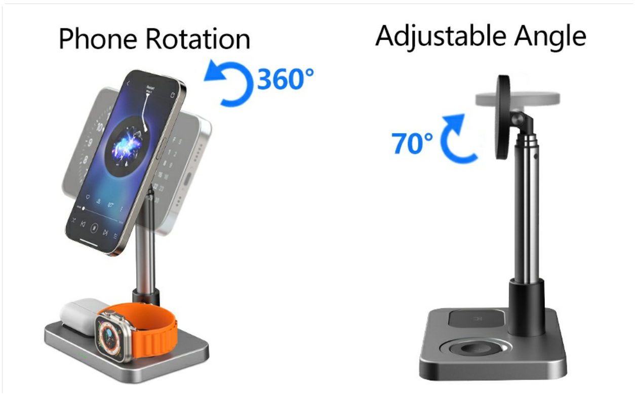
Figure 4.1: Illustration of the adjustable and foldable design of the charging stand.