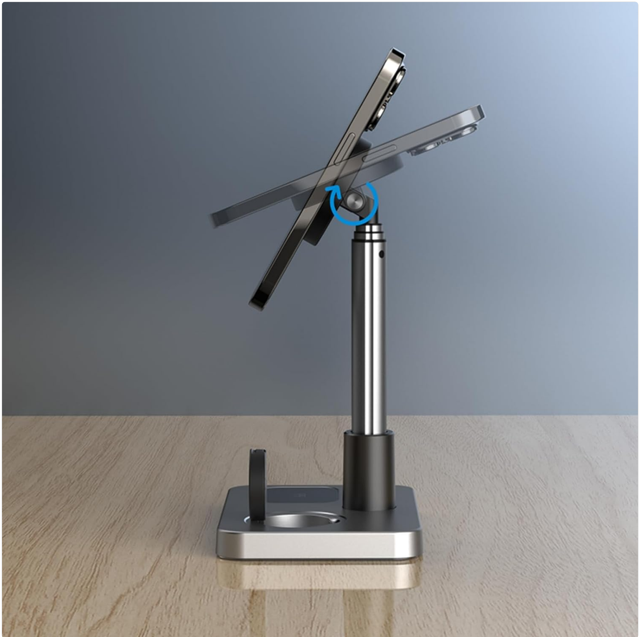
Figure 5.2: The phone charging pad offers adjustable angles for comfortable viewing.