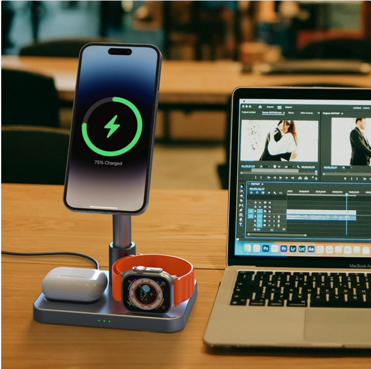
Figure 5.1: The charging station in use, charging an iPhone, Apple Watch, and AirPods simultaneously.