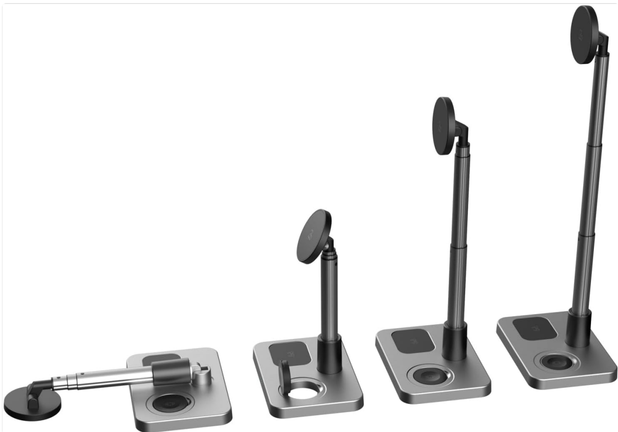
Figure 4.2: Step-by-step visual guide for unfolding and extending the charging station.