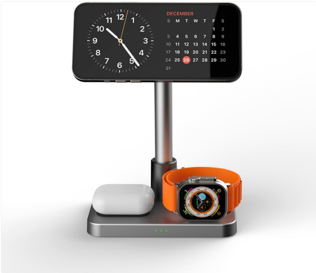
Figure 2.1: The HotTopStar S6 charging station with an iPhone, Apple Watch, and AirPods placed on their respective charging areas.