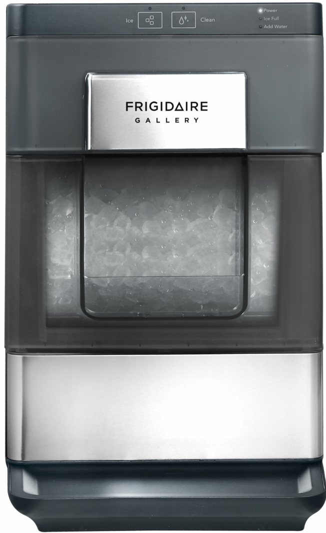
Image: Front view of the Frigidaire Gallery Ice Maker, ideal for illustrating countertop placement.