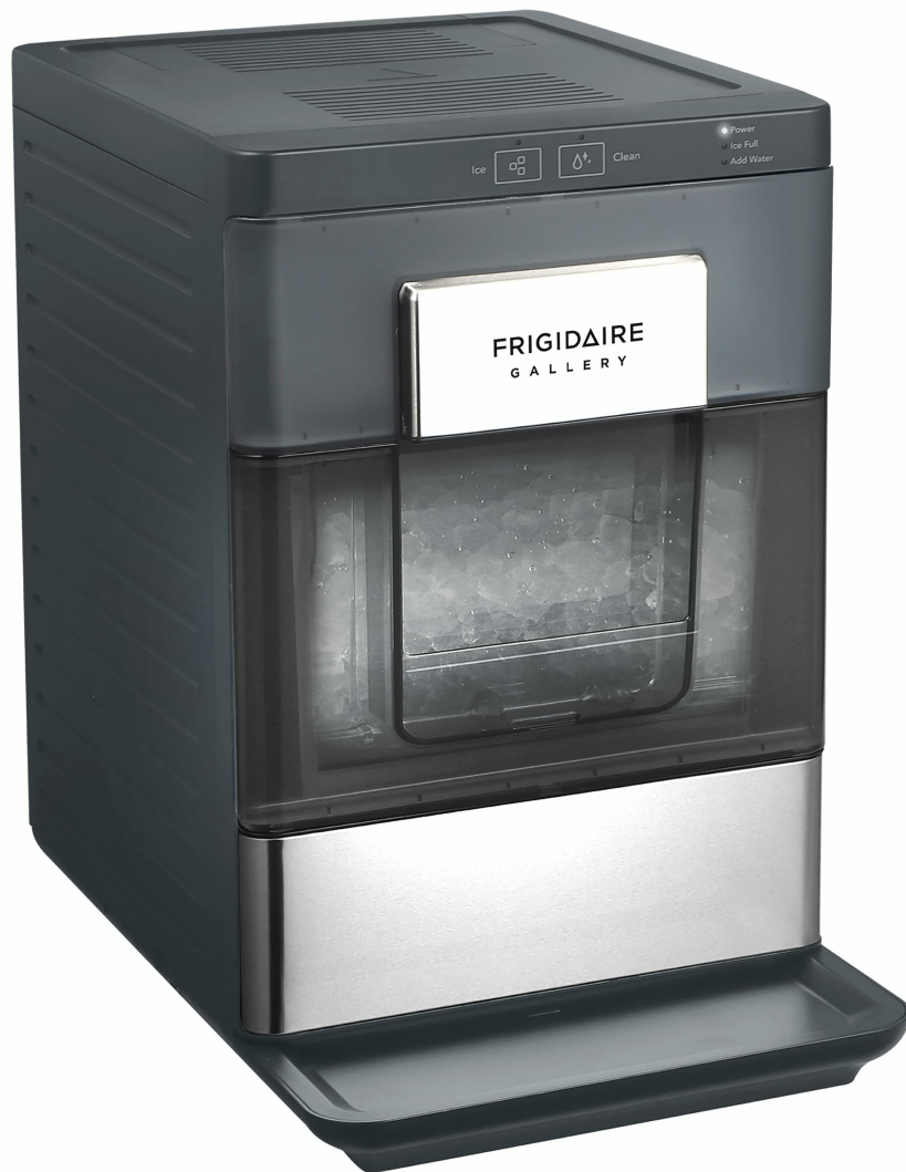
Image: The Frigidaire Gallery Countertop Ice Maker with its included ice bin, ice scoop, and drip tray.