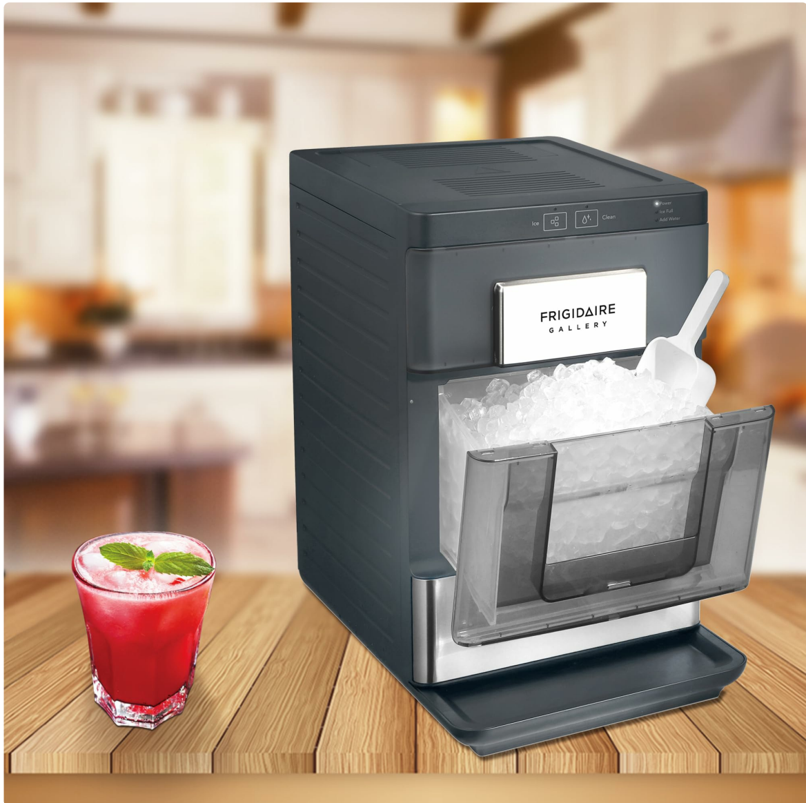
Image: The Frigidaire Gallery Ice Maker on a countertop, showing the ice scoop and drip tray, indicating regular use and maintenance.