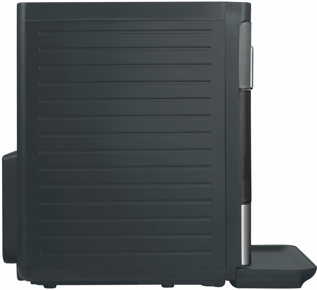
Image: Side view of the Frigidaire Gallery Ice Maker, highlighting the ventilation grilles for proper airflow.