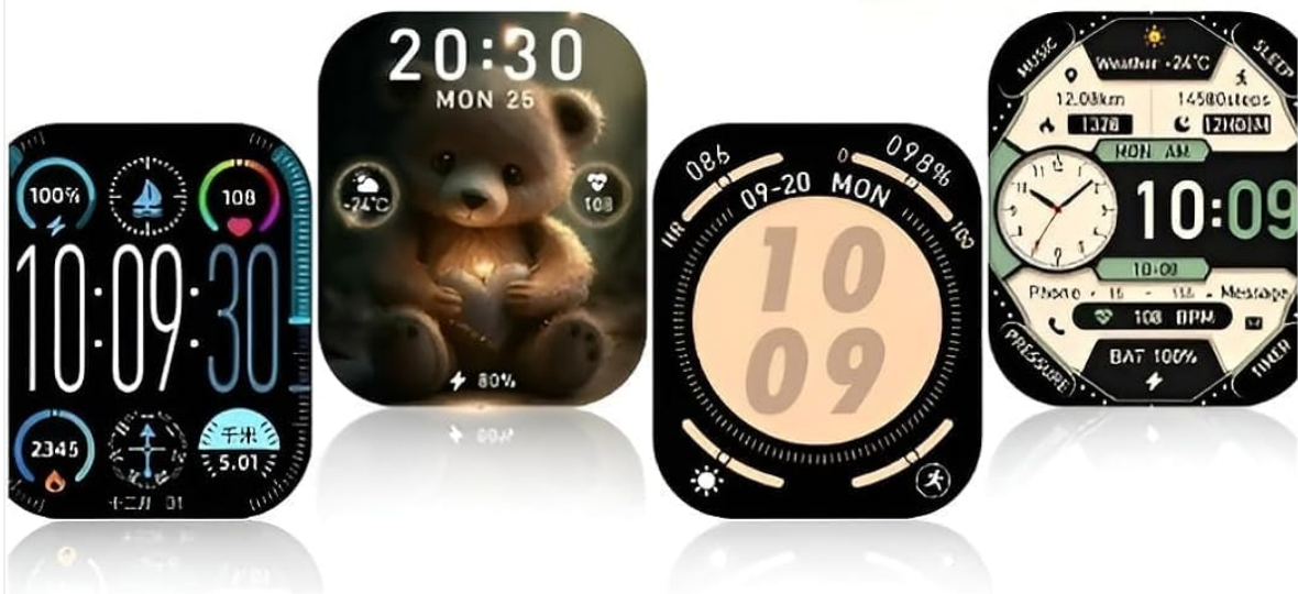
Image: The smart watch screen showcasing several dynamic watch faces, highlighting customization options for the display.