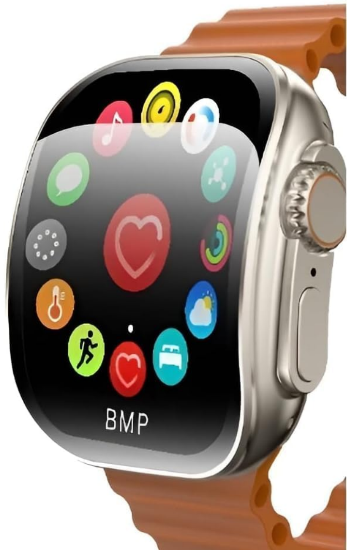
Image: The smart watch screen showing different UI menu layouts, demonstrating the ability to switch between various display styles.