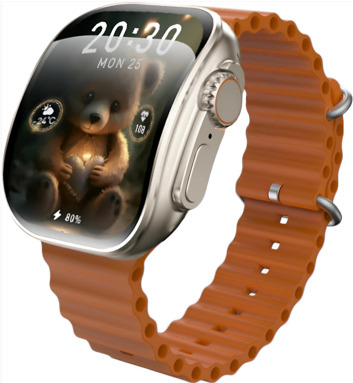
Image: The MERV X10 Ultra 3 Smart Watch, featuring a curved screen and an orange strap. The display shows the time, date, temperature, heart rate, and battery percentage.