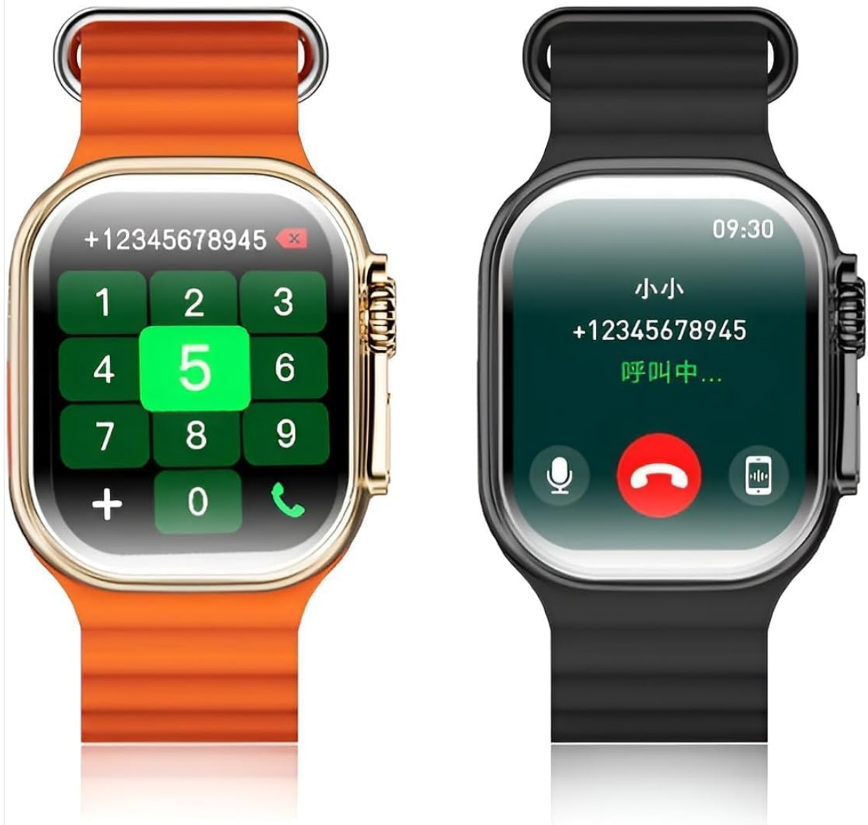
Image: Two smart watches side-by-side, one displaying a dial pad for making calls and the other showing an incoming call notification.

One-click call answer, synchronize mobile phone contacts, do not miss any call