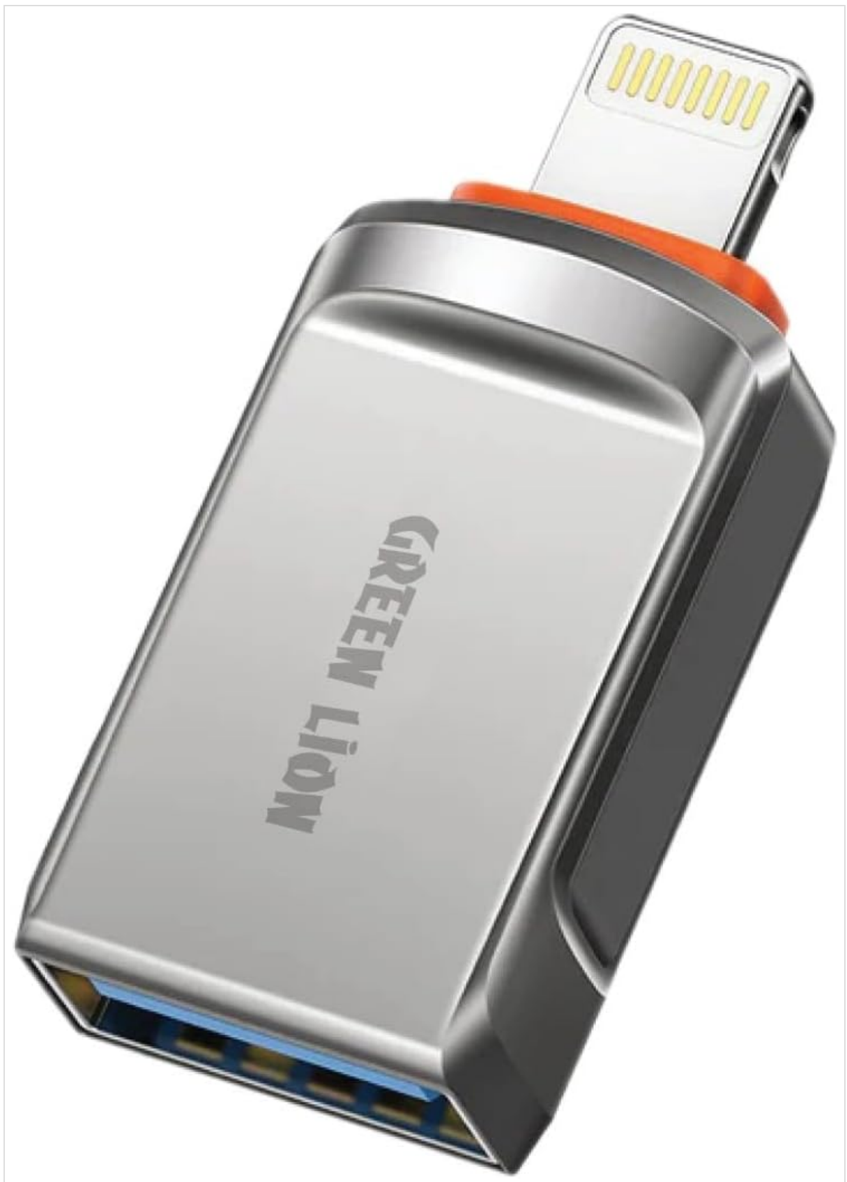
Figure 1: Front view of the Green Lion OTG Adapter USB-A To Lightning Head, showcasing its compact design and metallic finish.