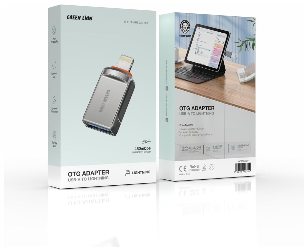
Figure 2: Packaging of the Green Lion OTG Adapter, highlighting key features and specifications.

The Green Lion OTG Adapter features a USB-A port on one end and a Lightning Head connector on the other, allowing for versatile connectivity. It is constructed from a durable zinc alloy shell.