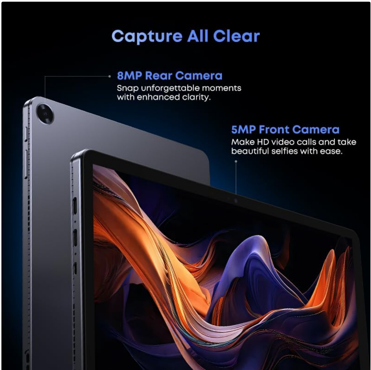
Image: A visual representation highlighting the tablet's 8MP rear camera and 5MP front camera, designed for clear image and video capture.

Make HD video calls and take beautiful selfies with ease.