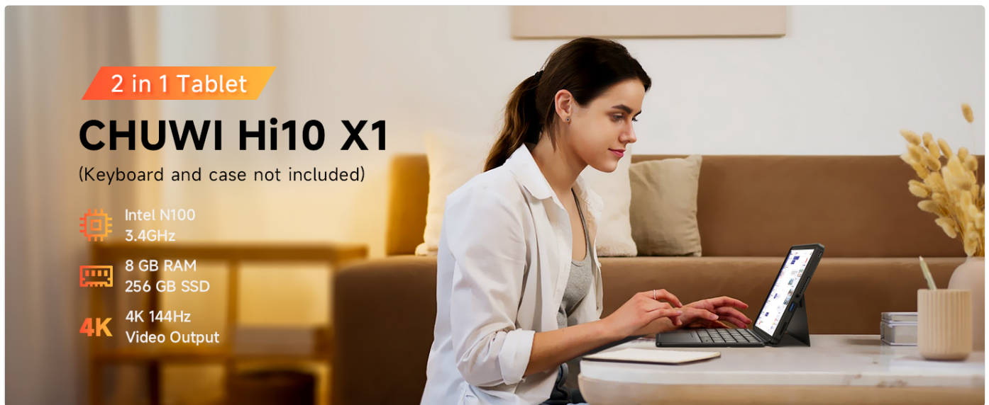
Image: The CHUWI Hi10 X1 tablet configured in 2-in-1 mode with an attached keyboard, demonstrating its versatility for work and entertainment.