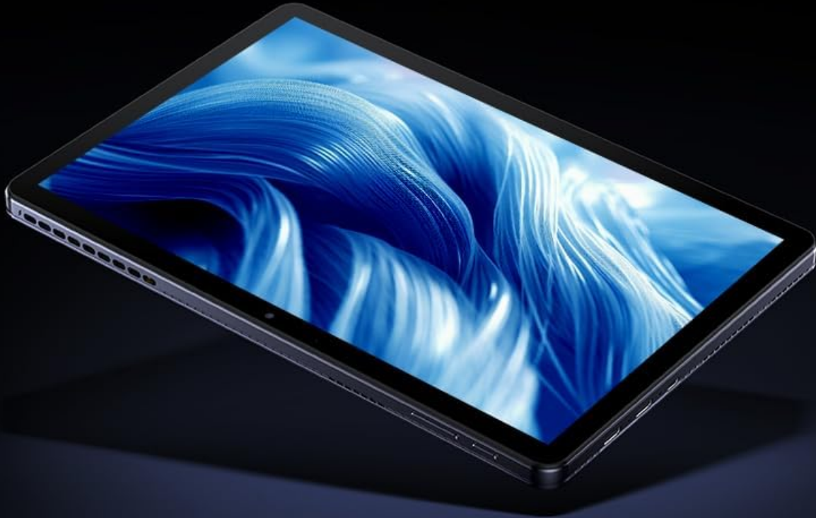
Image: A close-up view of the tablet's 10.1-inch HD display, showcasing its visual quality and aspect ratio for an immersive viewing experience.