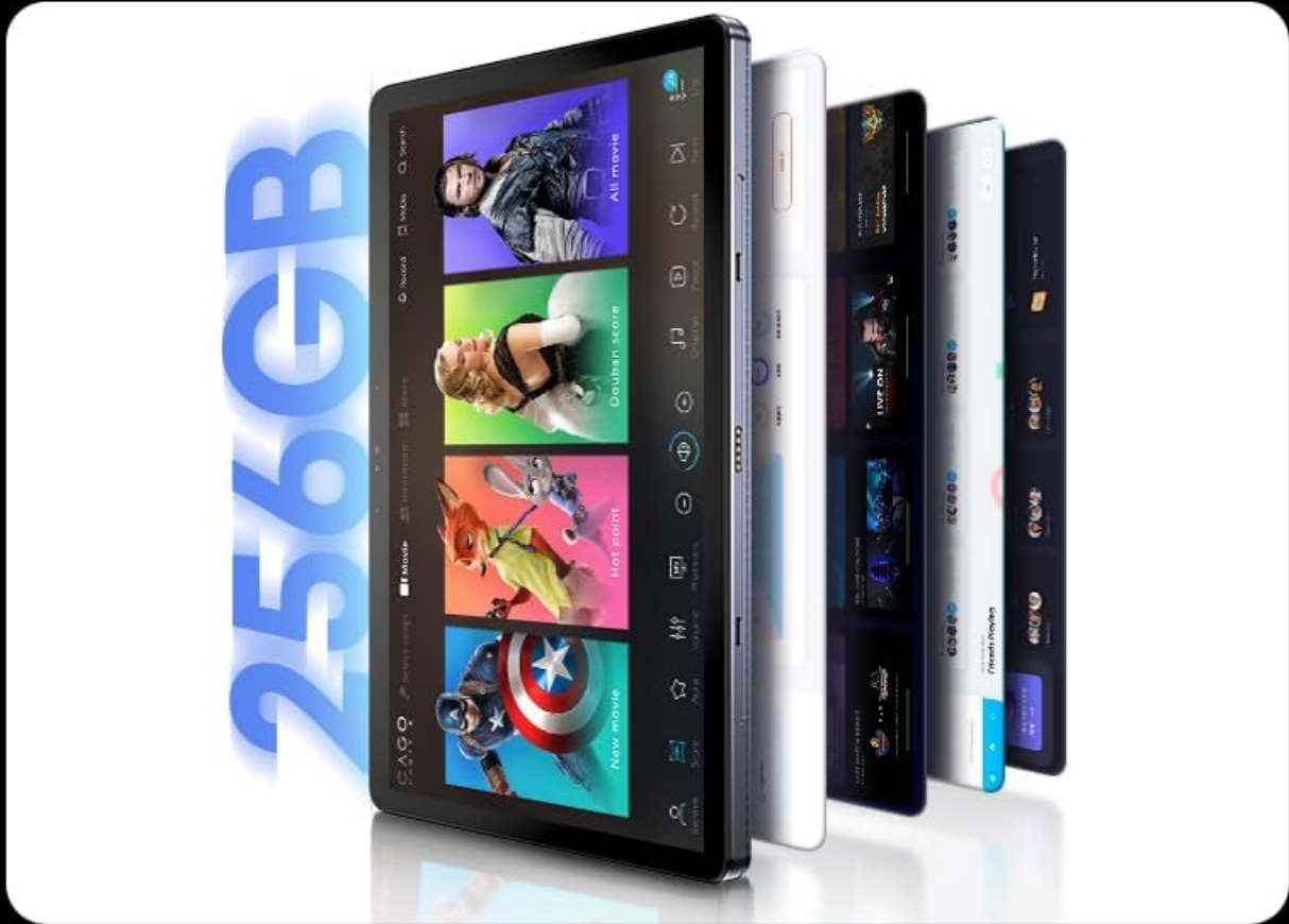
Image: A graphic highlighting the tablet's ample storage and speed, featuring 8GB LPDDR5 RAM and 256GB SSD.