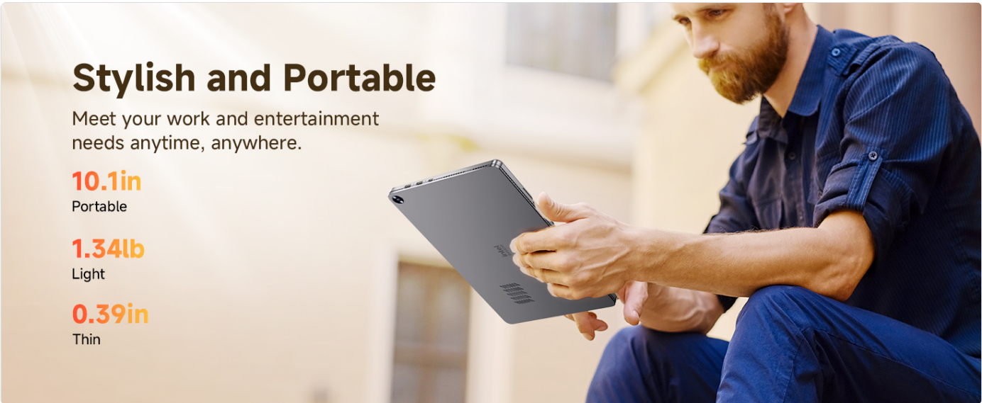
Image: A person holding the CHUWI Hi10 X1 tablet, emphasizing its stylish, thin, and portable design, weighing 1.34lb and measuring 0.39in thin.