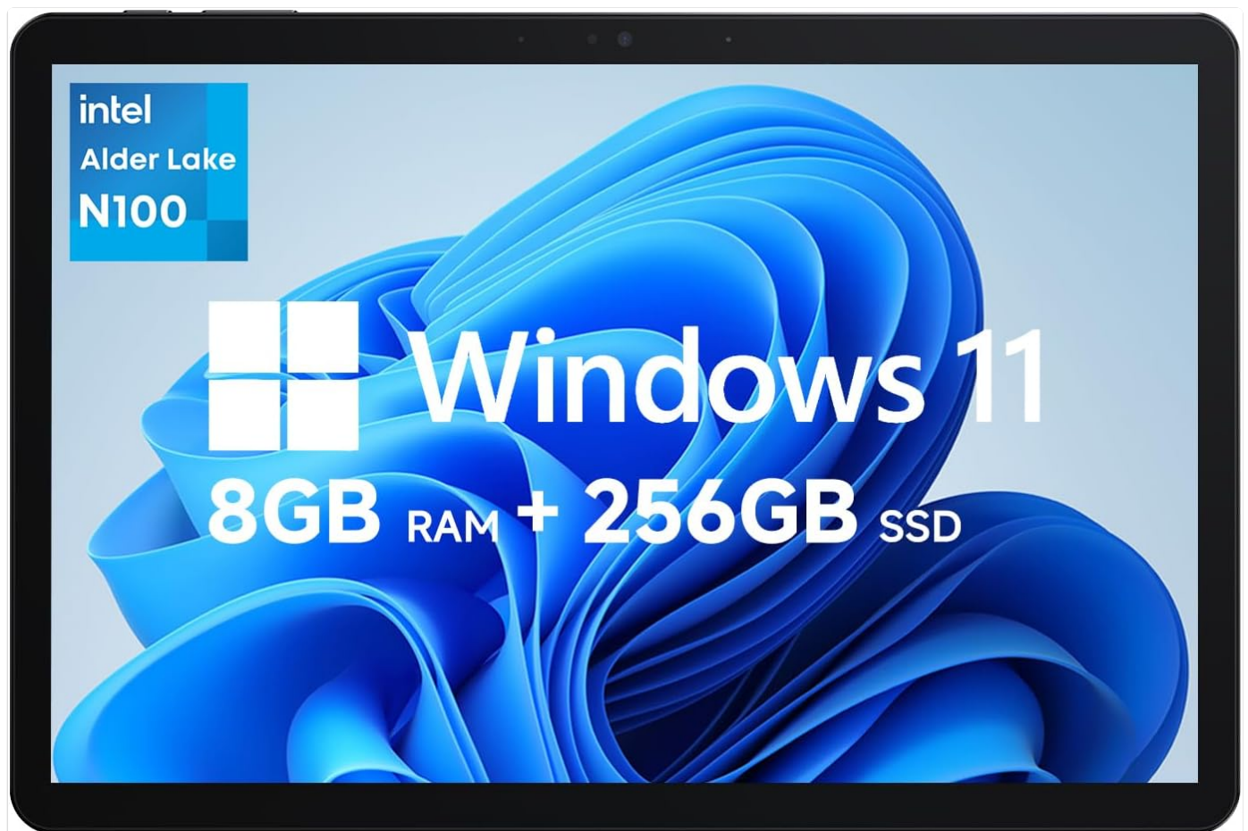
Image: Front view of the CHUWI Hi10 X1 tablet displaying the Windows 11 desktop, highlighting its Intel N100 processor, 8GB RAM, and 256GB SSD.

This manual provides essential information for the operation, maintenance, and troubleshooting of your CHUWI Hi10 X1 Windows 11 Tablet. Please read this manual thoroughly before using the device to ensure proper functionality and longevity.