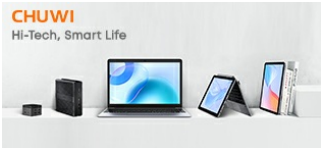
Image: The official CHUWI brand logo, representing the manufacturer of the tablet.