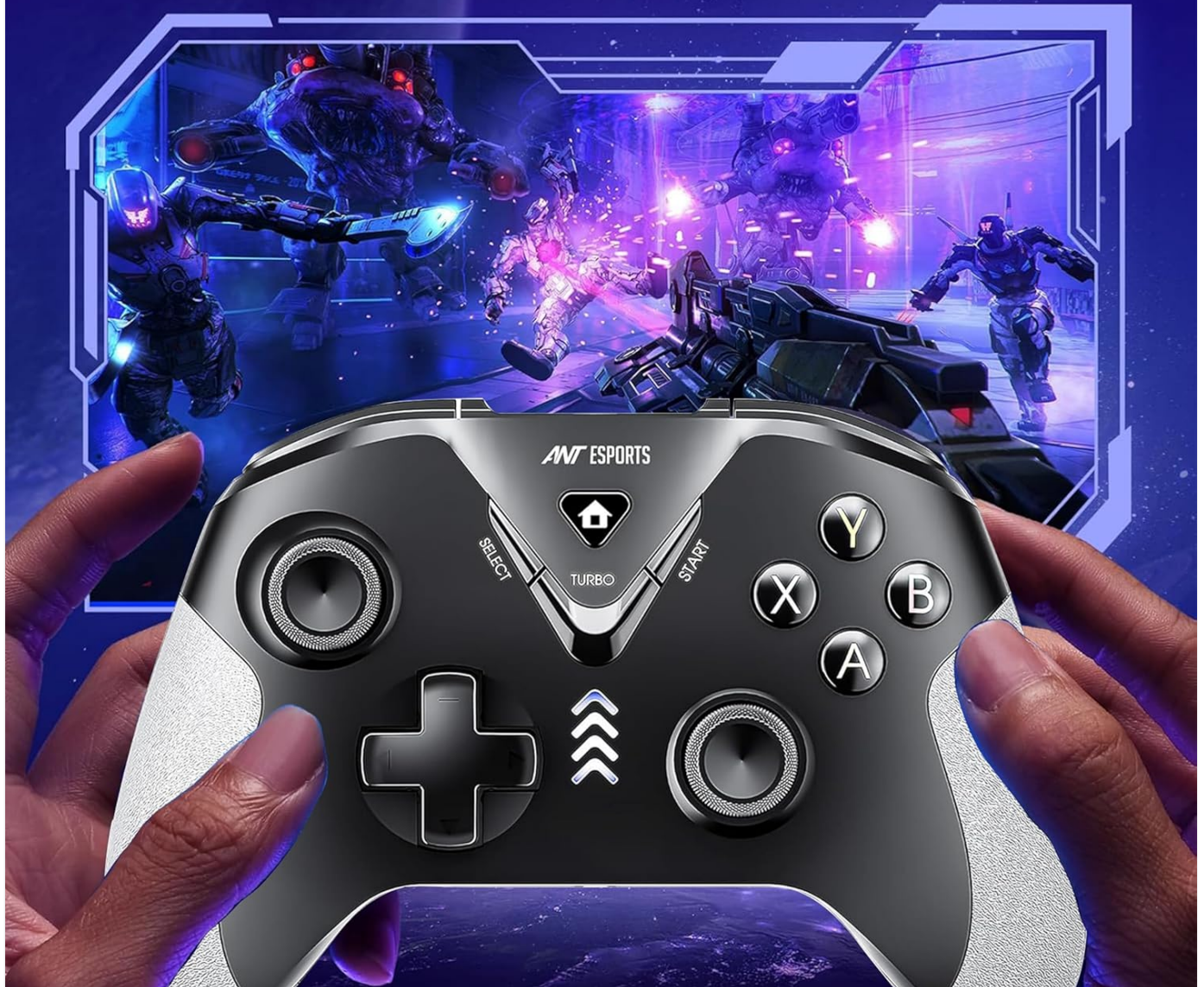
Figure 1: Front view of the Ant Esports GP365 Pro Wireless Controller, showcasing its ergonomic design and button layout.

MATT FINISH GRIPS AND XBOX STYLE JOYSTICK PLACEMENT