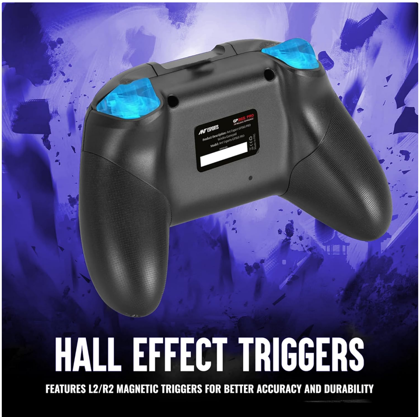
Figure 7: Close-up of the L2/R2 Hall Effect magnetic triggers, designed for accuracy and durability.