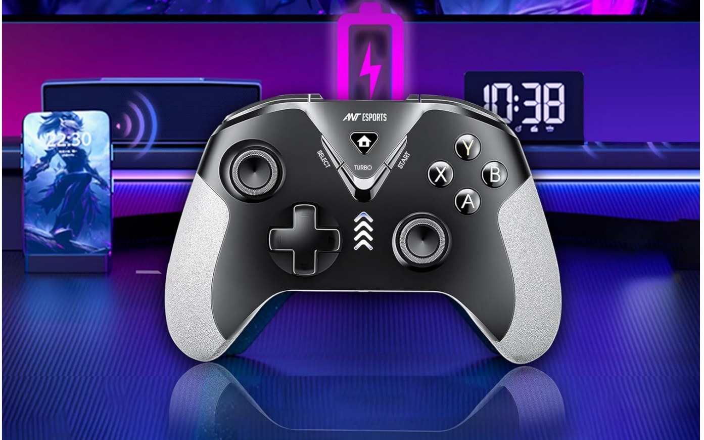
Figure 5: The controller with its 2.4 GHz wireless dongle, enabling a stable connection.

allows for longer wireless gaming sessions