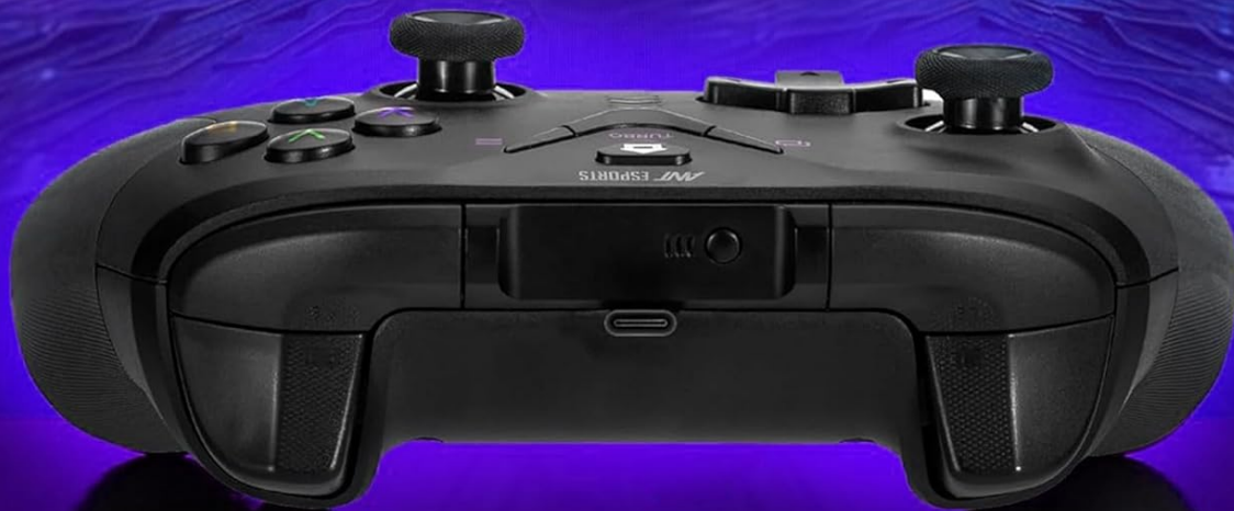
Figure 2: Side view of the controller, highlighting the shoulder and trigger buttons.