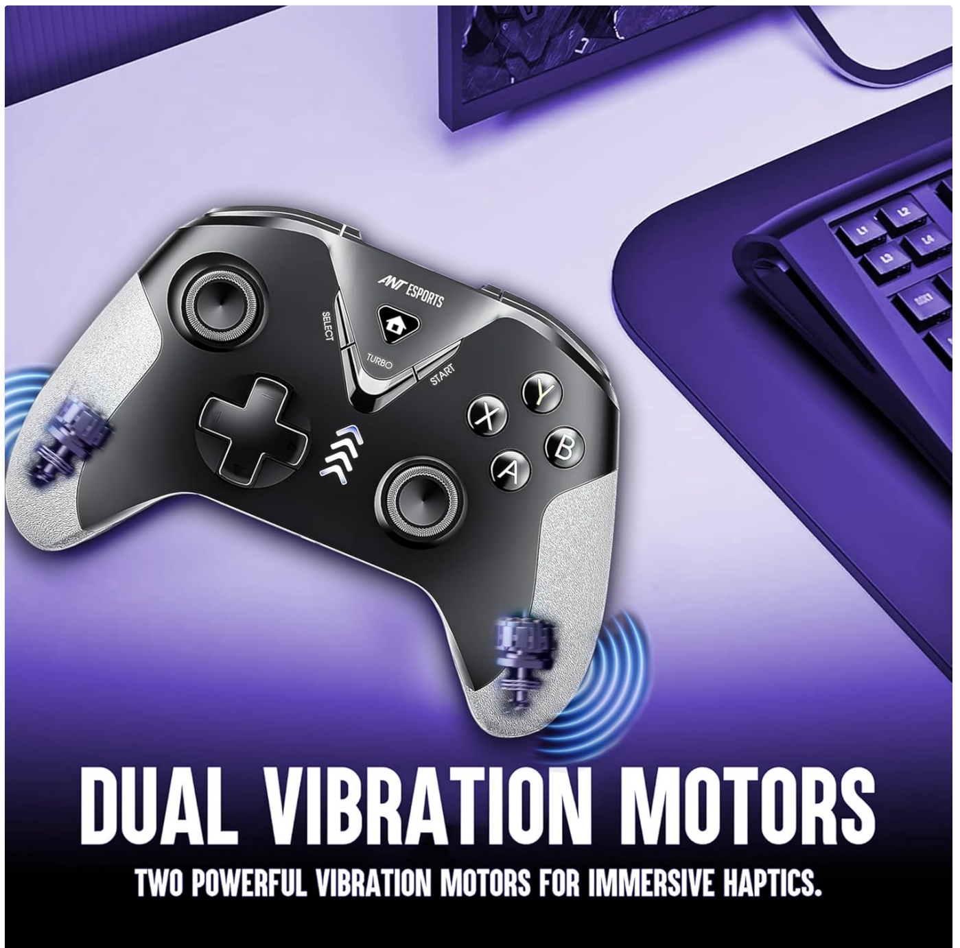
Figure 6: Illustration of the dual vibration motors providing immersive haptic feedback.