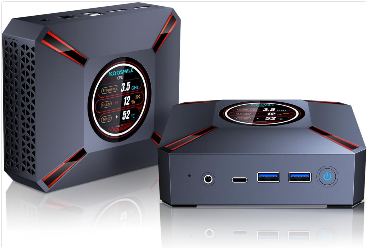
Image: The KOOSMILE Mini PC shown with its various ports and a view of the smart display. The image also depicts the compact size of the device.