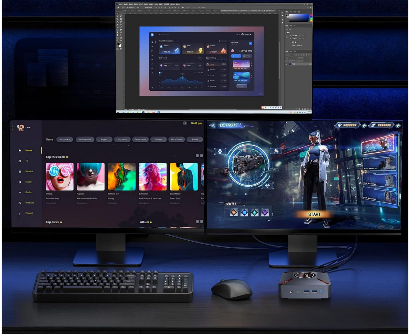
Image: A setup demonstrating the Mini PC's triple-screen expansion capability, showing three monitors connected for multitasking and increased productivity.

Supports: 8K DP, 4K HDMI, and Full-feature