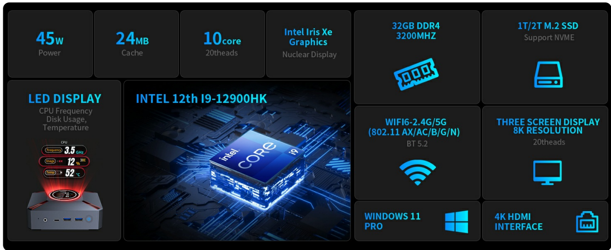
Figure 1.2: Overview of the Mini PC's core features, including its powerful processor, memory, storage, and connectivity options.