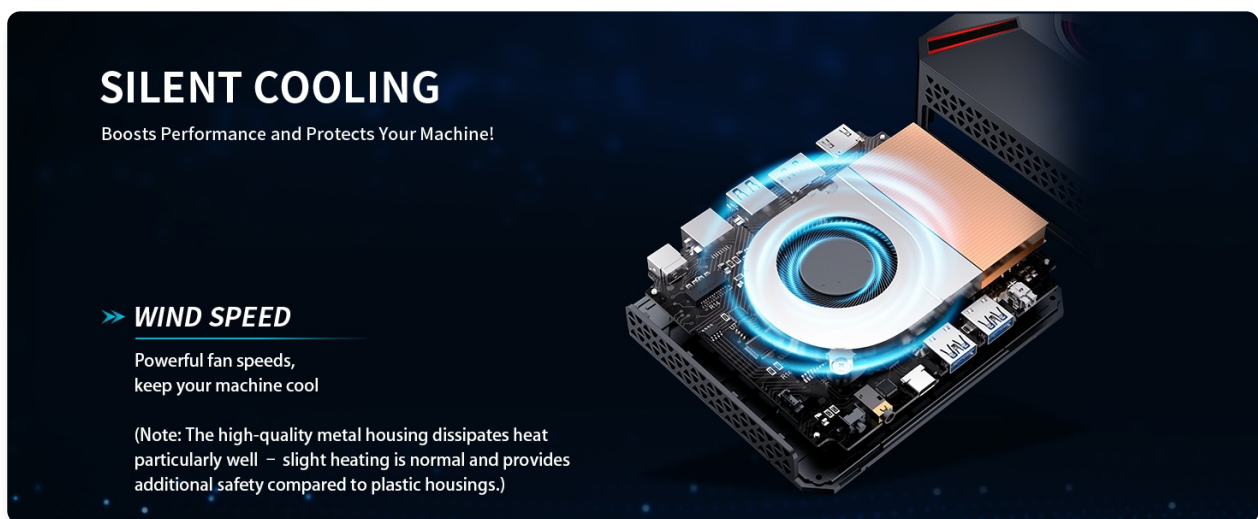
Figure 6.1: Internal view highlighting the efficient cooling system with its copper fan, designed to maintain optimal operating temperatures.

The Mini PC features an advanced copper cooling fan and multiple vents for efficient heat dissipation. This system is designed to keep your PC running smoothly even under intense tasks.