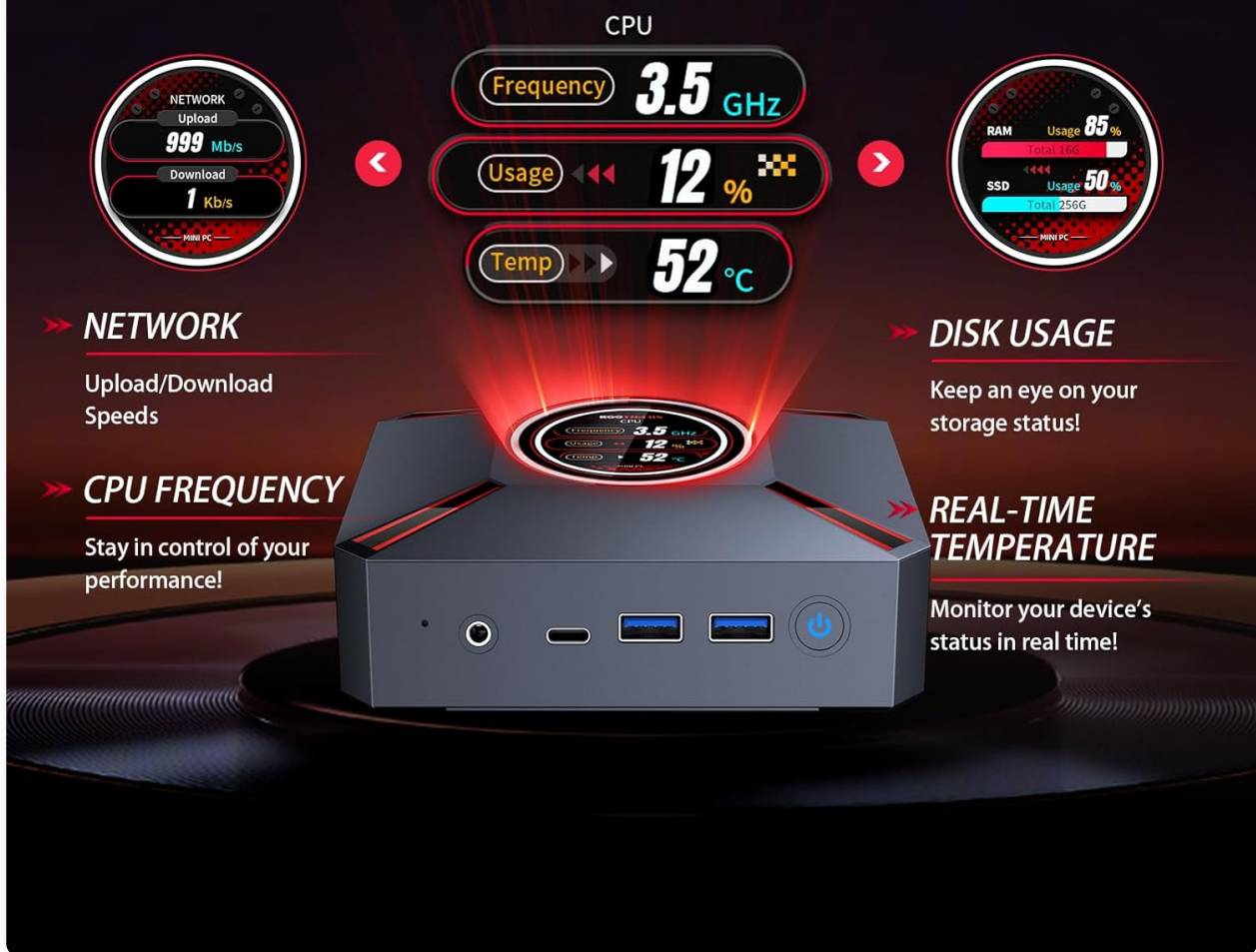
Figure 3.3: The smart display interface, showing real-time data such as CPU frequency, usage, temperature, network upload/download speeds, and disk usage.

Keep an eye on your most important data at all times