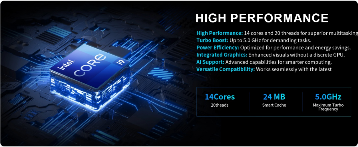
Figure 8.1: Key specifications of the Intel Core i9-12900HK processor, highlighting its core count, threads, cache, and maximum turbo frequency.