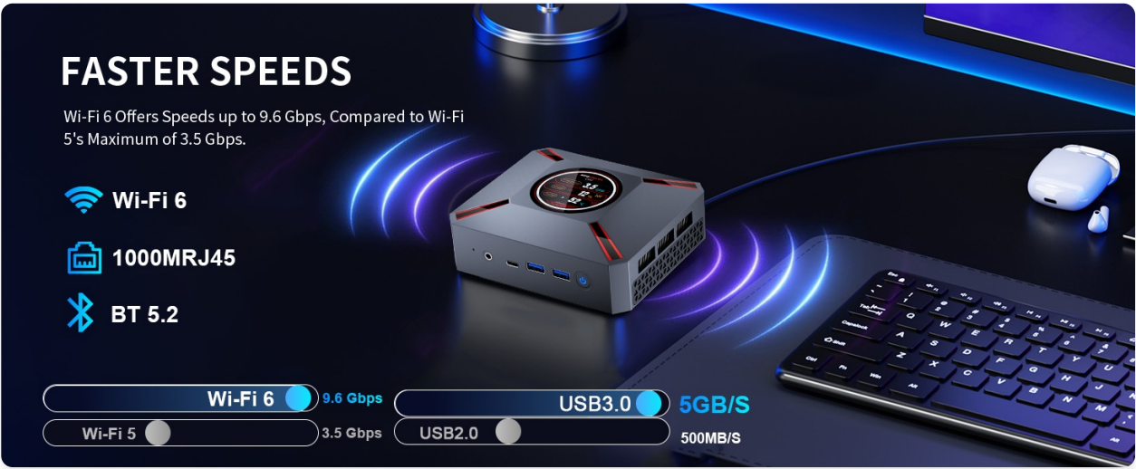
Figure 8.3: Comparison of wireless and wired connectivity speeds, highlighting the advantages of Wi-Fi 6 and USB 3.0.