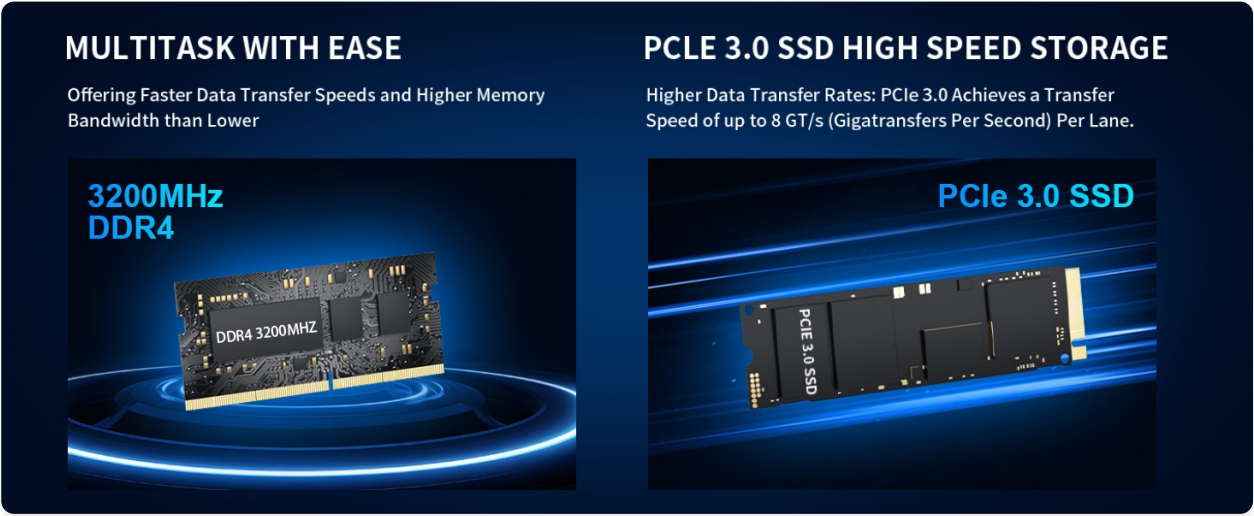
Figure 8.2: Information on the high-speed DDR4 memory and PCIe 3.0 SSD, crucial for fast data processing and quick loading times.