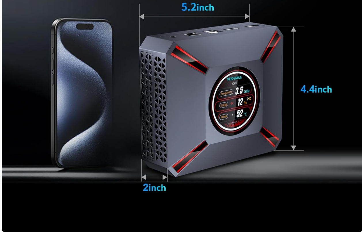
Figure 3.1: The compact size of the Mini PC, approximately 5.2 inches in length, 4.4 inches in width, and 2 inches in height, shown next to a smartphone for scale.

Your Gateway to the World of Technology.