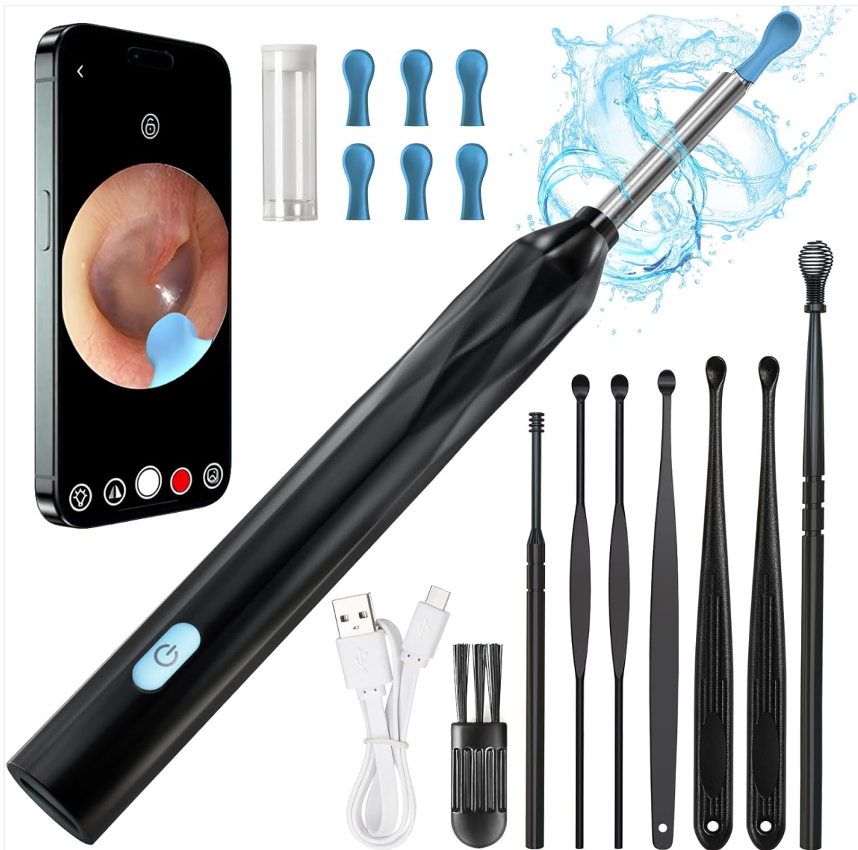
Figure 3.1: All components included in the product package.