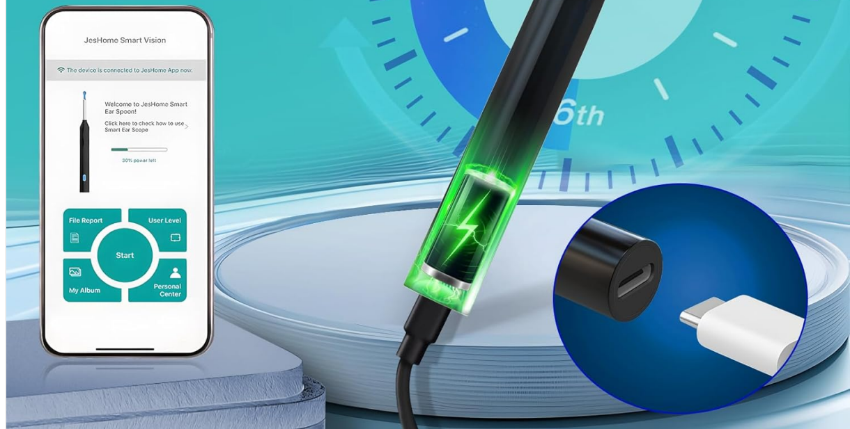
Figure 2.2: Battery and charging specifications for the device.