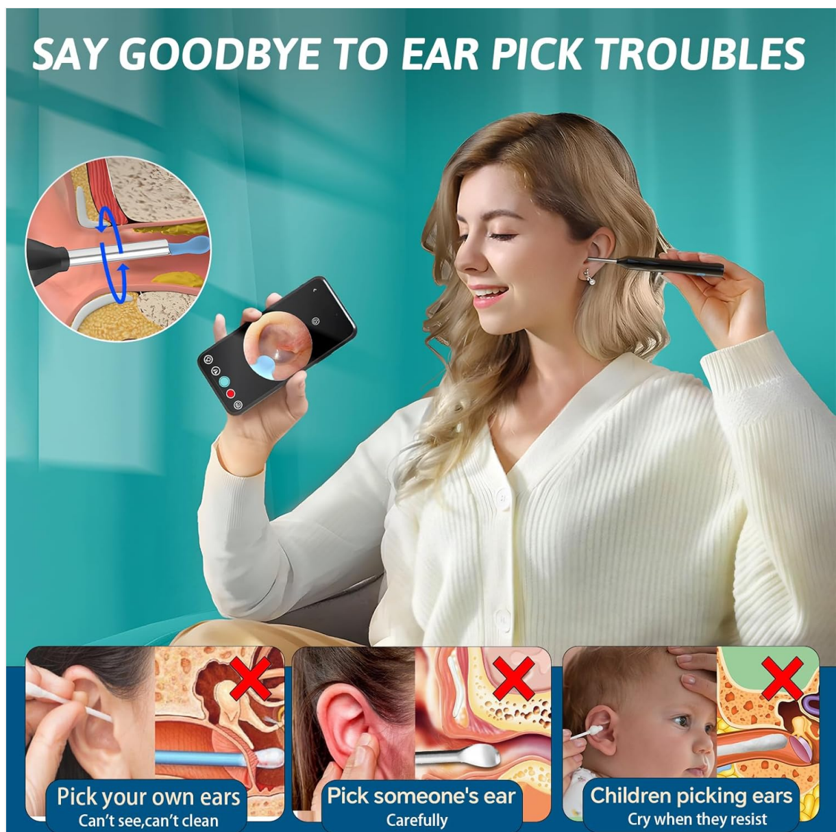
Figure 5.1: Proper usage of the ear wax removal tool for safe and effective cleaning.