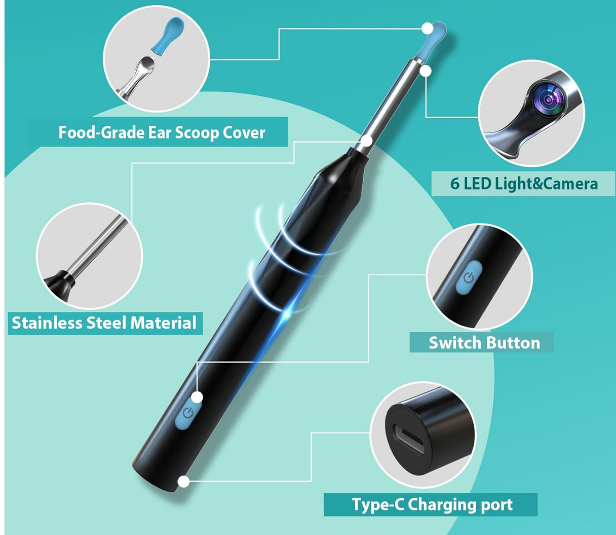
Figure 2.1: Key components of the ear wax removal tool, including the camera, LED lights, and charging port.