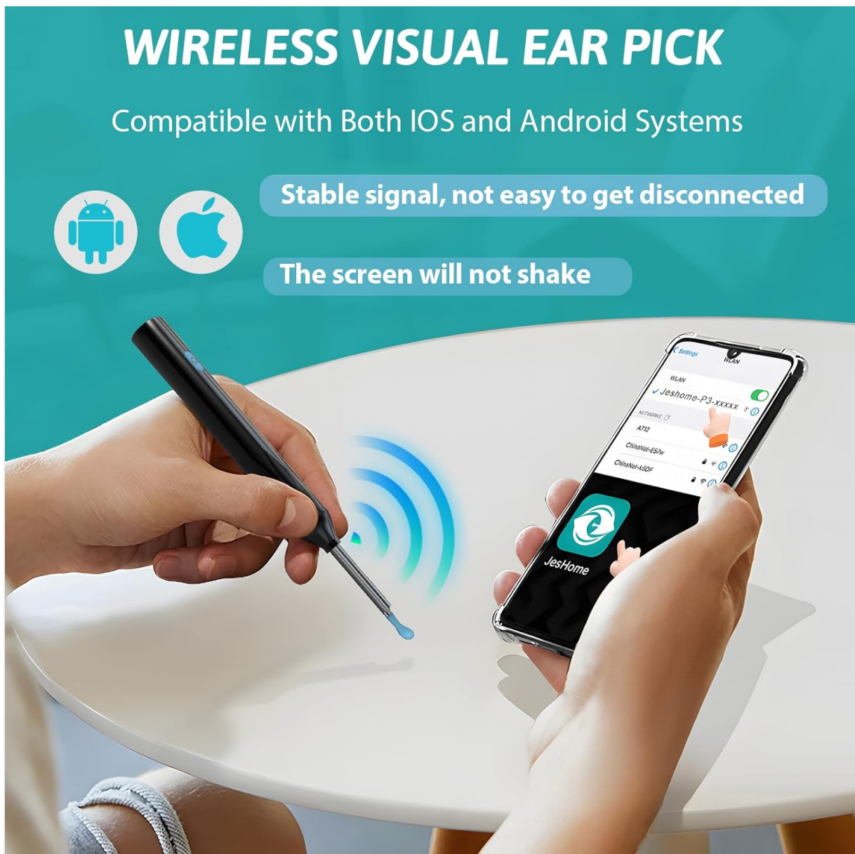
Figure 4.2: Device compatibility with iOS and Android operating systems.