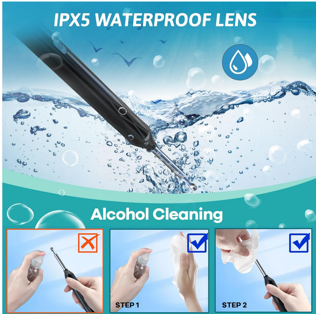
Figure 6.1: Cleaning instructions for the device, highlighting its waterproof lens.