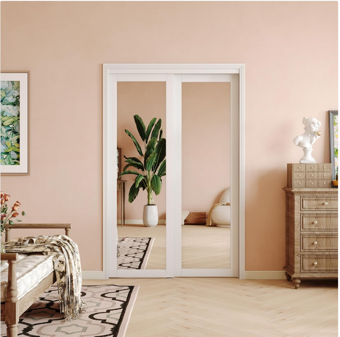
Figure 3: An example of the SOLRIG sliding mirror doors installed, demonstrating their aesthetic and functional integration into a living space.