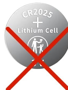
Image: A visual comparison showing the new design utilizing AAA 1.5V batteries for extended life (3-5 years) versus an older design using coin cell batteries with a shorter lifespan (0.5-1 year).