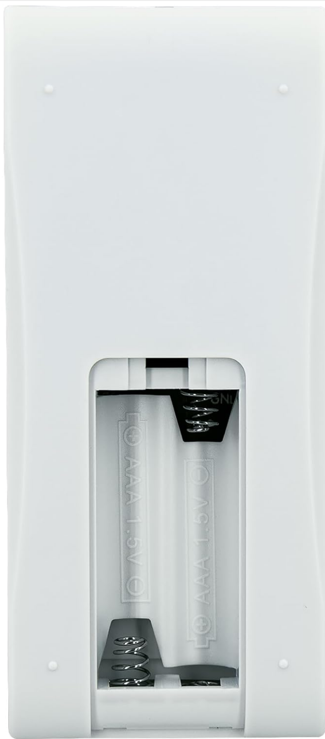
Image: The open battery compartment of the remote control, illustrating where to insert two AAA 1.5V batteries.

Note: This remote control is designed for AAA 1.5V batteries, offering a longer lifespan compared to older coin cell battery designs.