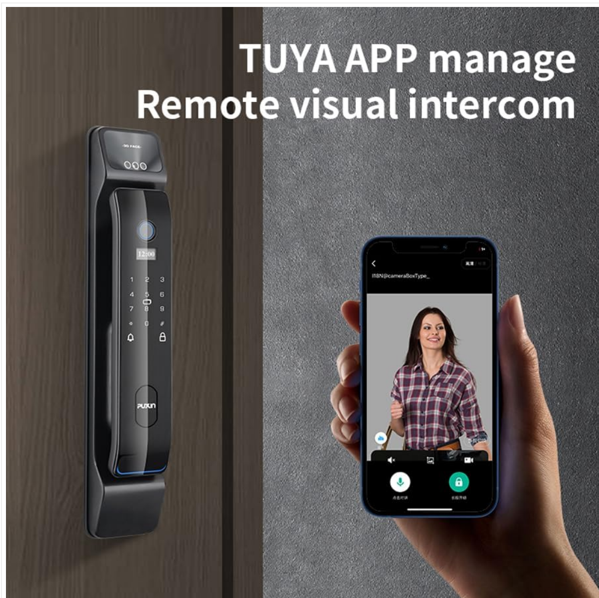
Image 5.1: The Tuya app demonstrating remote visual intercom and management features.

b. Temporary Passwords: Generate time-limited or one-time passwords through the app for guests or service providers.