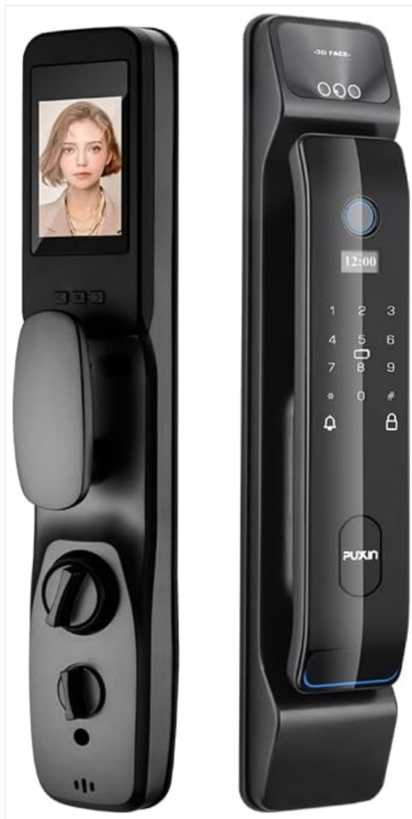
Image 1.1: Front and back view of the Generic DF65 3D Face Recognition Smart Lock.