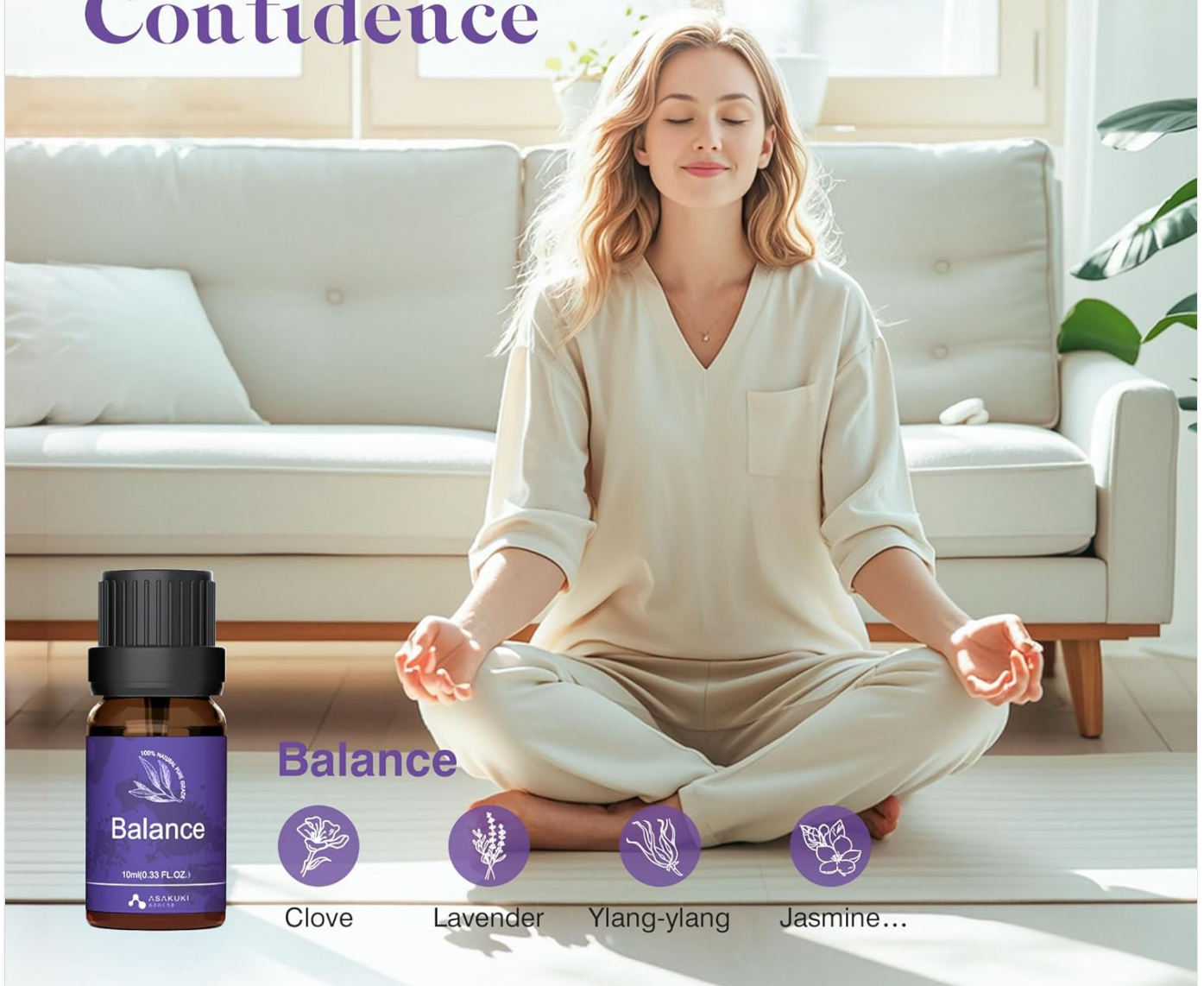
Image: A bottle of "Balance" essential oil blend, with icons representing its key ingredients: Clove, Lavender, Ylang-ylang, and Jasmine. A person is shown meditating, suggesting the oil's benefit for inner balance.