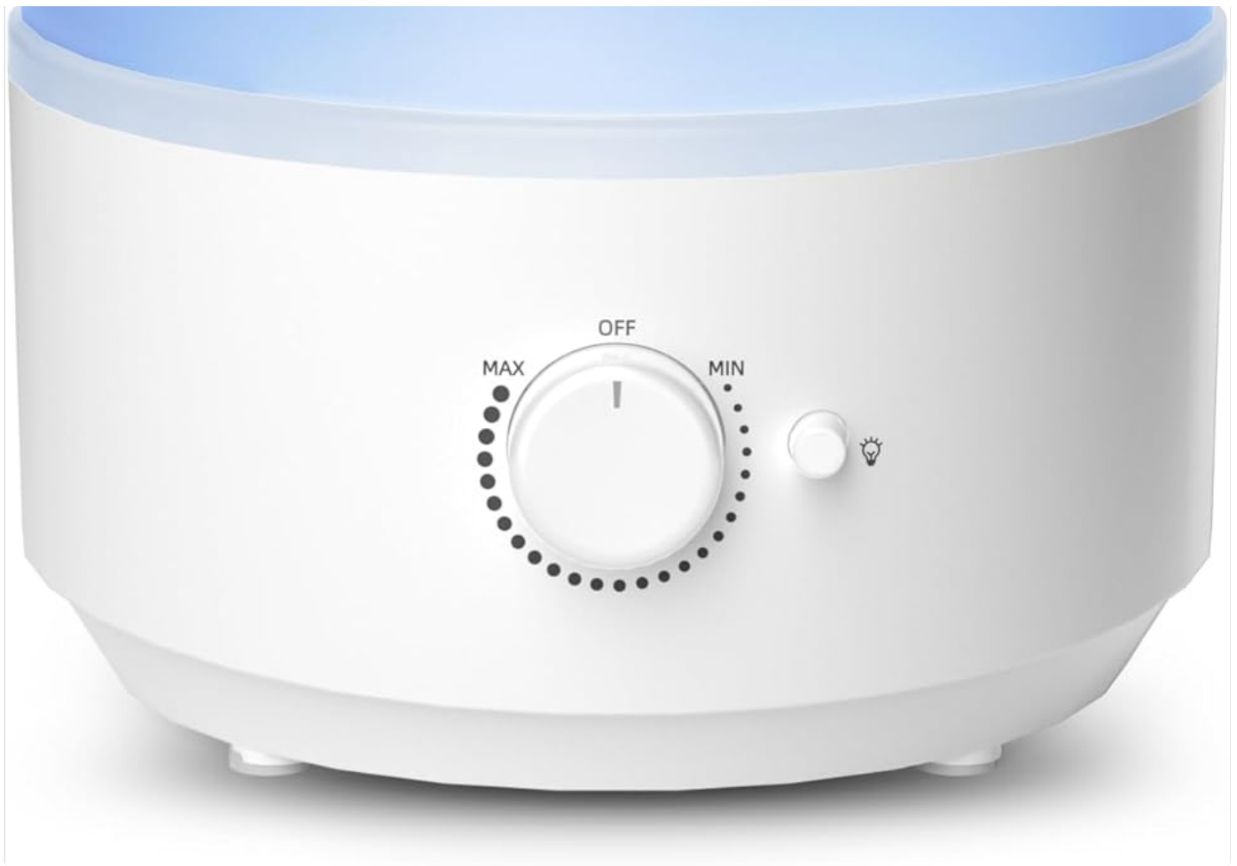
Image: The ASAKUKI Humidifier operating with its blue night light illuminated, showing the water level and control knob.