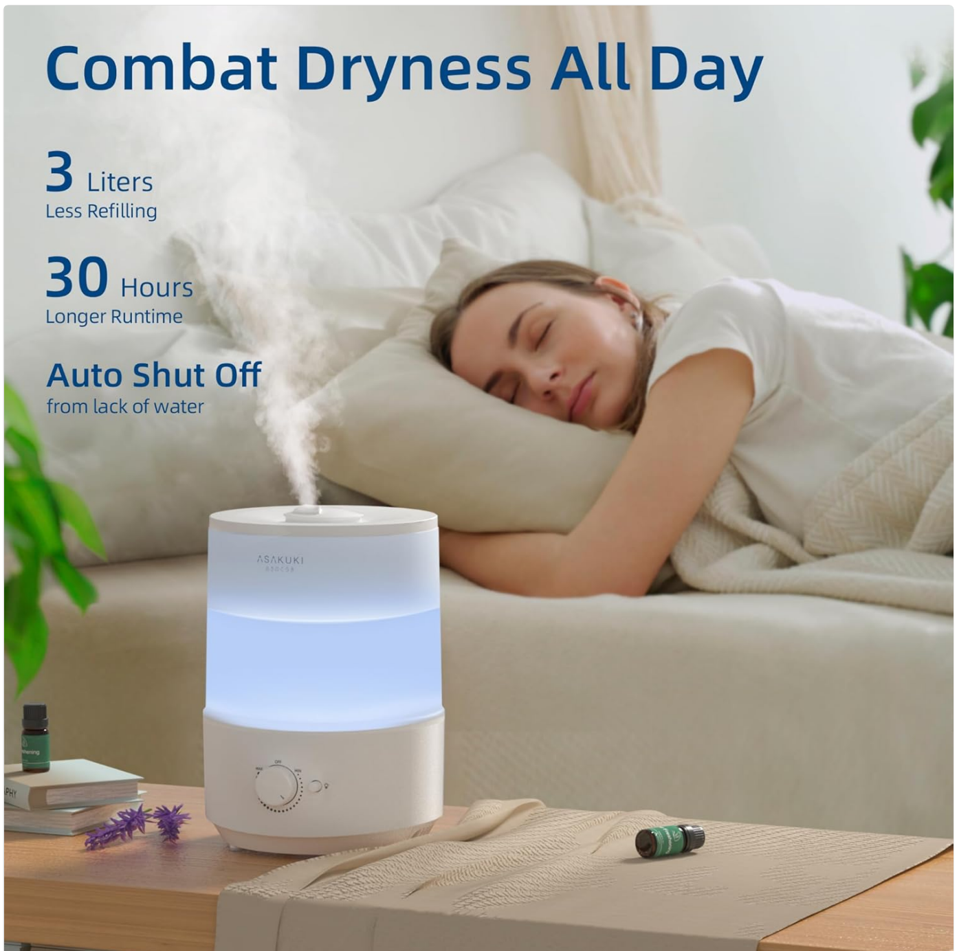
Image: The ASAKUKI Humidifier placed on a bedside table in a bedroom, demonstrating its ability to provide continuous comfort for up to 30 hours and its auto shut-off feature when water is low.