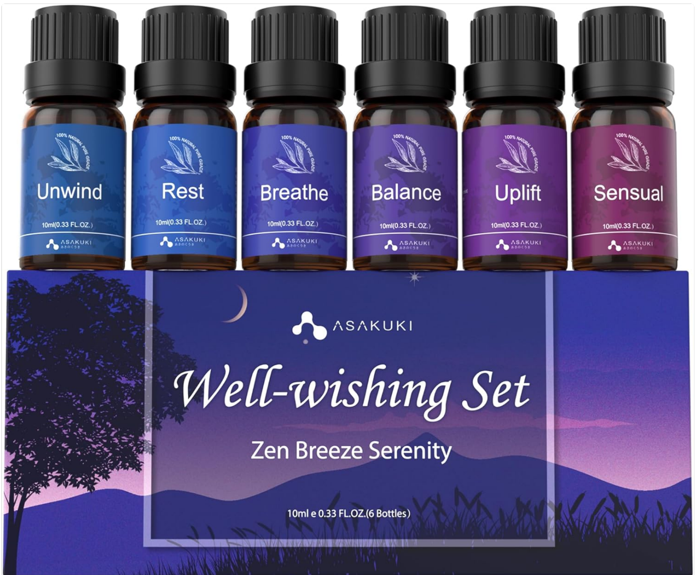
Image: A close-up view of the "Well-wishing Set" of six essential oil blends, including "Unwind," "Rest," "Breathe," "Balance," "Uplift," and "Sensual."