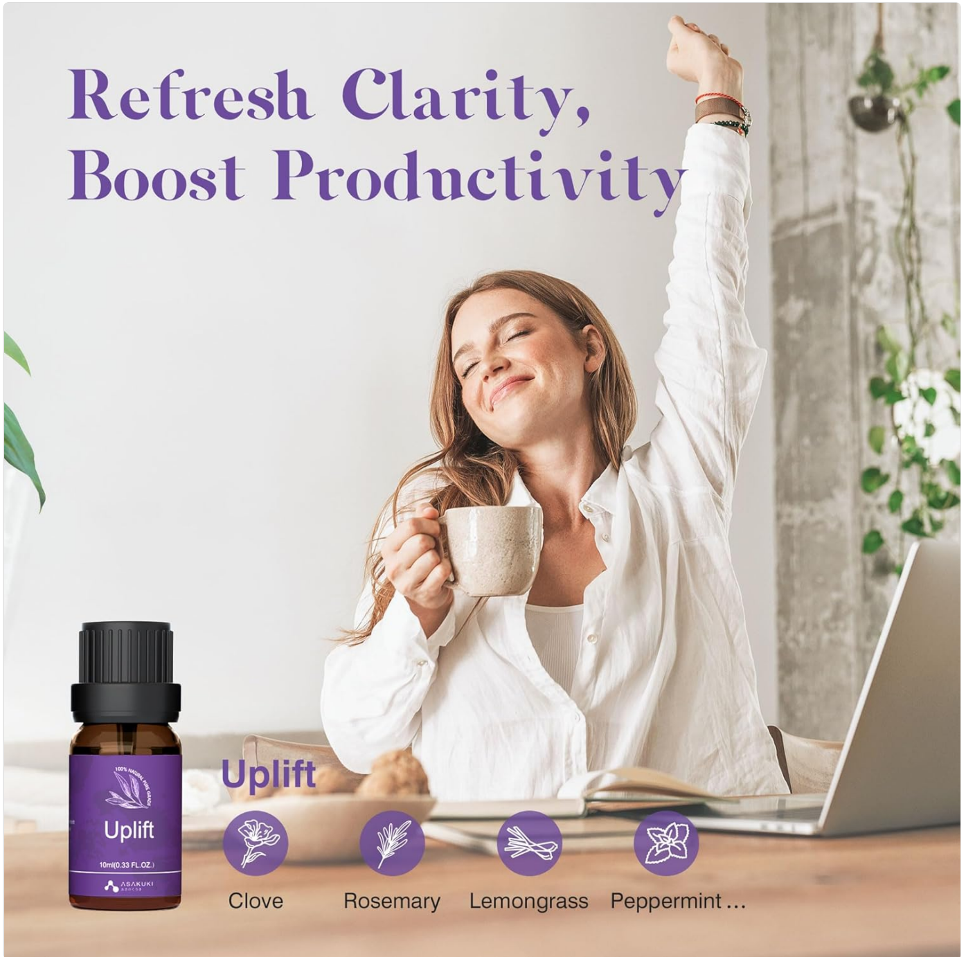
Image: A bottle of "Uplift" essential oil blend, with icons representing its key ingredients: Clove, Rosemary, Lemongrass, and Peppermint. A person is shown working, suggesting the oil's benefit for productivity.