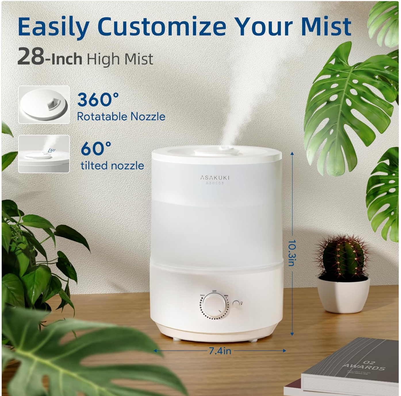
Image: The ASAKUKI Humidifier showing its dimensions (10.3 inches height, 7.4 inches width) and highlighting features like the 360° rotatable nozzle and 60° tilted nozzle for customizable mist direction.