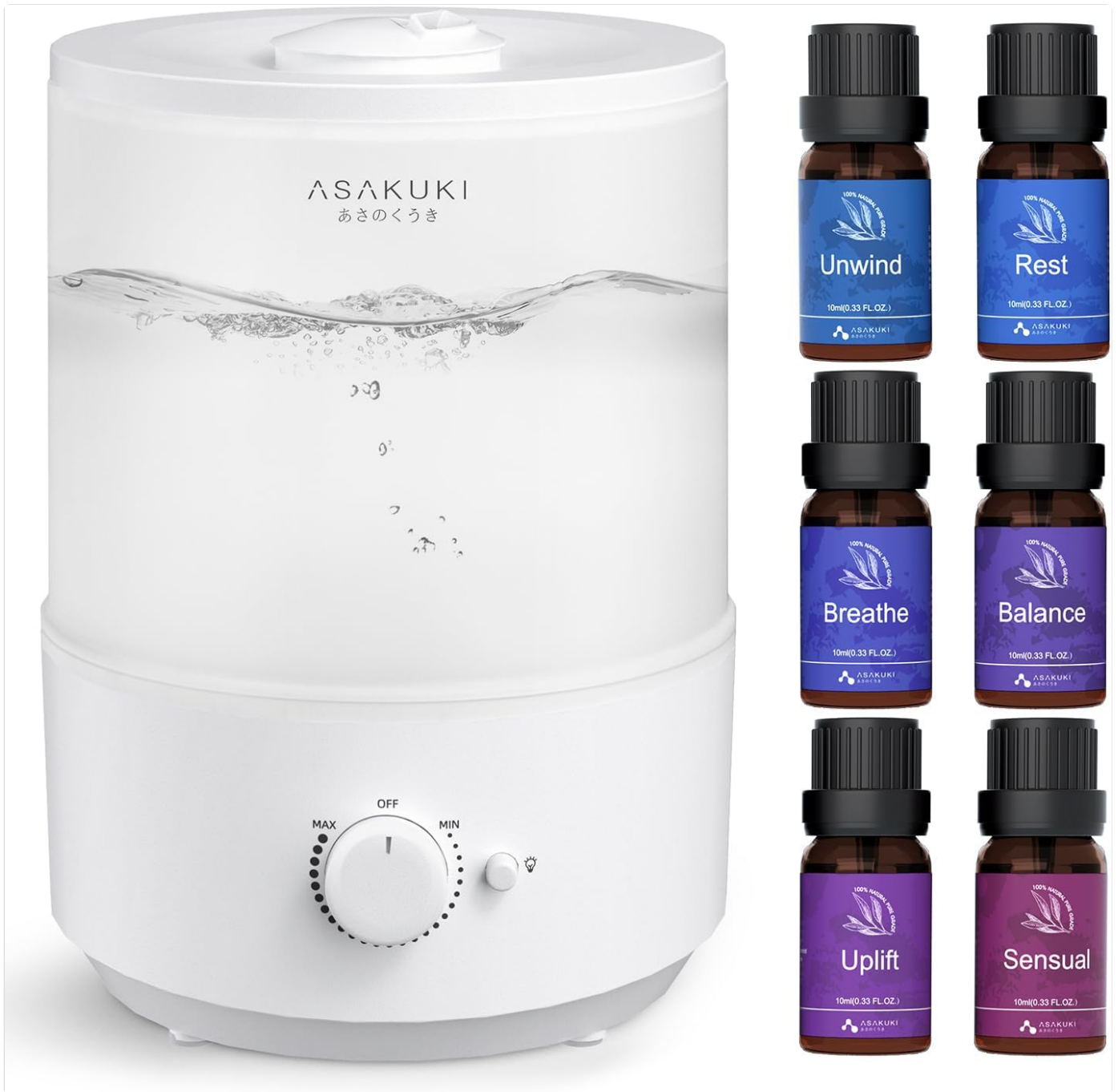
Image: The ASAKUKI 3L Humidifier unit shown alongside the six bottles of essential oil blends included in the package.