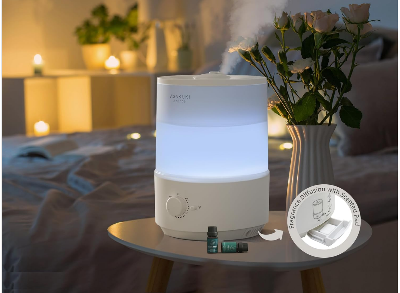
Image: The ASAKUKI Humidifier functioning as both a humidifier and an oil diffuser in a bedroom setting, with essential oil bottles visible near the aromatherapy tray.