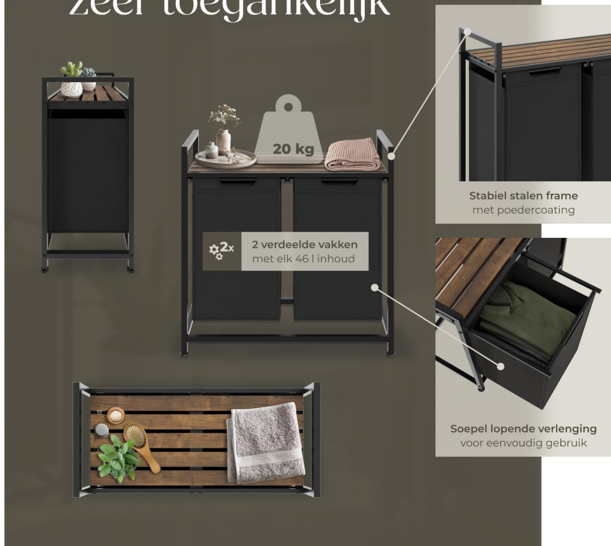
Figure 2: Close-up view highlighting the stable steel frame and the smooth extension mechanism for the laundry bags.